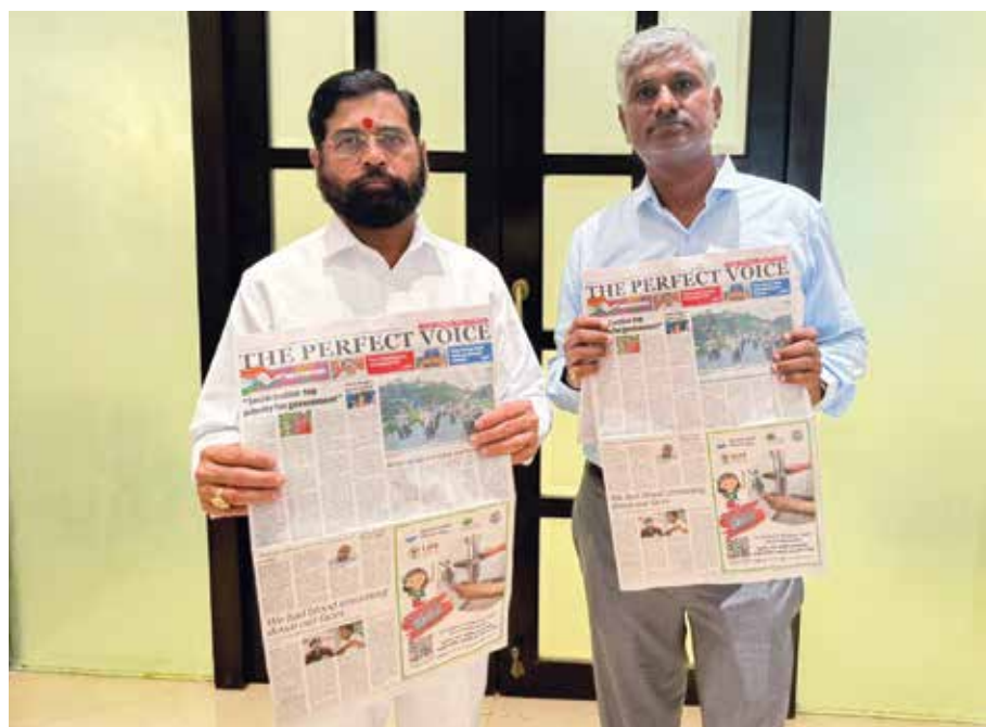
Chief Minister Eknath Shinde appreciated the inaugural edition of The Perfect Voice on Thursday.

This is the third such incident in Thane district in last couple of months. The residents have complained that the miscreants are roaming free without fear of the law. They have demanded that strict action should be taken against the culprits and the girls should be provided protection.