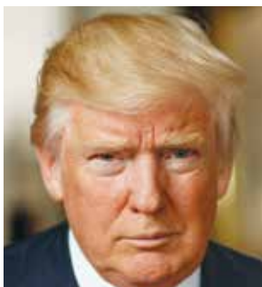
Donald Trump former President, US

"You know why she hasn't done an interview? She's not smart. She's not intelligent. And we've gone through enough of that with this guy, crooked Joe."