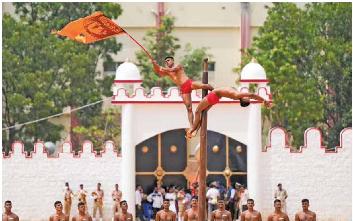
Army personnel perform 'Mallakhamb' during the 78th Independence Day celebration at Manekshaw Parade Ground, in Bengaluru on Thursday.

"It depends how many Test matches they play, but if they're playing 10 to 14 Test matches a year and if you're scoring 800 to 1,000 runs a year, then that sort of says he's only three or four years off getting there. So that'll take him to 37 (years of age)," said the legendary Australian. Ponting said Root will need to remain hungry for runs and the England batter has got the age on his side to aim for the Test record.