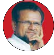
By Rajan Rajee

The conclusion of the 16th Lok Sabha Election was aptly termed the Rockefeller Moment for Corporate India. The real economic power shifted towards crony capitalists or oligarchs, with influence now flowing from the Corporate Club 2.0.