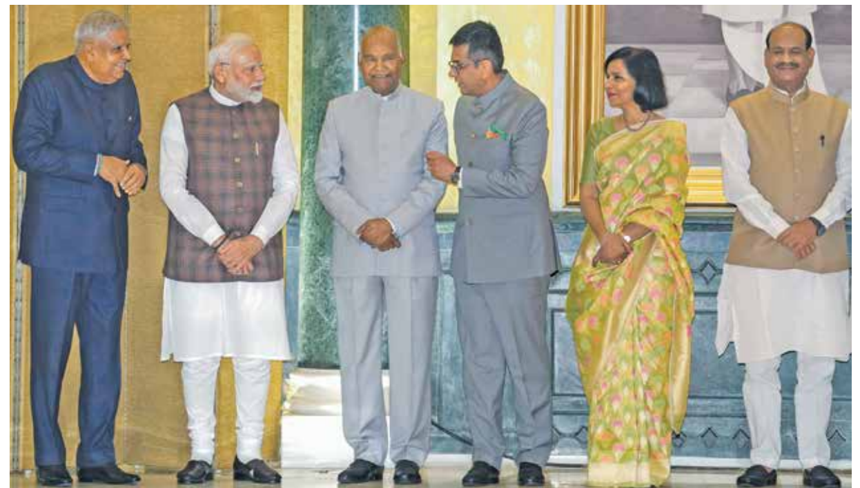
Vice President Jagdeep Dhankhar, Former President Ram Nath Kovind, Prime Minister Narendra Modi, Chief Justice of India DY Chandrachud and Lok Sabha Speaker Om Birla during the 'At Home' reception hosted by President Droupadi Murmu on Thursday.