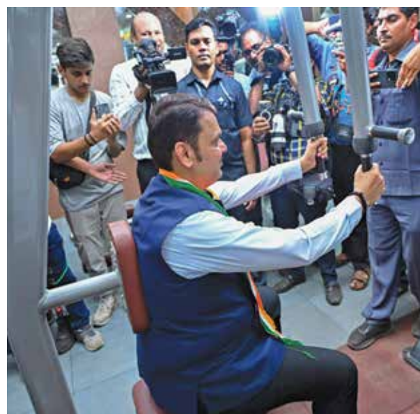
Maharashtra Deputy Chief Minister Devendra Fadnis during inauguration of a Taluka Sports Complex at Koradi near Nagpur on Thursday.