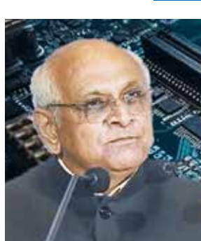
Bhupendra Patel CM, Gujarat

"We have so far attracted an investment of Rs 1 lakh crore in the electronics and semiconductor sector and India's first semiconductor chip will be manufactured in Gujarat."