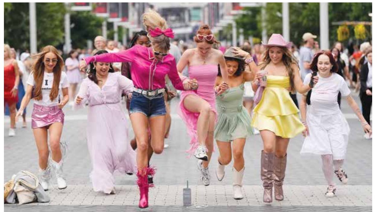
Fans of singer Taylor Swift, called Swifties, arrive at Wembley Stadium in London on Thursday for the first of five concerts of Taylor Swift's Eras Tour.

This will be the first election since Sri Lanka plunged into economic crisis when the island nation declared sovereign default in mid-April of 2022, its first since gaining independence.