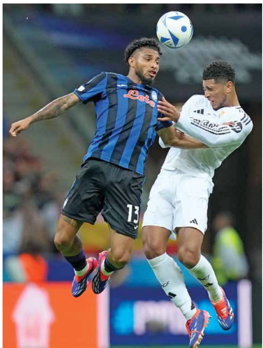
Real Madrid's Jude Bellingham jumps for the ball with Atalanta's Ederson, left, during the UEFA Super Cup Final soccer match between Real Madrid and Atalanta at the Narodowy stadium in Warsaw, Poland on Wednesday.