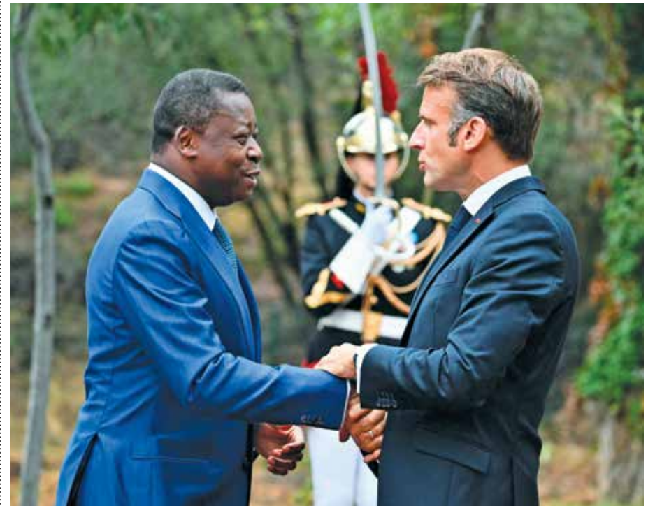
French President Emmanuel Macron welcomes Togo's President Faure Gnassingbe during a ceremony marking the 80th anniversary of the Allied landings in Provence during World War II, at the Bouldour National Cemetery in Boulour