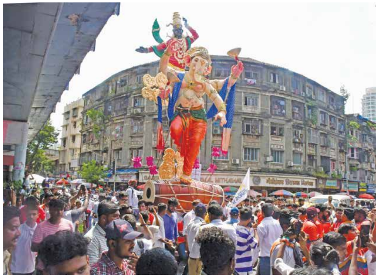
Devotees carry the idol Lord Ganapati to the pandal ahead of the Ganesh Chaturthi festival, in Mumbai on Thursday

The weekday ridership on the Blue Line in 2023 was in the range of 4 lakh to 4.50 lakh. From January to July, it stood at 4.50 lakh to 4.60 lakh. At the beginning of August 2024, it went up to around 4.85 lakh and reached 5,00,385 on August 13.