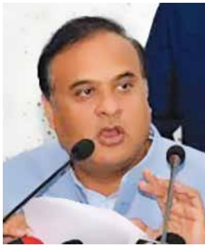
Himanta Biswa Sarma CM, Assam

"The future of Assam is not secure for us. The Hindu-Muslim population balance is declining fast. The Muslim population in 2021 rose to 41 per cent, while the Hindus were down to 57 per cent. The rest is shared by Christians and other communities."