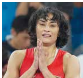
two had India's tricolour flag in their hands when they were manhandled on the road by police.