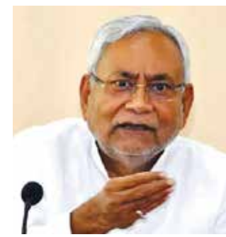
Nitish Kumar CM, Bihar

"You are just 69? Then why do you look so haggard? Look at me I am 74".