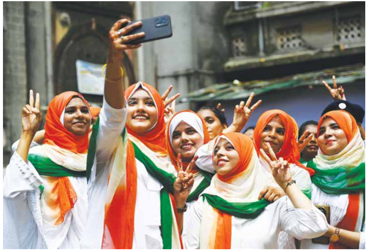
Students of Anjuman-E-Islam School and College celebrate Independence Day, at CSMT, in Mumbai on Thursday