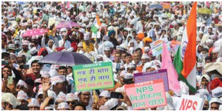
The government employees have been demanding Old Pension Scheme since a long time. File picture

The scheme guarantees an assured minimum pension of Rs 10,000 per month on superannuation after a minimum of 10 years of service. About 23 lakh central government employees would benefit from the UPS, Railways Minister