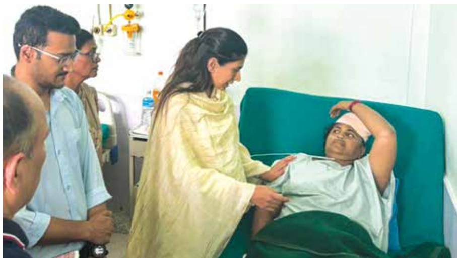
Union Minister of State for Youth Affairs and Sports Raksha Khadse meets injured people who are being treated, at Tribhuvan University Teaching Hospital in Kathmandu, Nepal on Saturday.

Bodies of two people – the bus driver and his as-