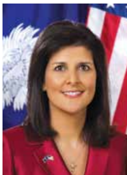
Nikki Haley, former US Ambassador to the United Nations

"I think that all of that strength that we showed is the reason that we didn't see any wars, we didn't see any invasions, we didn't see any harm that happened during that time. I think Donald Trump would bring that back."