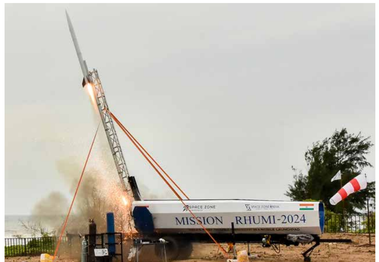
Space Zone India on Saturday launched its first reusable hybrid rocket, Mission RHUMI-2024, onboard a mobile platform to take up research on global warming and climate change.

"The launch of hybrid rocket through our Hydraulic mobile launchpad is a first-of-its-kind initiative that sets a new benchmark in aerospace technology."