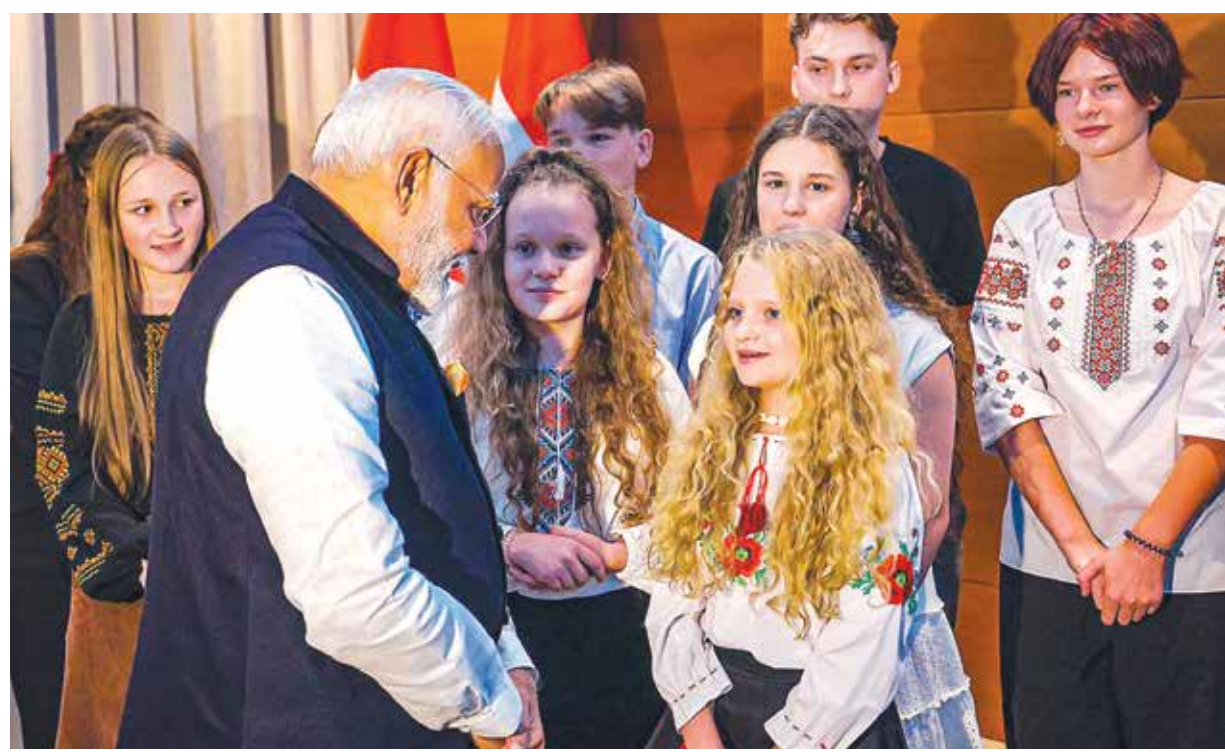
Prime Minister Narendra Modi interacts with Ukrainian students who are learning Hindi language at the School of Oriental Studies, in Kyiv, Ukraine.

His agency had documented that "both the military and the Arakan Army, which now controls most of the townships in Rakhine, have committed serious human rights violations and abuses against the Rohingya, including extrajudicial killings, some involving beatings, abductions, forced recruitment, indiscriminate bombardments of towns and villages using drones and artillery, and arson attacks."