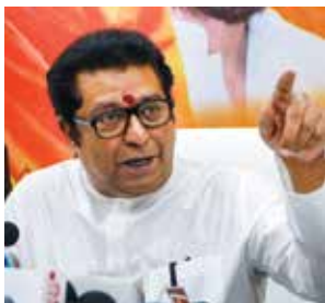
Raj Thackeray President, Maharashtra Navnirman Sena

"A huge portion of Dalits and Muslims voted against the BJP. These votes against Prime Minister Narendra Modi and (Union Home Minister) Amit Shah went to Uddhav Thackeray, Sharad Pawar and the Congress. These were not votes for the Maha Vikas Aghadi. This wave is now gone."