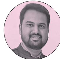
By Mangesh Kulkarni

The hot seat of Reserve Bank of India's Governor has, for the second consecutive year, been recognized as the top central banker globally by the US-based Global Finance magazine. The incumbent in this prestigious position, Shaktikanta Das, defies popular perception—not as a student of economics but as a postgraduate in history with a background in civil services.