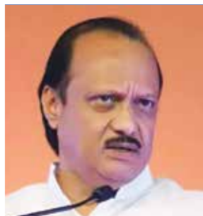
Ajit Pawar, Deputy Chief Minister

"I personally feel that when such perverts lay hand on our mothers-sisters, our daughters, they should face such a legal punishment that they should not think of (repeating the offence) again. To put it in my language, such persons' private organ should be removed. Some people are so vile, that this must be done."