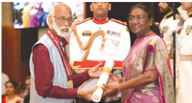
Govindrajan Padmanabhan received first Vigyan Ratna Puraskar.

From his early days at the IISc, where he completed his doctorate, to his tenure as one of the institution's most revered figures, his career has been defined by a quiet tenacity. His early foray into microbial genetics laid the groundwork, but it was his pivot to biochemistry that solidified his standing in the scientific community.