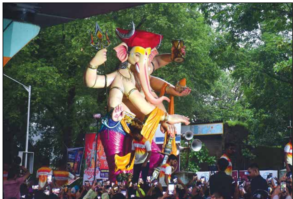
Devotees carry an Idol of lord Ganesha through the street, ahead of Ganesh Chaturthi Festival, in Mumbai on Saturday.

er generation is expected to be 45.09 million units. Sakri-1 was commissioned on 21st august and connected to 220/33 KV Shivajinagar Sakri substation successfully.