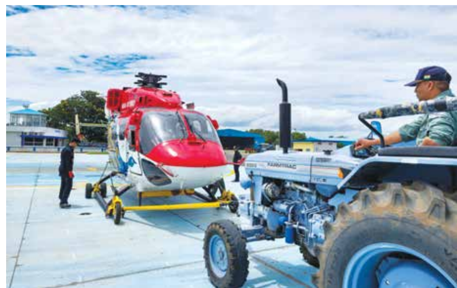
The Sarang team of Indian Air Force on their way to the first edition of the Egypt International Airshow

(The writer is a Chartered Accountant and Investment Consultant. Views personal)