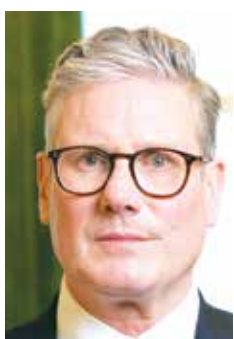
Keir Starmer, Prime Minister, Britain

"British Asians are a driving force behind much of the social, cultural and economic innovation we see in Britain today. You represent so many of the values that help our communities thrive."