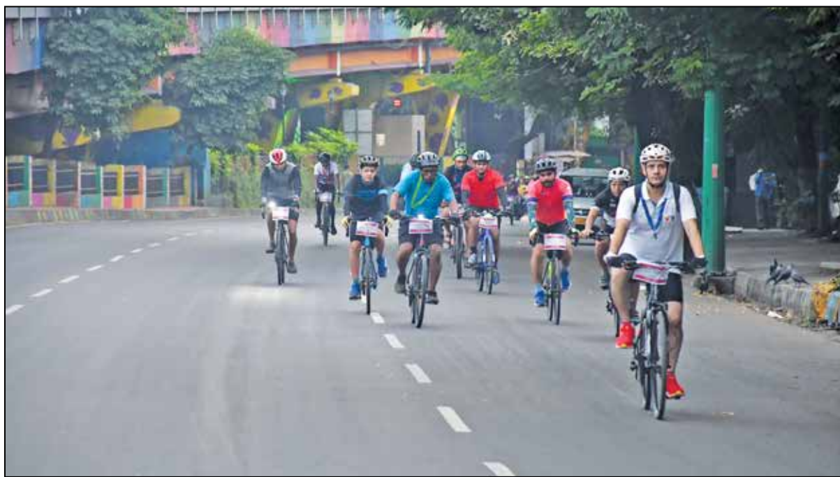
The first ride of Ghodbunder Riders Masters was launched in Thane on Sunday.