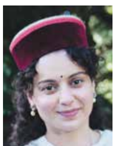
Kangana Ranaut, MP, BJP

"If we give disaster funds, it should go to the CM Relief Fund but everyone knows that it goes to the Sonia relief fund. Acts of the son of a king are known to everyone and people are tired of potholes on roads."