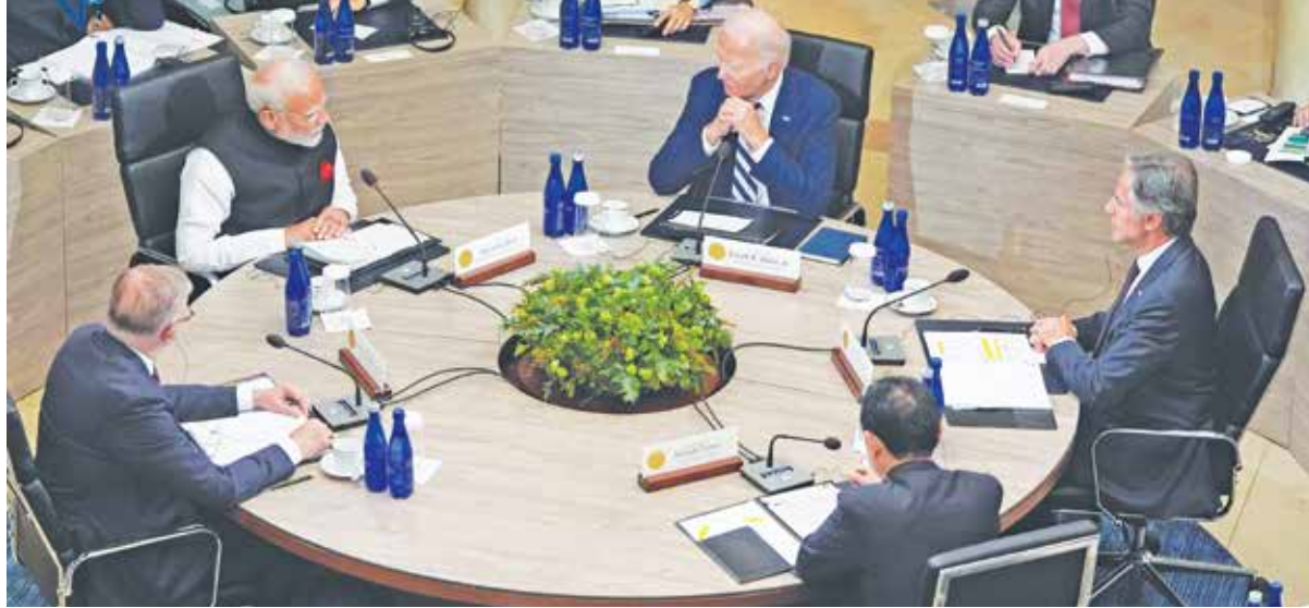
President Joe Biden greets from left, Australia's Prime Minister Anthony Albanese, India's Prime Minister Narendra Modi, Biden, and Japan's Prime Minister Fumio Kishida, at the Quad leaders summit.

The three leaders met at the sidelines of the Quad Leaders' Summit, hosted by US President Joe Biden. Modi and Albanese reaffirmed their commitment to "further deepen" bilateral ties, with the Indian leader saying that he "cherishes the time-tested friendship" with Australia. This was a farewell summit for the Japanese PM as he nears the end of his term in office on October 1. This was Biden's farewell summit as his term as the US President will end on January 20, 2025.