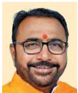
Prataprao Jadhav, Union Minister of State for Ayush

"I am a farmer. We haven't paid bills for the last three generations. My grandfather's (water) pumps are still there. Neither my grandfather and my father, nor I paid the farm electricity bills."