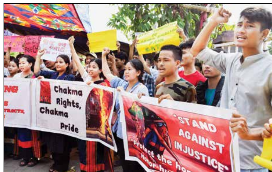
Members of Guwahati Chakma Students' Union and All Assam Chakma Society takes part in a protest over the violence against Hindus in Bangladesh, in Guwahati on Sunday.

Chiranjeevi is one of the top stars of the South cinema, having worked in over 150 feature films in Telugu as well as Hindi, Tamil and Kannada.