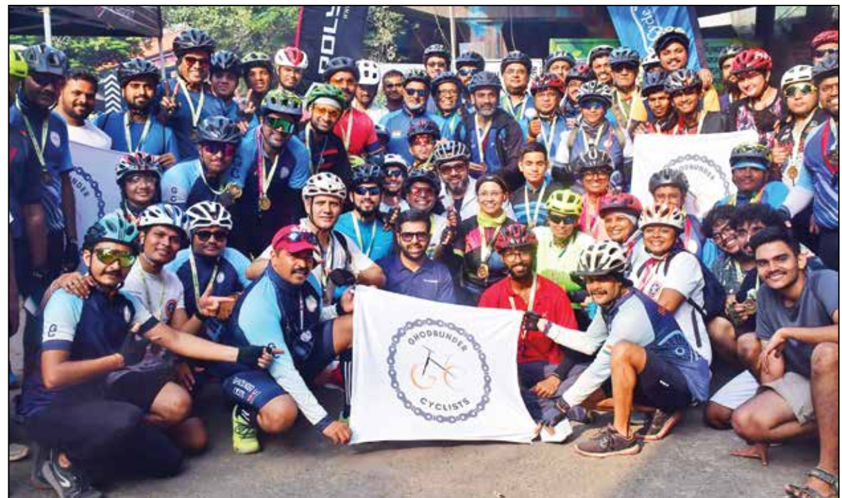
Members of Ghodbunder Riders Masters at GMR Cycle Ride in Thane on Sunday.

"It was emotional, I wanted to score each and every match which didn't happen but wanted to do well in Tests, which is where I belong the most. Being on the field gives me pleasure more than anything else." Playing in the manner that defines his batting, Pant struck a fluent 109 off 128 balls, lacing his innings with 13 fours and four sixes. The keeper-batter added 167 runs for the fourth wicket with Gill (119 off 176 balls) and helped lift India from 67/3 to 287/4 declared in their second essay.