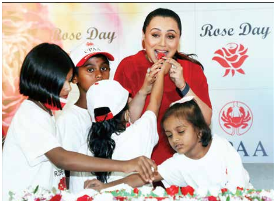
Bollywood actor Rani Mukerji with cancer-affected children during an event on the eve of World Rose Day, also known as the Day for the Welfare of Cancer Patients in Mumbai.

The High Court has a sanctioned strength of 94 judges, while the current strength being 66 sitting judges, the release said.