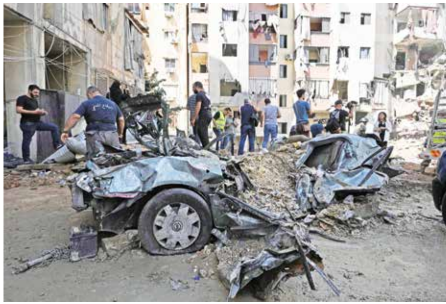
Emergency workers clear the rubble at the site of Friday's Israeli strike in Beirut's southern suburb on Sunday.

Neither side is believed to be seeking a war. But in recent weeks, Israel has shifted its focus from Gaza to Lebanon, and vowed to bring back calm to the border so that its citizens can return to their homes. Hezbollah has said that it would only halt its attacks if there is a cease-fire in Gaza, which appears increasingly elusive as long-running talks led by the United States, Egypt and Qatar have repeatedly bogged down.