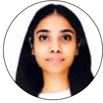
By Esha Lohia

As the world marked World Rhino Day on Sunday, the 2024 State of the Rhino Report offers a sobering assessment of the conservation efforts and challenges facing these species. Currently, less than 28,000 rhinos remained worldwide across all five species. According to the 2024 State of the Rhino report by the International Rhino Foundation, every rhino species faces distinct conservation challenges due to environmental, socioeconomic, and political factors in their respective regions from Africa to Asia.