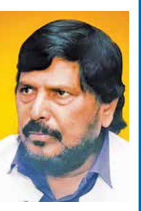
Ramdas Athawale, Union MoS for Social Justice

"The RPI-A has made a list of 18 probable seats, which it will be sharing with the Mahayuti partners in a few days. We expect to get at least 10 to 12 seats in the seat-sharing pact."