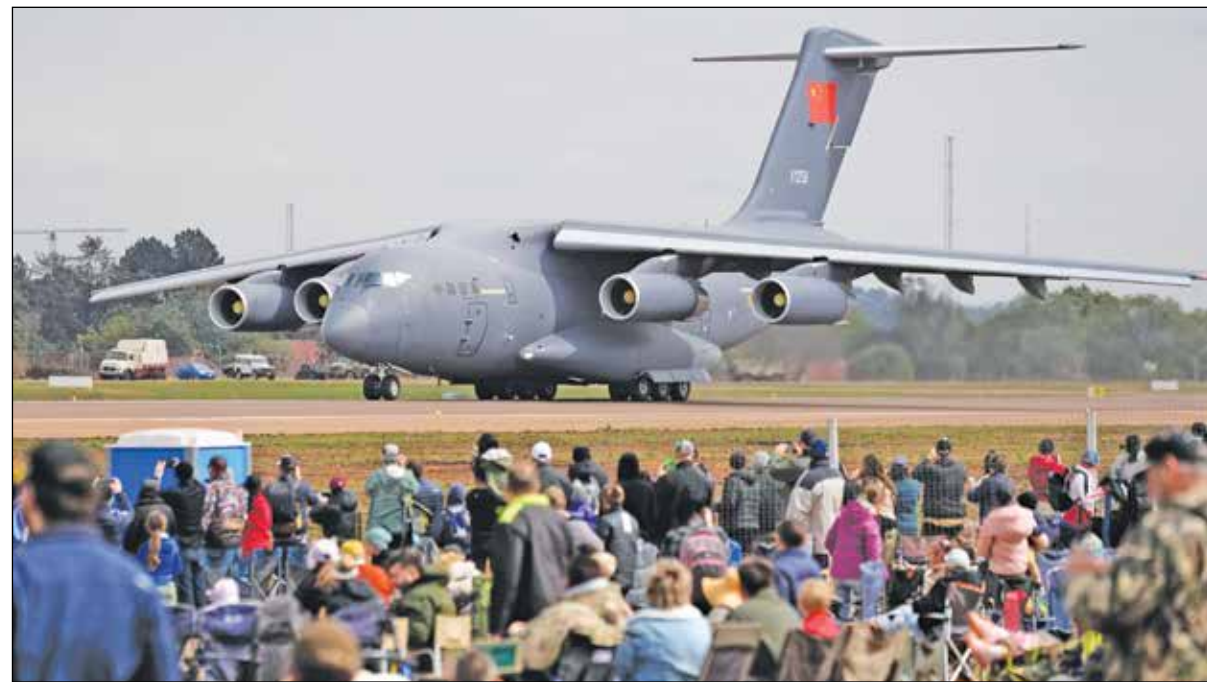
China's Y-20 transport aircraft is seen at the 2024 Africa Aerospace and Defence Exhibition (AAD) at Waterkloof Air Force Base in Pretoria, South Africa on Sunday.

"The iron ore mining in Goa has just begun and/or looking forward to resume its operations after a long gap of 6 years. The mining companies are required to pay a substantial amount in the form of auction premium for winning the bid."