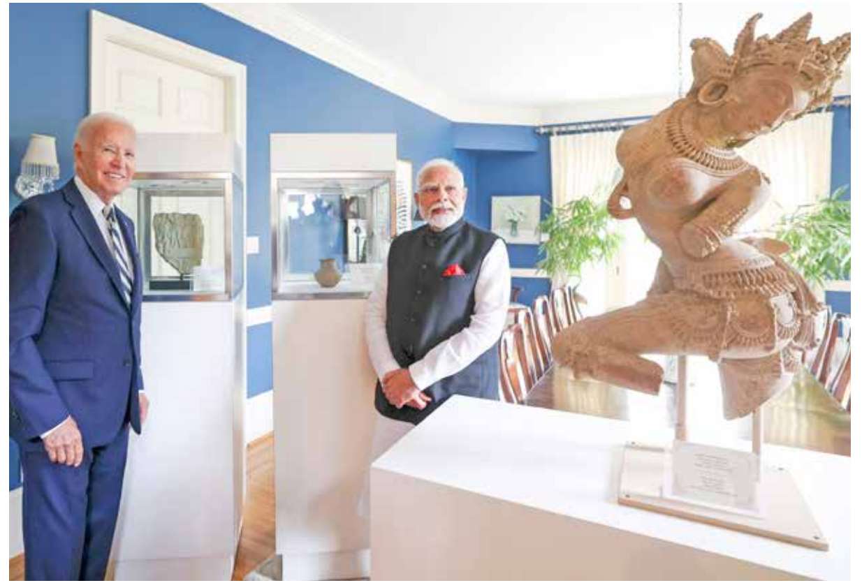
Prime Minister Narendra Modi with US President Joe Biden at a meeting in Delaware, US. The US side has facilitated return of 297 stolen or trafficked antiquities.