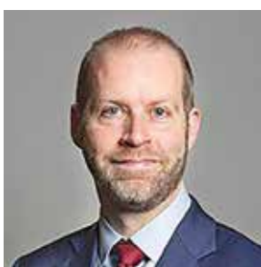
Jonathan Reynolds, Secretary, Business and Trade, UK

"We know that a cleaner, greener future for UK steelmaking is vital to the industry's long-term economic stability. The road ahead is not without its challenges, but our steel strategy will set forth a positive vision for the future of the industry, backed by our manifesto commitment to GBP 3 billion of government investment."