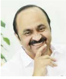
V.D. Satheesan, Leader of Opposition, Kerala

"Pinarayi Vijayan and the CPI(M)'s connection with the RSS is an open secret. It is the Congress that opposes the BJP and the RSS in the country. What kind of anti-fascist struggle is the Kerala CM talking about without the Congress? Vijayan's study class is not needed for the Congress to fight the Sangh Parivar."