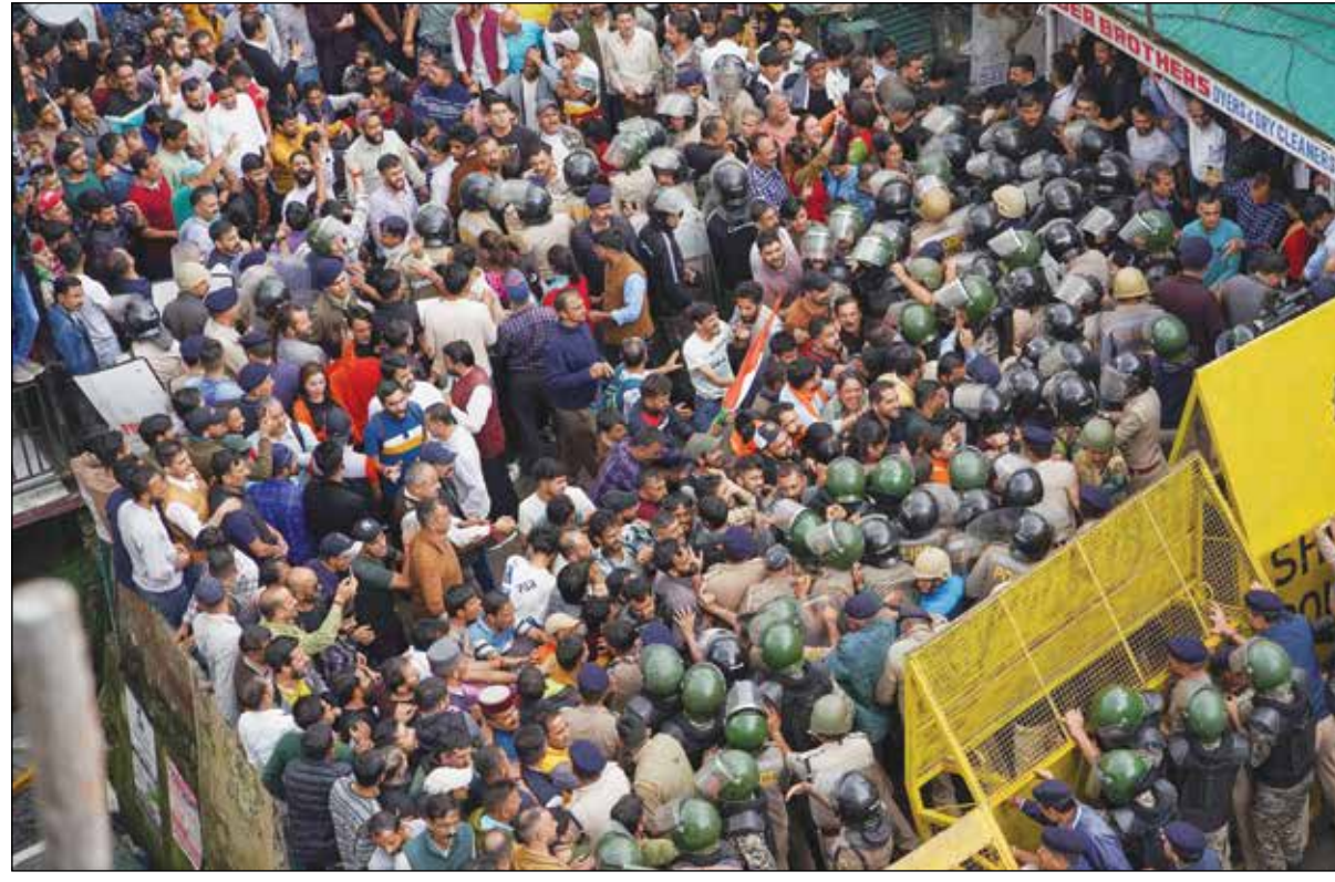
Protestors, who had gathered on the call of Hindu groups, clash with security personnel during a protest demanding the demolition of an illegal structure in a mosque at Sanjauli locality in Shimla on Wednesday.