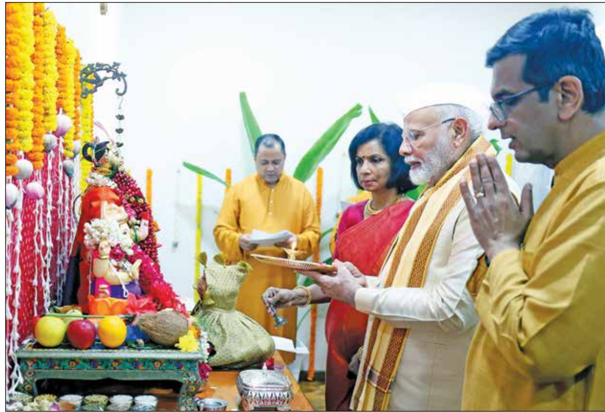
Prime Minister Narendra Modi attends 'Ganesh Poojan' at the residence of Chief Justice of India D.Y. Chandrachud in New Delhi on Wednesday.

es range anxiety of EV buyers by promoting in a big way the installation of electric vehicle public charging stations (EVPCS).