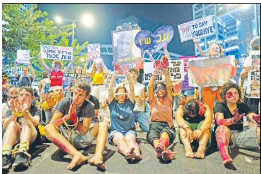
Blindfolded and bounded protesters take part in a protest against Israeli Prime Minister Benjamin Netanyahu's government and call for the release of hostages held in the Gaza Strip in Tel Aviv on Tuesday.

Afterward, Clinton said she was creeped out. But on Tuesday night, both candidates stayed behind their podiums as instructed and there were no explicit jabs regarding gender.