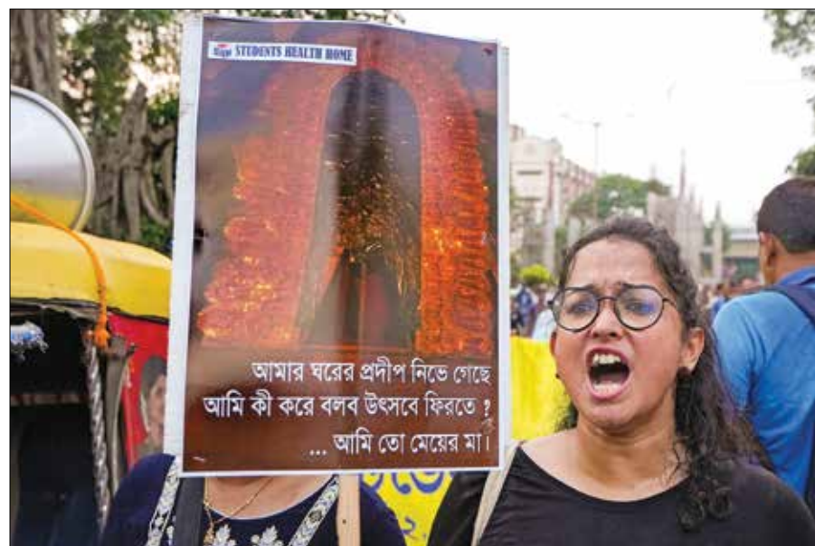
Doctors display placards during a protest dharna over the RG Kar Hospital rape and murder incident in Kolkata on Wednesday.

This led to a quick rebuttal from the medics, who dismissed the claims as baseless. The minister urged the doctors to rejoin work by respecting the Supreme Court's direction to them, but refrained from giving a direct reply on whether the state government would take any punitive action for violating the