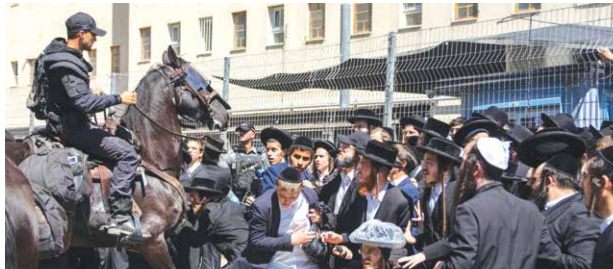
Israeli police officers scuffle with ultra-Orthodox Jewish men during a protest against a potential new draft law which could end their exemptions from military service in Jerusalem on Wednesday.

"We will not condone terrorism... We have been tough and we have been working together with India on many of these issues, against terrorism. But I don't think this one case should deter us from further collaboration and enhancing our bilateral cooperation," he said.