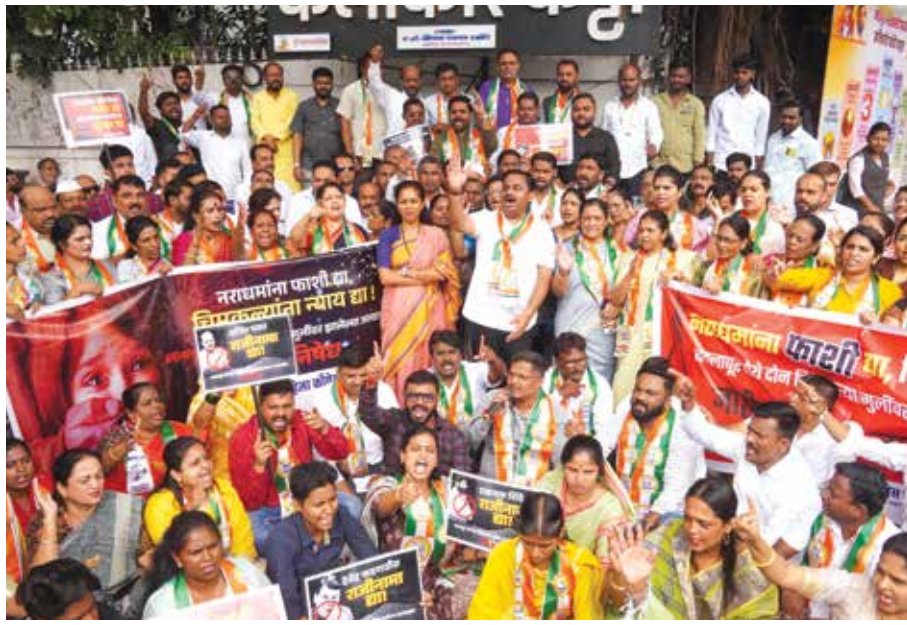
NCP (SP) leader Supriya Sule and others during a protest over the Badlapur sexual abuse case, in Pune on Wednesday.

State Congress President Nana Patole accused the government of doing politics over the incident. "The biggest state where crime against children takes place is Maharashtra. 21,000 such incidents have happened in the state and the government