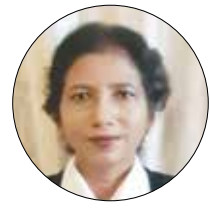
By Mangala Waghe

The protest in Badlapur on Tuesday, sparked by the sexual abuse of two minor girls, was not politically motivated but reflected the community's deep frustration and anger. It demonstrated how ordinary citizens act when law enforcement fails. Understanding the sequence of events is crucial before making assumptions about the protest's causes.