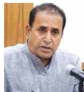
Anil Deshmukh, former Home Minister

"When I was the Home Minister, I had formed a 21-member committee of legislators from all parties to draft the Shakti Bill on the lines of an act in Andhra Pradesh. The bill was approved by the cabinet headed by Uddhav Thackeray and passed in the state legislature. It is pending before the Central government for approval."