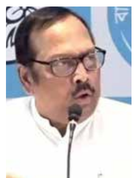
Sukhendu Sekhar Roy, MP, TMC

"In my entire 56 years of political life, I have never witnessed such a spontaneous upheaval of the common masses. They didn't bother for a political flag to unite and hit the streets in protest in the middle of the night with a common agenda: justice for the victim and punishment for the perpetrator."