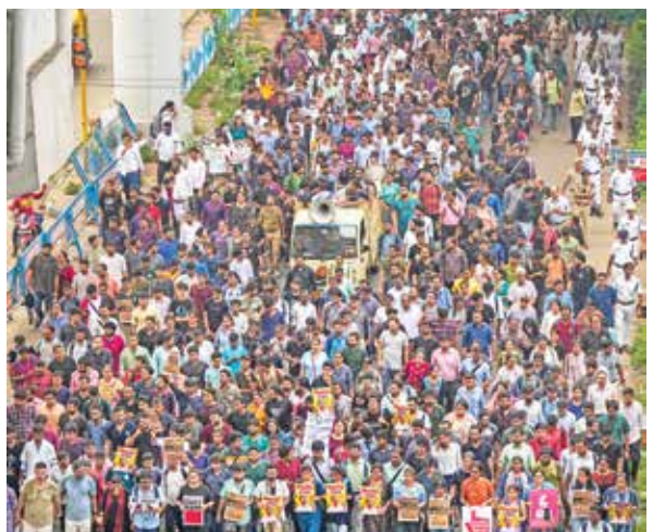
Doctors take part in a protest march from Central Government Offices (CGO) complex to Swasthya Bhawan in Kolkata on Wednesday