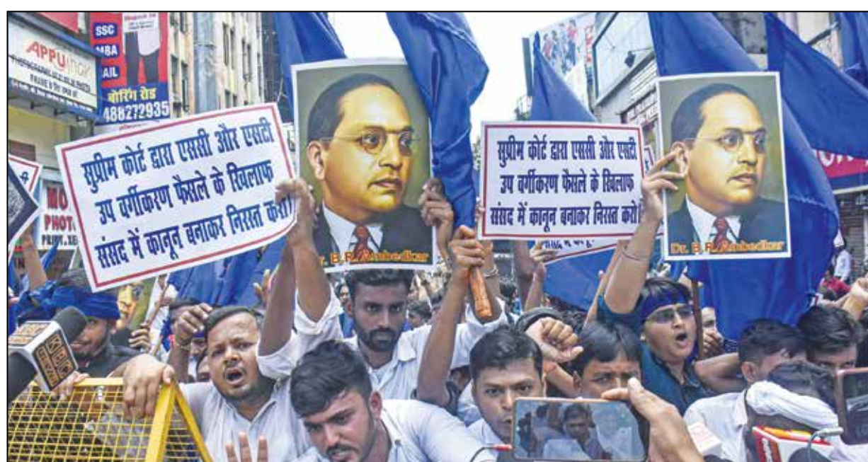
Bahujan Samaj Party (BSP) supporters and others protest against the Supreme Court's August 1 decision on the issue of SC-ST reservation during 'Bharat Bandh', in Patna on Wednesday.