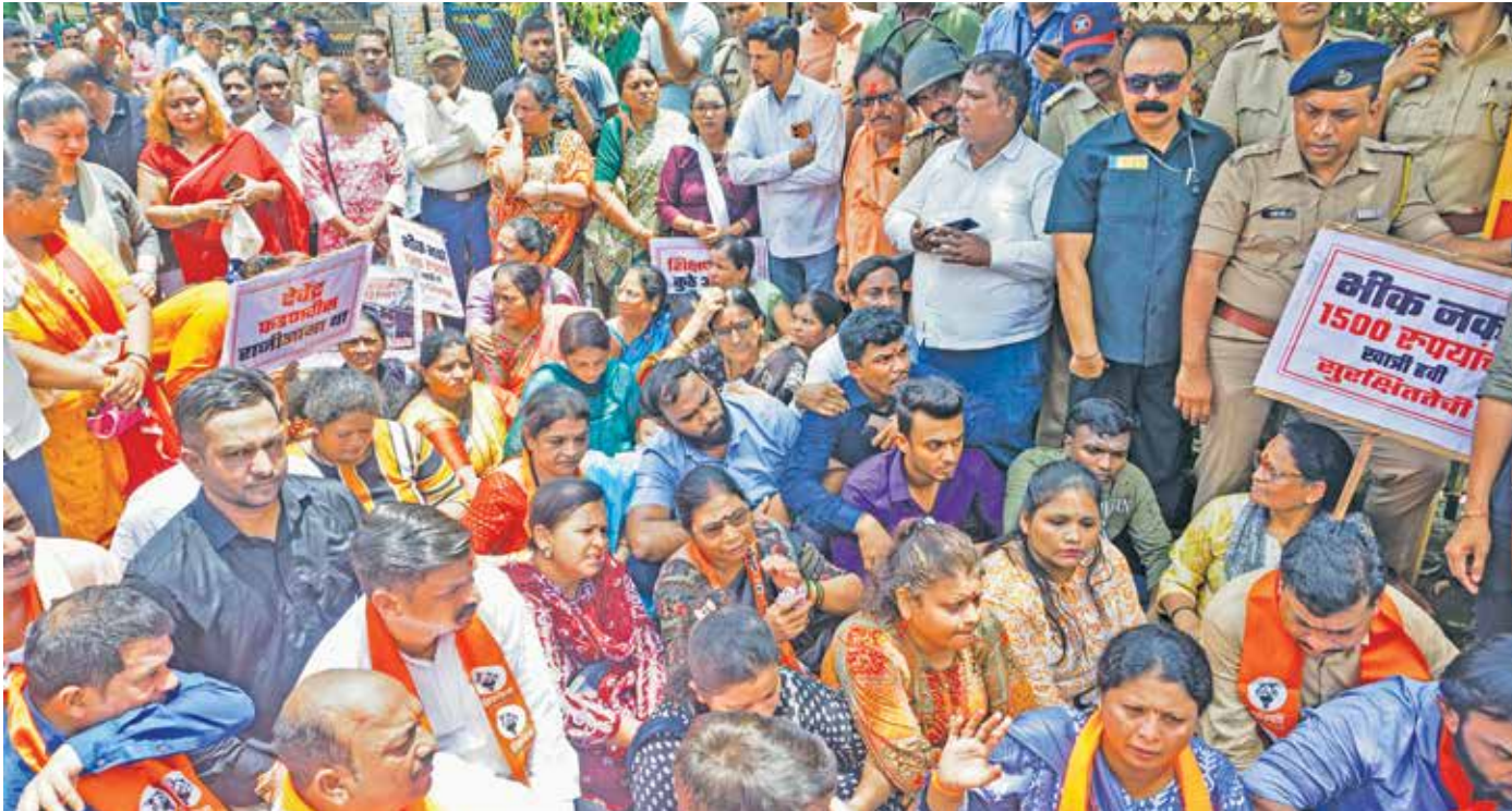
Shiv Sena (UBT) workers protest against the state government in Mumbai on Tuesday.