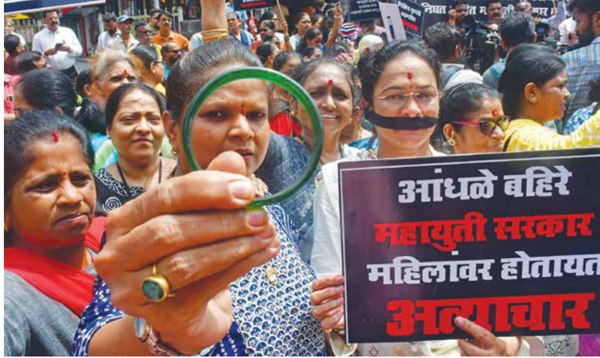
Shiv Sena (UBT) workers protest against the state government in Mumbai on Tuesday.

All eyes on Jay Shah, nomination ends on Tuesday ... pg 10