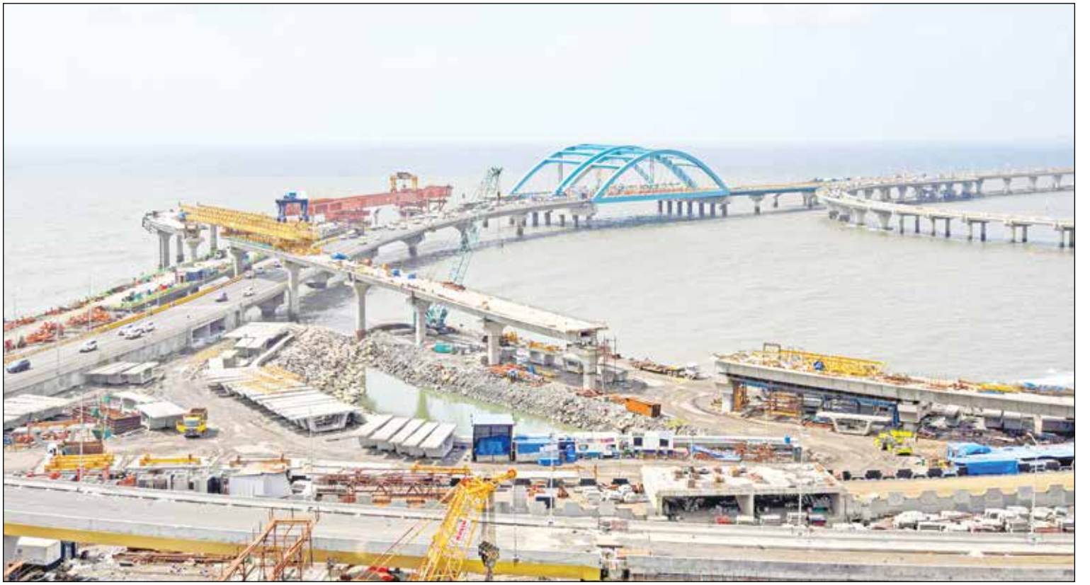
The girders bridge connecting Mumbai Coastal Road Project with Bandra-Worli Sea Link, in Mumbai on Thursday. The bridge is set to open for public use from Friday.