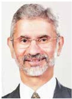
- S. Jaishankar, Minister, External Affairs

"What happened in 2020 (in Galwan) was in violation of multiple agreements for some reasons which are still entirely not clear to us; we can speculate on it."