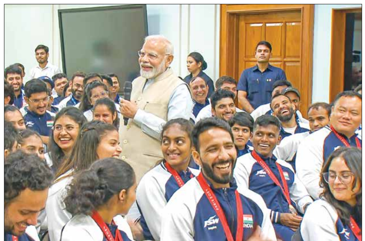
Prime Minister Narendra Modi during an interaction with India's Paris Paralympics contingent in New Delhi on Thursday.