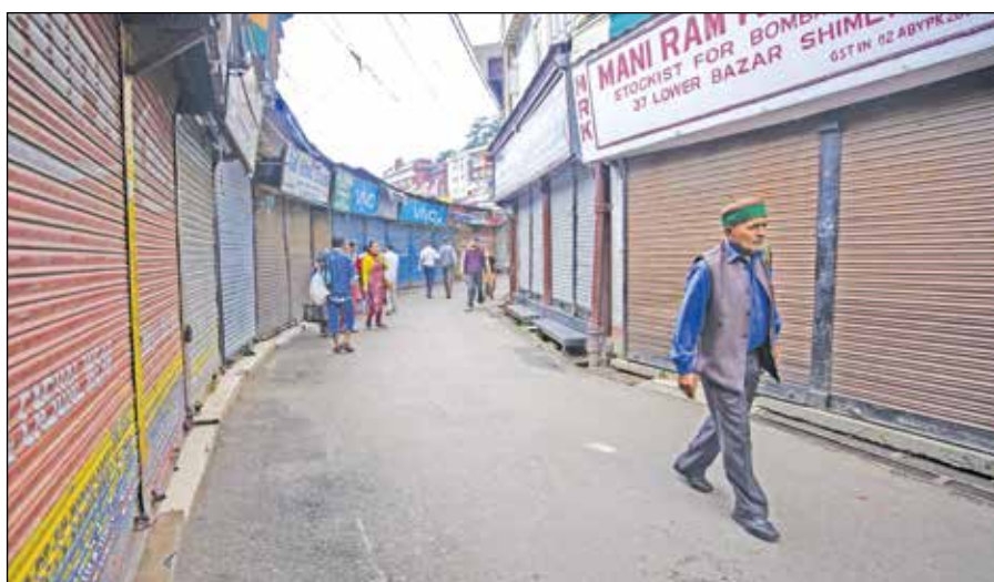
Shops closed in a market area in view of the 'bandh' called by traders to protest the police action during an agitation demanding the demolition of an illegal structure in a mosque on Wednesday at Sanjauli locality in Shimla