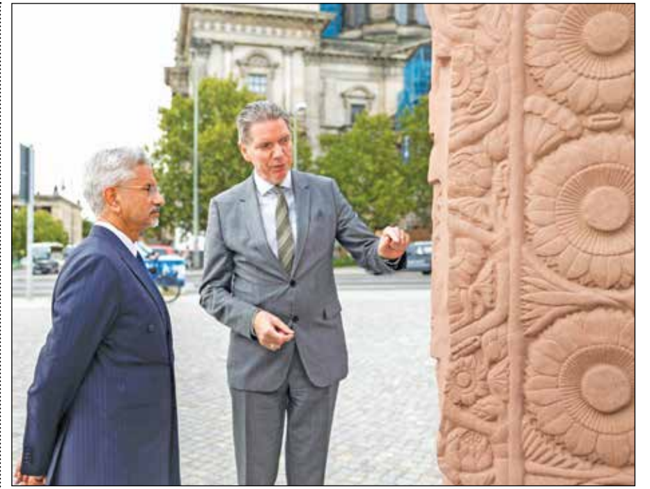
External Affairs Minister S. Jaishankar visits the replica of the East Gate of the Sanchi Stupa outside the Humboldt Forum in Berlin on Wednesday.

Campbell and Sannino reiterated deep and increasing concern about China's exports of significant amounts of dual-use goods and items used by Russia on the battlefield against Ukraine and China-based companies' continued involvement in sanctions evasion and circumvention. -PTI