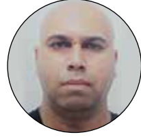
By Shoumojit Banerjee

This incident exemplifies a disturbing double standard in Maharashtra's justice system. The powerful seem to operate in a separate reality, shielded by their connections and status. When public figures or their relatives find themselves in legal trouble, the response from authorities often appears muted. Such incidents erode public trust in law enforcement and judiciary systems, breeding cynicism and a sense of injustice among the populace. For Maharashtra, this is not just a matter of optics; it is a critical test of its democratic and judicial integrity. As long as the children of the elite can sidestep accountability with ease, the rule of law remains an abstract ideal. The stakes are high. If the state's leaders fail to act decisively and impartially, they risk deepening the public's disillusionment with political and judicial systems. Maharashtra's leaders must rise to this challenge, ensuring that justice is not a privilege reserved for the powerful but a right accessible to all. Only then can the brakes be applied to the runaway vehicle of preferential treatment that has long plagued the state, steering it back onto the path of fairness and accountability.