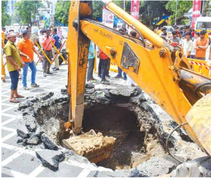
Repair work being carried out by Brihanmumbai Municipal Corporation (BMC) after a road caved in at Prabhadevi in Mumbai on Thursday.

The juveniles were later handed over to their parents, the police added.