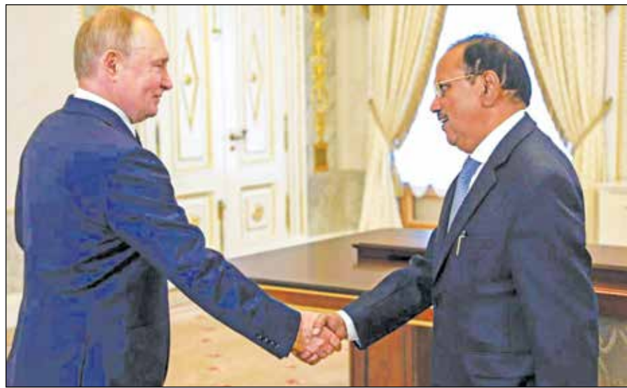
NSA Ajit Doval with Secretary of Security Council of the Russian Federation Sergei Shoigu during a bilateral meeting, on the sidelines of the BRICS NSAs meeting in Saint Petersburg, Russia.

Last week, North Korea also resumed launches of trash-carrying balloons toward South Korea. Since 2022, North Korea has significantly accelerated its weapons testing activities in a bid to perfect its capabilities to launch strikes on the U.S. and South Korea. The U.S. and South Korea have responded by expanding military drills that North Korea calls invasion rehearsals. Last month, Kim had still held off from missile tests or other provocative military demonstrations as the United States and South Korea conducted large-scale summertime military exercises. North Korea issued statements berating the allies for raising tensions. -AP