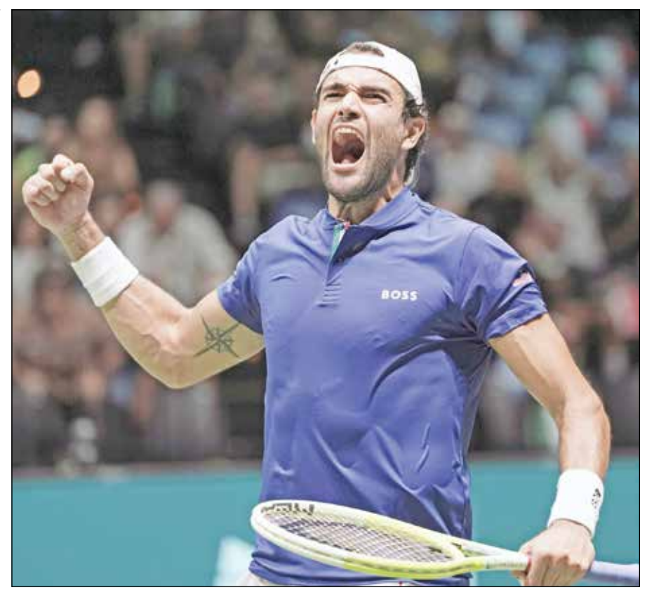
Matteo Berrettini, of Italy, celebrates defeating Joao Fonseca, of Brazil, in a Davis Cup tennis match at Unipol Arena in Casalecchio di Reno, near Bologna, Italy on Wednesday.