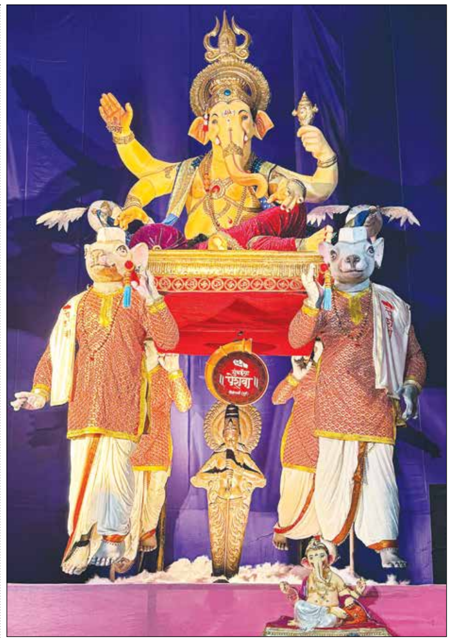
Idol of Lord Ganesha made with a mixture of used garland, flowers offered in temples and tissue papers at Vile Parle during Ganesh Utsav celebrations in Mumbai.

He urged the state governments to expedite the submission of detailed project reports for polluted stretches and ensure that the villages along the river achieve Open Defecation Free (ODF) Plus status.