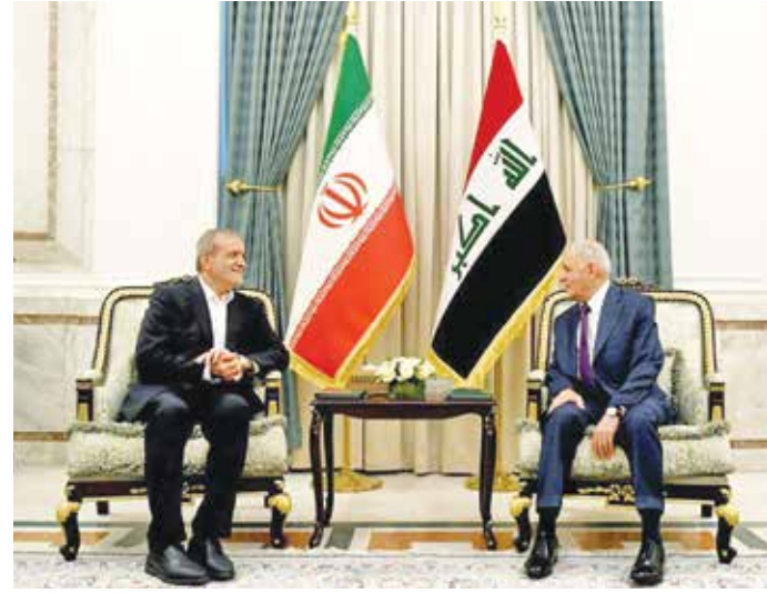
Iranian President Masoud Pezeshkian met with his Iraqi counterpart Abdul Latif Rashid in Baghdad on Wednesday.

State in 2014 galvanized a tacit military partnership, as Iranian-backed militias played a crucial role in the fight against the jihadists in Iraq.