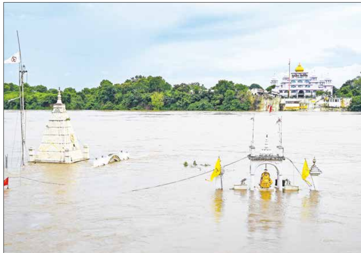
A temple submerged in the swollen Narmada river water after heavy rains in the region, at Gwarighat in Jabalpur on Wednesday.

Hearing a case which stemmed from concerns over the impact of overhead power lines from renewable energy projects on the Great Indian Bustard, the Supreme Court in April this year recognized the right against adverse effects of climate change as a distinct fundamental right.