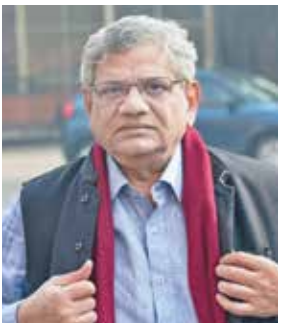
Opposition Rahul Gandhi.

He also played a significant role in the joint opposition's INDIA bloc. He was seen among the political mentors of Congress leader and Lok Sabha Leader of