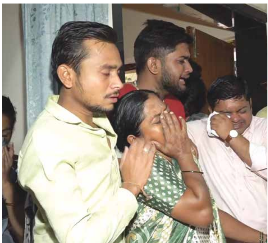
Family members of the victims of Nepal bus accident mourn at their residence, at Bhusawal in Jalgaon district on Sunday.

a silver statue. Villages that manage to keep TB at bay for three consecutive years will be honoured with a gold statue.