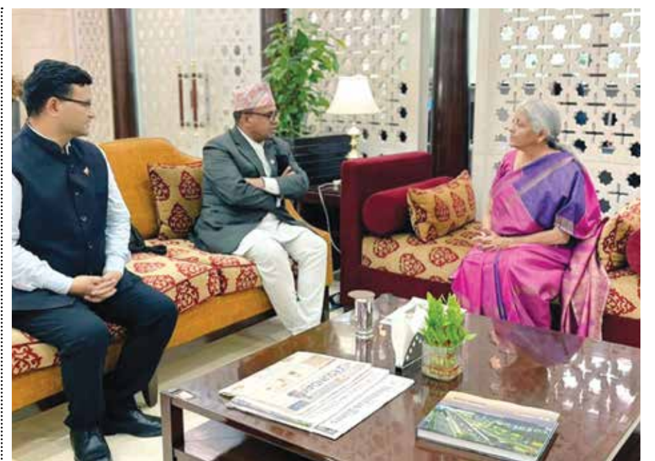
Union Finance Minister Nirmala Sitharaman with Minister for Culture, Tourism & Civil Aviation of Nepal Badri Pandey and Acting Ambassador of Nepal to India Surendra Thapa, in New Delhi

"I want to assure our Jewish fellow citizens of my full support," Darmanin posted on X.