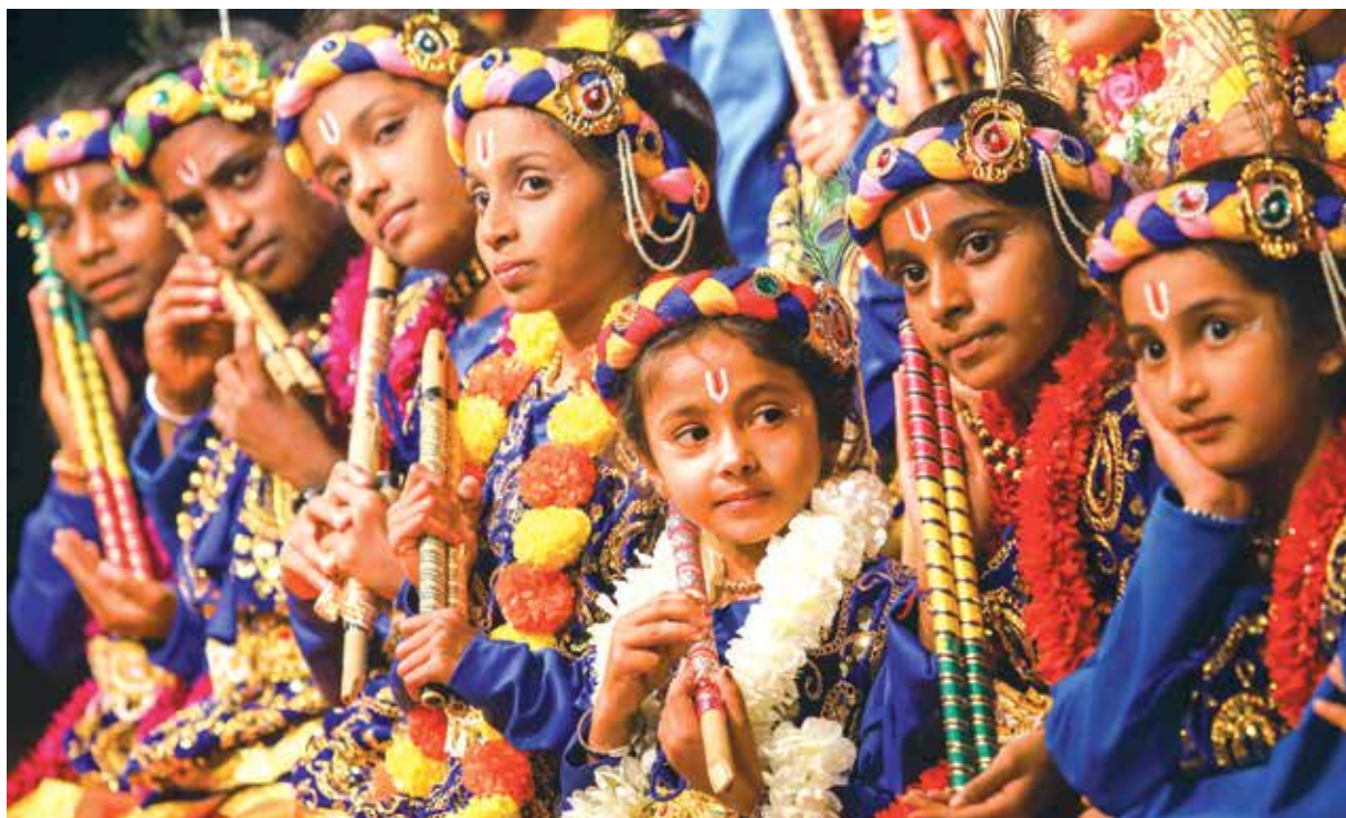
Children dressed as Lord Krishna take part in Janmashtami festival celebrations, in Bengaluru on Sunday.