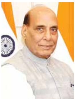
Rajnath Singh, Defence Minister

"We share a vision of a free and open Indo-Pacific, and our defence cooperation continues to grow stronger and stronger. We are expanding our defence industrial ties and working to co-produce more capabilities and strengthen supply chain resilience."