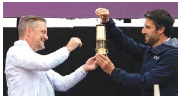
IPC President Andrew Parsons, left, and Paris 2024 President Tony Estanguet during the Paralympic Flame lighting ceremony in Stoke Mandeville.

"Considering the special needs of some para-ath-