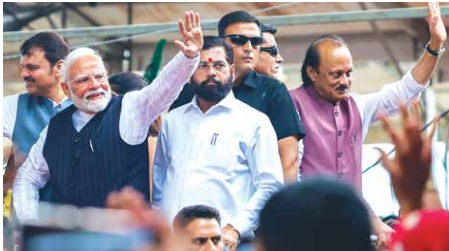
Prime Minister Narendra Modi, Maharashtra Chief Minister Eknath Shinde and Deputy Chief Ministers Ajit Pawar and Devendra Fadnis during 'Lakhpati Didi Sammelan', in Jalgaon on Sunday.

"The Mudra scheme offered loans to people without any guarantee, and 70 per cent of the beneficiaries of this scheme turned out to