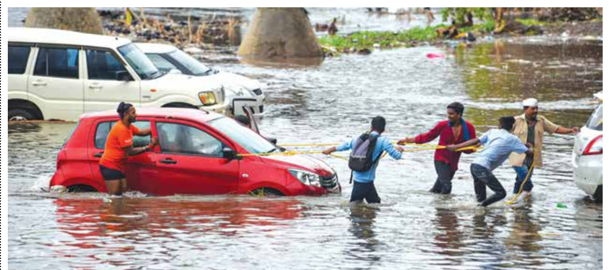
People try pulling out a car stuck in a waterlogged area after water released from the Khadakwasla Dam caused flood concerns following heavy rainfall, in Pune on Saturday.