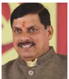
Mohan Yadav, Chief Minister, Madhya Pradesh

"Indore's Geeta Bhawan is a big centre for dialogue on various aspects of Lord Krishna. I am announcing today that our government will open centres on the lines of Geeta Bhawan in urban areas of the state which will give us an opportunity to discuss and debate various aspects of Lord Krishna."