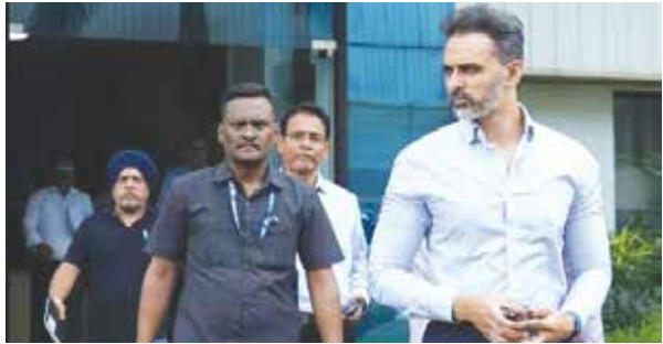
MPCB official conducted a surprise inspection at the Mercedes-Benz assembly plant at Chakan on Friday.

"During a routine inspection conducted on August 23, 2024, it was discovered that the Mercedes Benz assembly plant in Chakan, Pune, is not adhering to the pollution control guidelines set by the