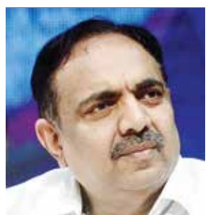
Jayant Patil, State President, NCP (SP)

"There are 288 seats in the Assembly. It is expected that there might be several changes in the seats allocation. It is unlikely that there will be any dispute over it. After all, we have to stay together. We will find a way after due deliberations."