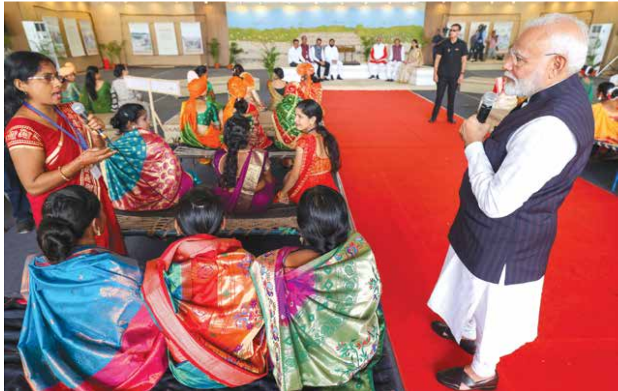
Prime Minister Narendra Modi during an interaction with 'Lakhpati Didis', in Jalgaon on Sunday.