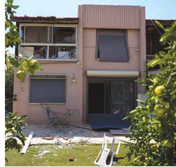
A damaged house is seen following an attack from Lebanon, in Acre, north Israel on Sunday.

Israel Prime Minister Benjamin Netanyahu said the military has been instructed to proactively remove the threat of Hezbollah in order to ensure the protection of Israel. He said the story is not yet over.