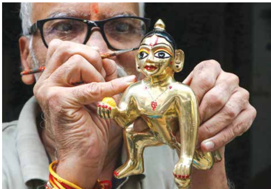
An artisan gives final touches to a brass idol of Lord Krishna ahead of 'Janmashtami' festival, in Nagpur on Saturday