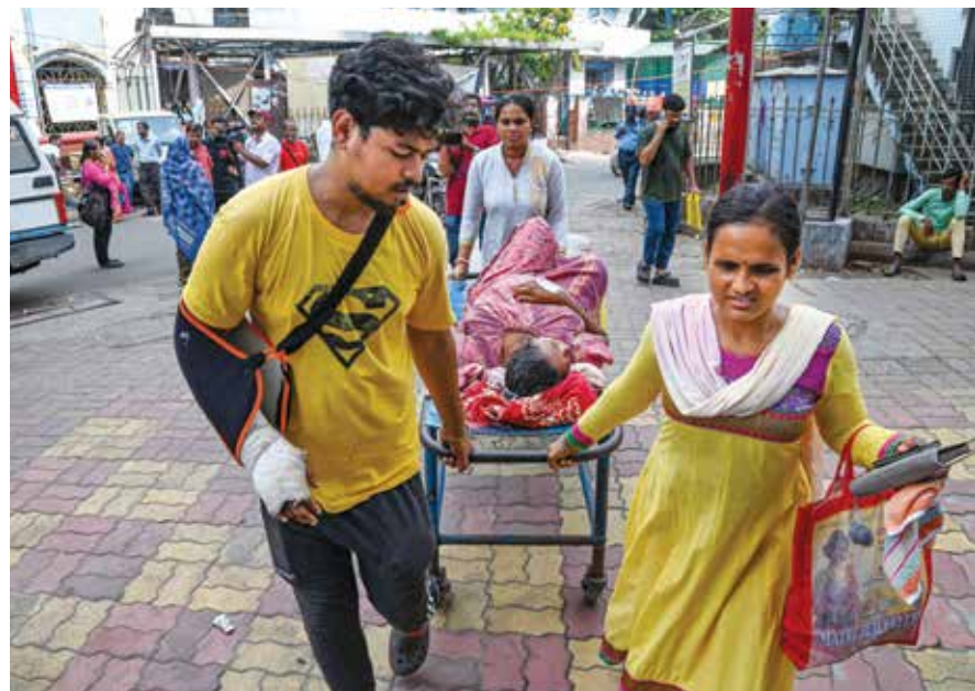
Family members shift a patient from R.G. Kar Medical College and Hospital as agitating junior doctors in West Bengal resumed 'total cease work' in Kolkata on Tuesday.