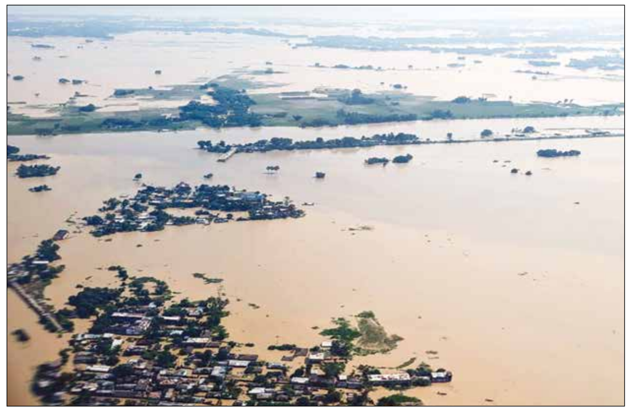
A flood-affected area of Bihar on Tuesday.