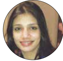
By Aditi Pai

"Don't talk to strangers; don't play in unknown places; don't unnecessarily befriend boys; be home before nightfall"—these were the instructions that most girls growing up in the late eighties in Mumbai heard. Including me. While being a word of caution, it also, at some level, instilled a fear of the unknown, of secluded places and strange people. It wasn't the best way to face the world. The late nineties and early 2000s were more relaxed and open. Younger cousins had more freedom to stay out till late, hemlines weren't scrutinised and hanging out with friends of the opposite gender—and their friends—was normal. Cities like Mumbai and Pune were hailed as safe. As journalists, we worked late nights, sometimes to hail a taxi at 3 AM. We looked over our shoulder but didn't fear. Yes, parents stayed up till the daughters got home but paranoia was low.