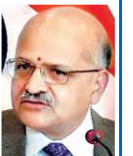
B.V.R. Subrahmanyam, CEO, NITI Aayog

"The industrial sector in India is growing fast, it is something people have been unnecessarily criticising. India can aim at 9 per cent plus growth. We have wiped out the effect of Covid."