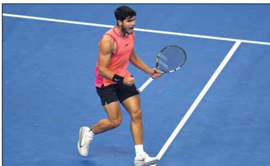
Carlos Alcaraz of Spain reacts after defeating Daniil Medvedev of Russia in a men's singles semi-final match for the China Open tennis tournament held in Beijing on Tuesday.

Currently, Shakib is facing a murder charge back home levelled against him during the civil unrest that led to former PM Sheikh Hasina's ouster. Shakib was a member of parliament from Hasina's party the Awami League.