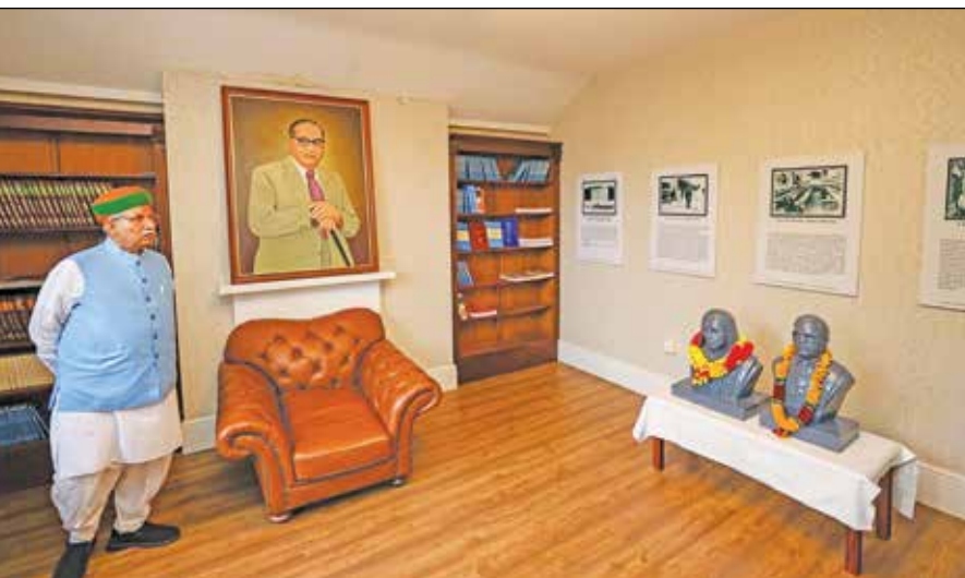
Union Minister of State Arjun Ram Meghwal pays homage to Dr. Babasaheb Ambedkar during a visit to London.

The age and other details about the students were not yet known. -AP