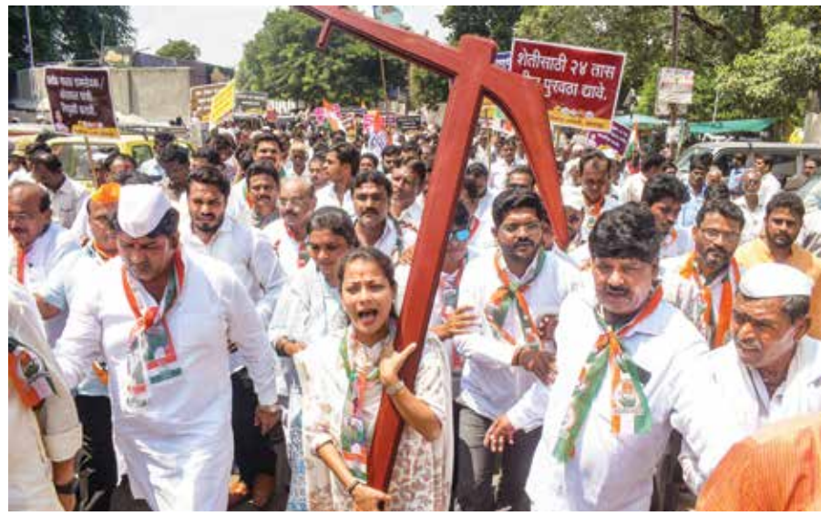
Members of Maharashtra Vikas Aghadi (MVA) with farmers during a protest rally led by Congress leader Praniti Shinde for various demands in Solapur on Tuesday.

Thane: A case has been registered against five persons for allegedly sexually harassing a 35-year-old woman at a restaurant and bar in Thane, police said on Tuesday. Police on Monday registered a case in connection with the incident that occurred at an establishment in the Majiwada area on September 21, an officer said. A group of persons were dancing when five men, one of them a doctor, touched the woman inappropriately, he said. No arrests have been made so far, the officer said.