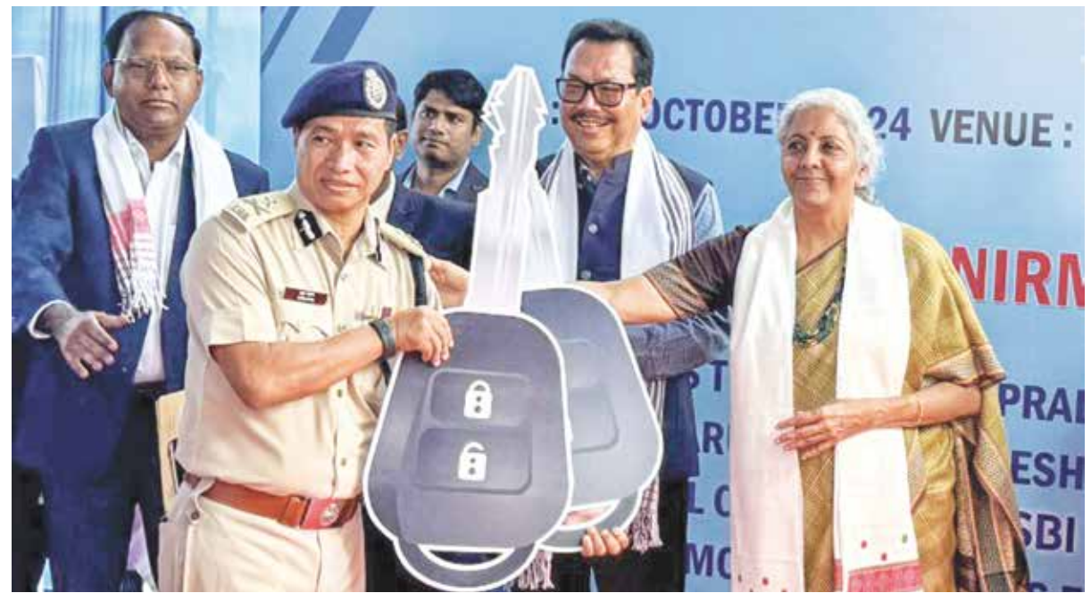
Union Finance Minister Nirmala Sitharaman during the handing over ceremony of an ambulance van and a hearse van to Office of the DGP, Itanagar under CSR activity of SBI.