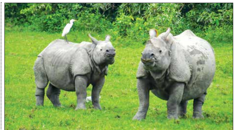
One-horned rhinoceros graze inside the Kaziranga National Park, in Nagaon district.

The matter has been posted on October 4 for further proceedings.