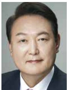
- Yoon Suk Yeol, President, South Korea

"If North Korea attempts to use nuclear weapons, it will face the resolute and overwhelming response of our military and the (South Korea)-US alliance. That day will be the end of the North Korean regime."