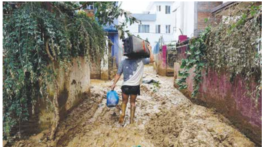
A man walks on a muddy alleyway carrying belongings salvaged from his house in Kathmandu, Nepal.