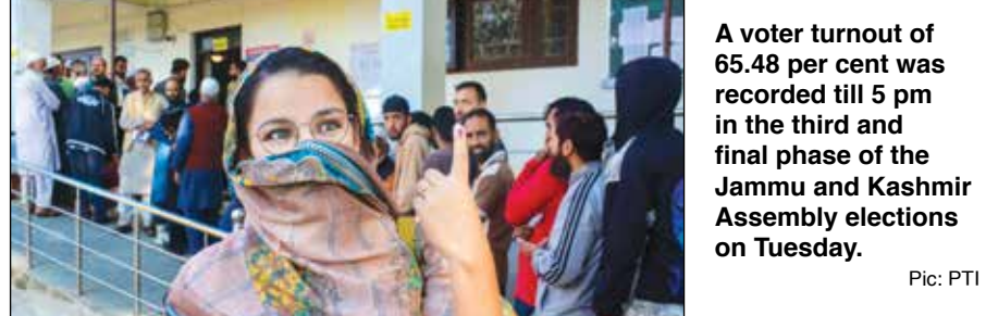
A voter turnout of 65.48 per cent was recorded till 5 pm in the third and final phase of the Jammu and Kashmir Assembly elections on Tuesday.