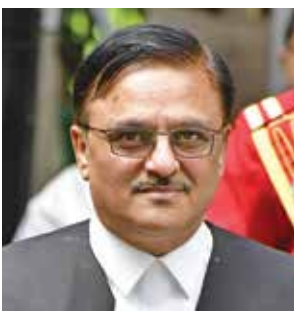
Abhay Oka, Justice, Supreme Court

"We have created a mob rule. When an incident happens, political people capitalise on it. Political leaders visit that particular place and assure people that the death penalty will be given to the accused, but the decision power rests with the judiciary."