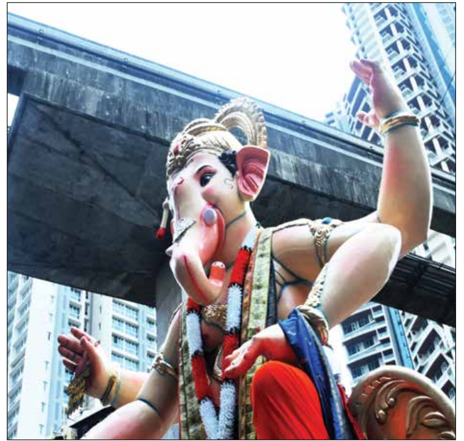
Devotees carry a Ganesh idol in Mumbai on Sunday.