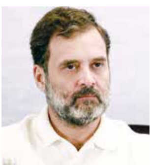
Rahul Gandhi, Leader of Opposition

"There is one crucial aspect I wish to highlight that will greatly aid the people of Wayanad - tourism. Once the rains cease, it is imperative that we make a concerted effort to revitalise tourism in the area and encourage people to visit."