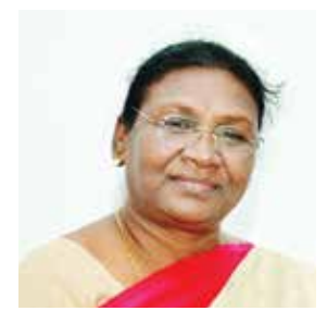
address the 21st convocation of Symbiosis International (Deemed University) at Pune, said the statement

On September 3, the President will grace and