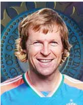
Jonty Rhodes, former cricketer

"My flying bad luck continues. Not only my Air India flight from Mumbai to Delhi over 1.5 hours delayed, but now I just signed a waiver as I board stating I accept my seat is broken. Why me? Not looking forward to the next 36 hours with a return to Mumbai from Delhi and straight onto to my return flight to Cape Town."