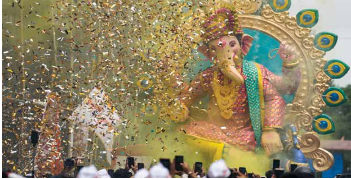
Devotees carry an idol of Lord Ganesh to the pandal from a workshop ahead of the Ganesh Chaturthi festival in Mumbai on Sunday.

Environmental Impact Plaster of Paris, a common material used for making Ganesh idols, is a harmful pollutant. When immersed