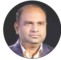
By Kiran D. Tare

The 2024 Lok Sabha elections delivered a jolt to Prime Minister Narendra Modi's otherwise unshakable political standing. For the first time since taking office in 2014, Modi and the Bharatiya Janata Party (BJP) were forced to reckon with a stark electoral setback, prompting speculation about whether the Prime Minister is genuinely altering his approach or merely navigating the necessities of coalition politics. As Modi grapples with a diminished majority, his recent actions suggest a blend of flexibility and pragmatism, leaving observers to wonder whether these are signs of a new modus operandi or tactical manoeuvres in response to political headwinds.