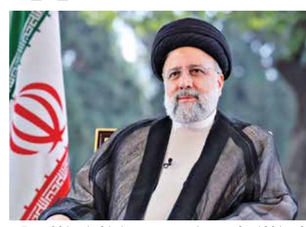
Pezeshkian in his interview complained about the

Hundreds of entities and people in Iran — from the central bank and government officials to drone producers and money exchangers — are already under international sanctions, many of them accused of materially supporting Iran's Revolutionary Guard and foreign militant groups such as Hamas, Hezbollah and the Houthis.