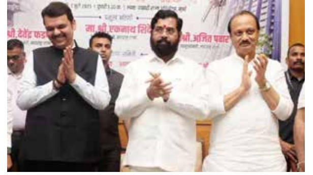
meetings," the sources said.

"Yesterday's meeting was in line with the previous two-three rounds of initial discussions that took place. The final seat sharing will be sealed after another two to three