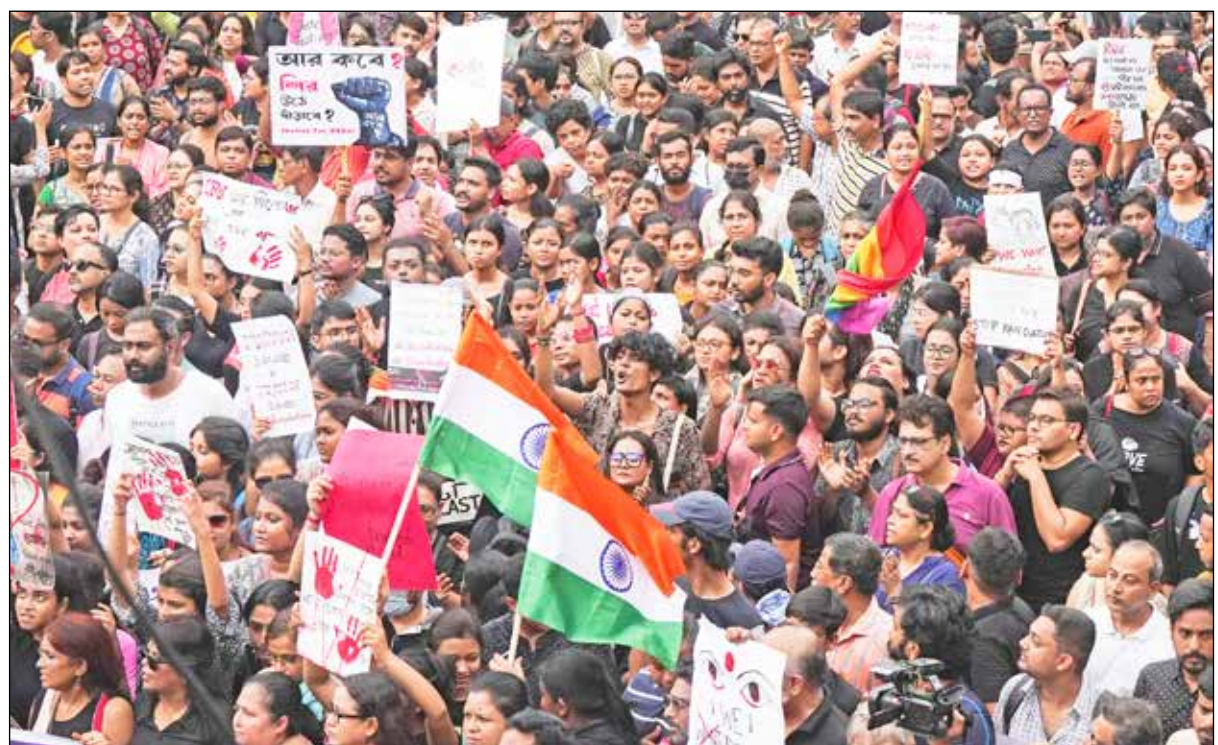
People take part in a protest march against the alleged sexual assault and murder of a trainee doctor, in Kolkata on Sunday.

The statue of the 17th century Maratha warrior king at Rajkot fort in Malvan tehsil, some 480 km from here, fell on August 26. It was unveiled by PM Modi on December 4, 2023, on the occasion of Navy Day. (Detailed report on page 3)