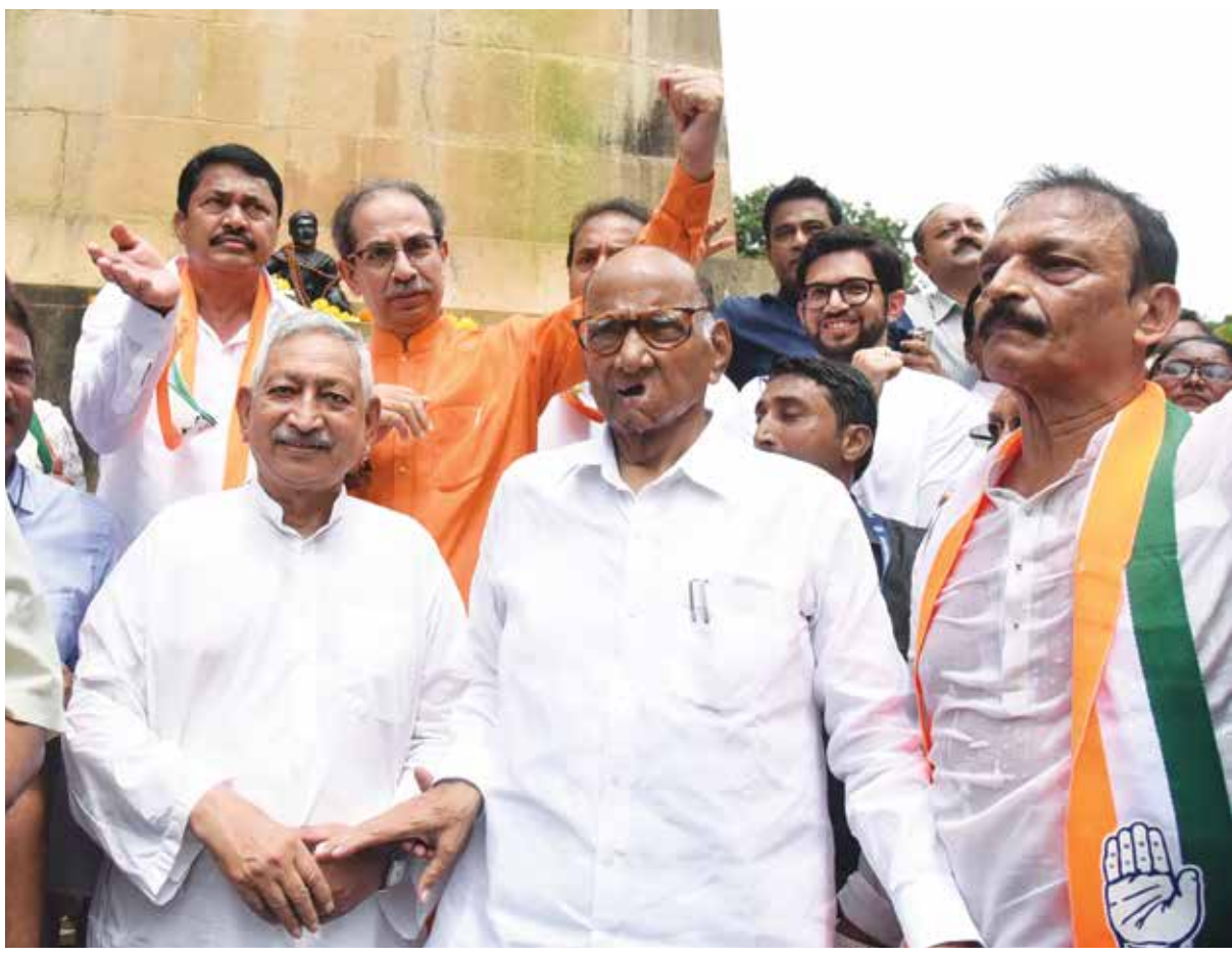
Maharashtra Vikas Aghadi protested against Mahayuti government for the second time in fortnight in Mumbai on Sunday.