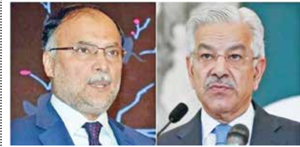
Planning Minister Ahsan Iqbal