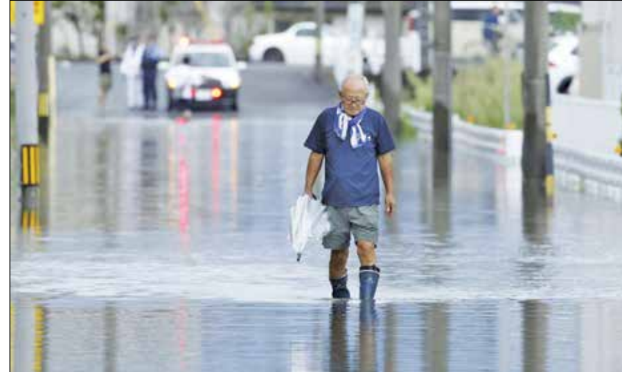
People makes his way through a flooded street as the city was hit by heavy rain in Ogaki, central Japan on Saturday following a tropical storm in the area.

Rai said he has requested a meeting with central agencies and IIT Kanpur experts to discuss the proposal for artificial rain. The BJP had on Saturday slammed the Delhi government, accusing it of indulging in "political gimmicks" and "letter game" with the Centre on the issue of air pollution, instead of taking concrete steps to tackle the health hazard. The ruling AAP had rejected the charge. -PTI