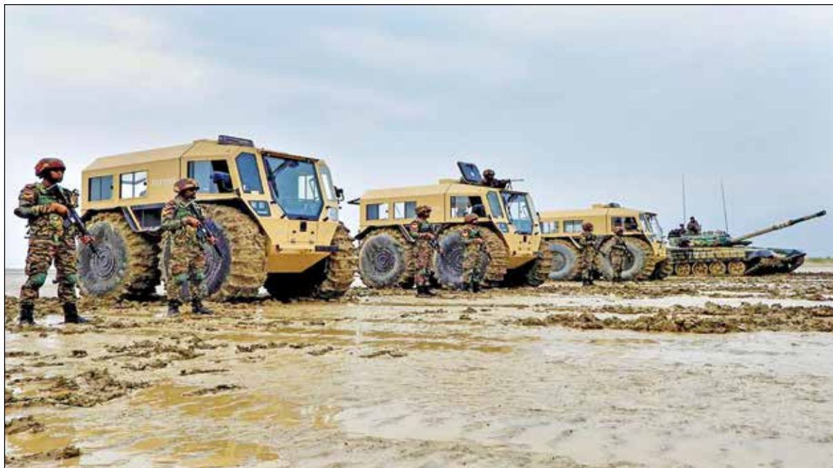
Warriors of Bald Eagle Brigade conduct Mission Oriented Training integrating mechanised forces & specialist mobility vehicles, in Rann of Kutch.

"They often work together on several projects back-to-back and naturally, everyone would try to align themselves with them to get opportunities. However, such alliances are based on commercial interests," he said.