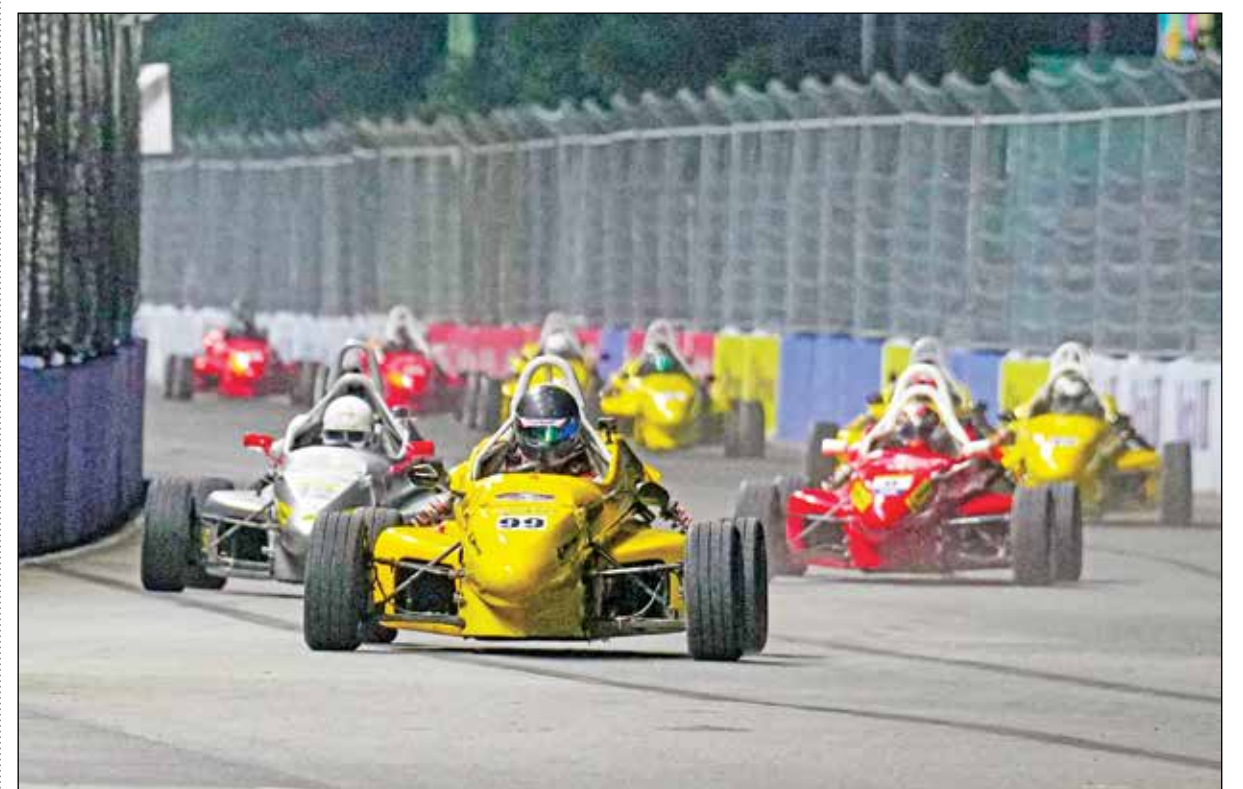
IRL-DRIVER A racers during practice at the Formula 4 night street car race, in Chennai on Saturday.