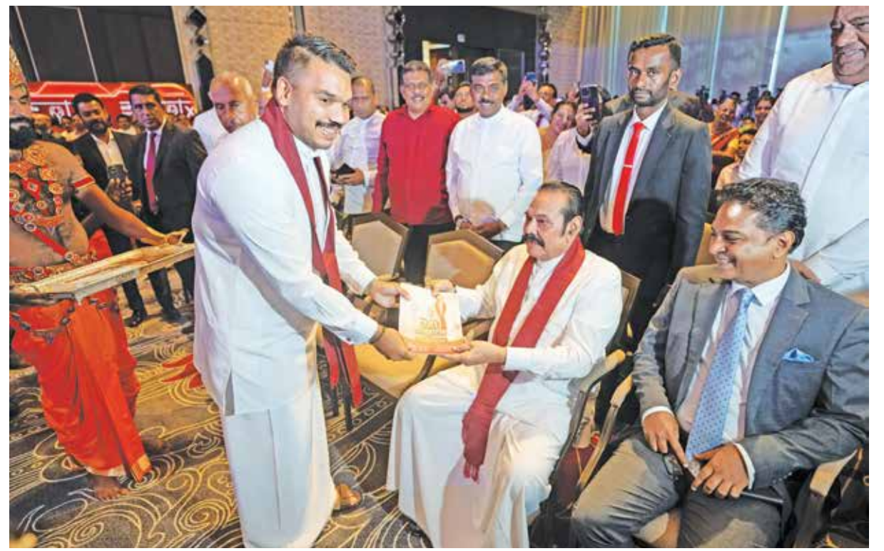
Presidential candidate Namal Rajapaksa, left, presents a copy of his election manifesto to his father and former president Mahinda Rajapaksa in Colombo, Sri Lanka on Monday.