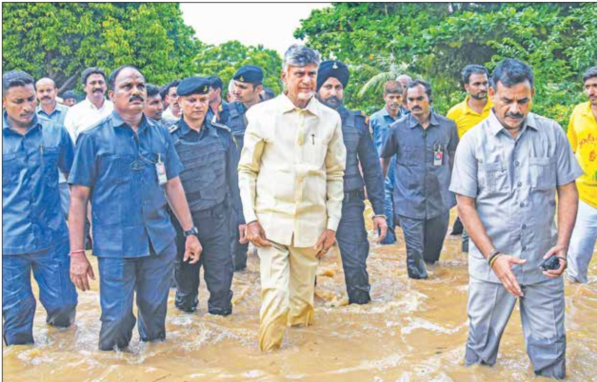
Andhra Pradesh Chief Minister Chandrababu Naidu during his visit to the flood affected areas. Naidu visited Krishna Lanka and Jakkampudi areas.