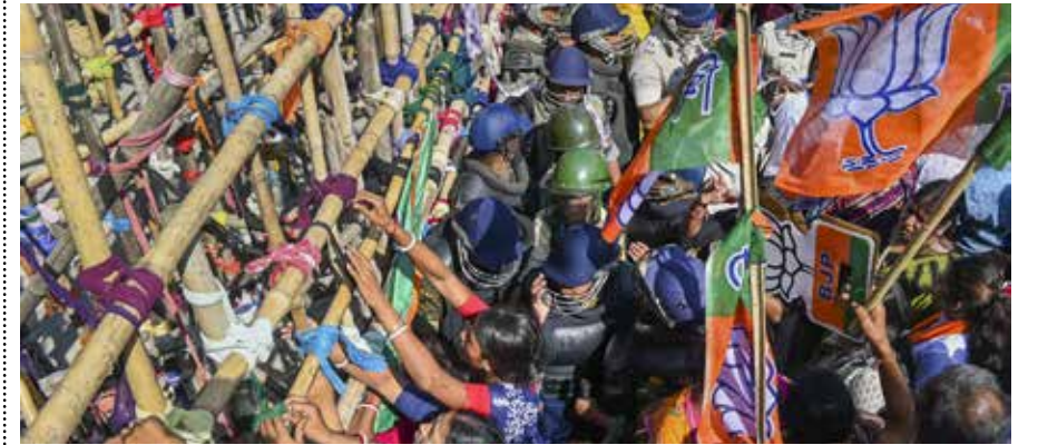
BJP workers during a protest march to the District Magistrate's office over the alleged sexual assault and murder of a Kolkata based trainee doctor, at Raiganj in Uttar Dinajpur district on Monday.

Kolkata: The draft of the anti-rape Bill, scheduled to be tabled by the Mamata Banerjee government in the West Bengal Assembly on Tuesday, proposes capital punishment for persons convicted of rape if their actions result in the victim's death or cause her to become vegetative.