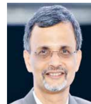
V. Anantha Nageswaran, Chief Economic Advisor

"Unprecedented levels of public and private sector debt, some visible to regulators and some not, economic growth dependent on continued increase in asset prices to offset the leverage that have built up and hence a massive surge in inequality. India must be wary of these outcomes and avoid this trap."