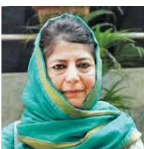
Mehbooba Mufti, Chief, People's Democratic Party

"Omar was a minister in a BJP government. They brought POTA here, banned shahtoosh (shawls). They were advocating for an attack on Pakistan. When we formed the government with BJP our government withdrew 12,000 FIRs, we brought a high-level delegation from Delhi to have a dialogue with the Hurriyat. We had a ceasefire."