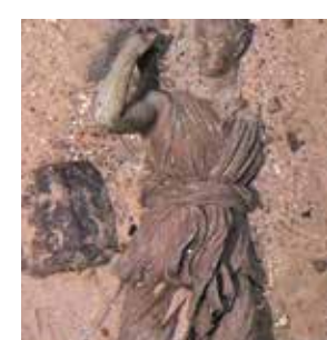
The findings from this summer's trip "showcase a bittersweet mix of preservation and loss," RMS Titanic said in a statement. A highlight was the rediscovery of the statue "Diana of Versailles," last seen in 1986, and the statue now has a clear and updated image, the company said.