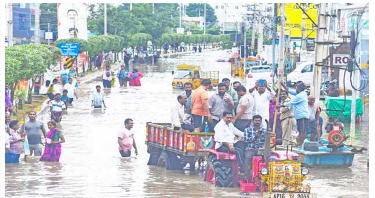
People cross a waterlogged street at the Bhavanipuram Sitara Center flood affected area, in Vijayawada on Monday. Pic-PTI

Besides rain-related deaths, three children drowned in Prakasam district's Markapuram division when they went swimming, the release said. -PTI