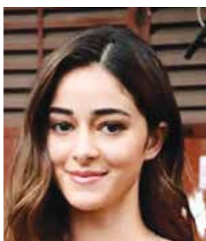
Ananya Panday, actor

"It's always been dark times for women. We are just speaking about it a lot more. There's one thing talking about it but the more important thing is doing something about it. More important step is actually laws changing, and government making actionable changes."