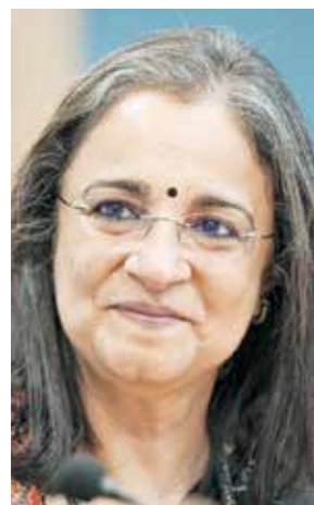
Mumbai: Capital markets regulator Sebi Chief Madhabi Puri Buch on Monday said a single disclosure by listed companies on

"The non-biological PM, who has been complicit in providing cover to the SEBI chairperson through his silence, must come clean" he said.