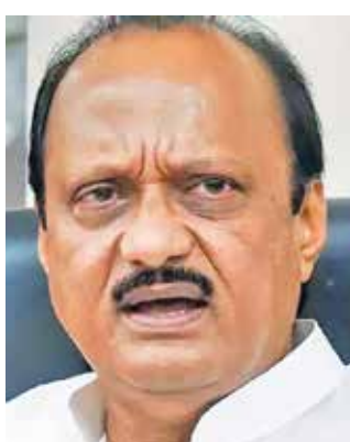
Ajit Pawar, Deputy Chief Minister

"Some people tell me they feel they are in a different Baramati. When I asked why so, they said Pawars never used to come to the doorstep in the last 25-30 years but now all Pawars are reaching out and have started enquiring about their wellbeing. I told them it is good that Pawars from this side and that side have started to reach out for votes."