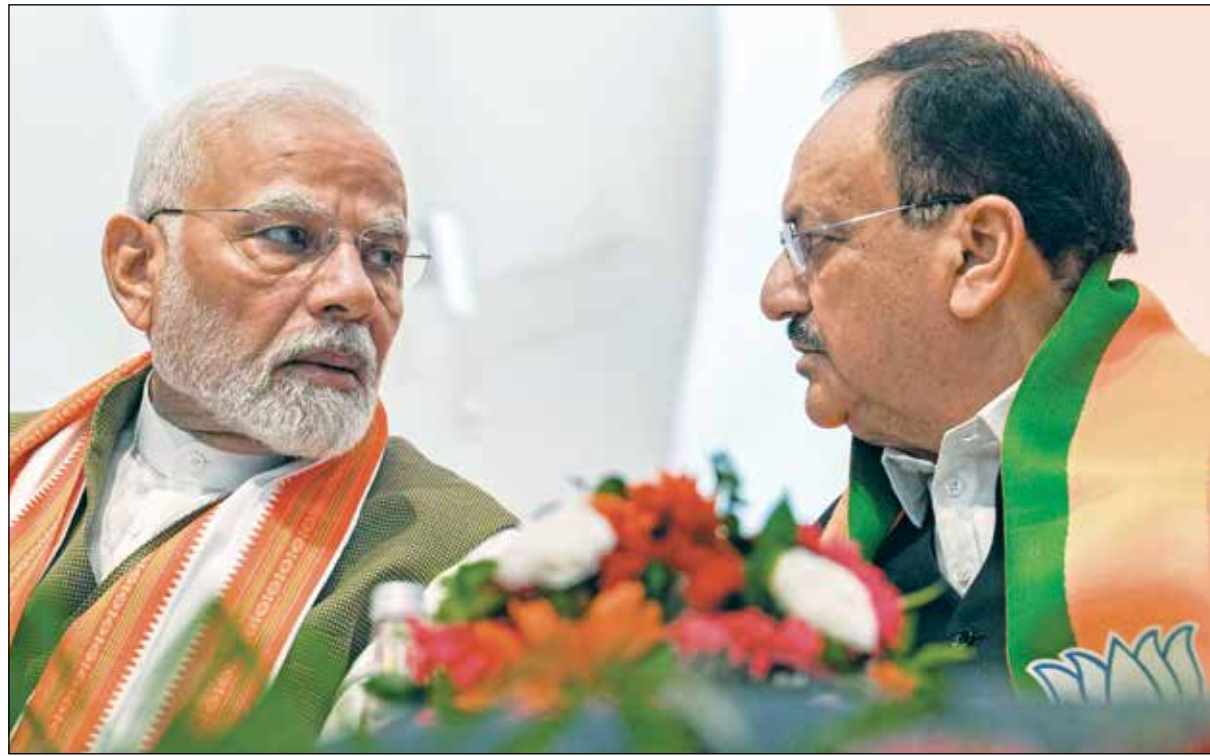
Prime Minister Narendra Modi with Union Minister and BJP National President J.P. Nadda during the launch of BJP's membership campaign 'Sadasyata Abhiyan 2024', in New Delhi on Monday.

A Rising Star in the World of Carrom: Ayesha Sajid Khan ... pg 10