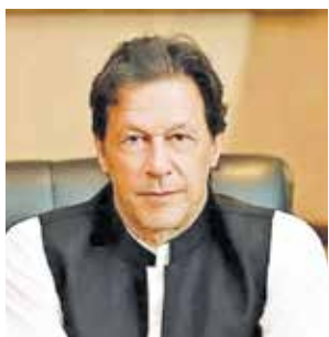
Imran Khan, former Prime Minister, Pakistan

"Sharif aligned with all four umpires (four military dictators) and still lost the match. Whenever the topic of negotiations arises, they start making noise about May 9 violence. We are always ready for talks. We will speak with those who make the decisions."