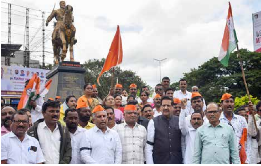
Former Chief Minister Prithviraj Chavan with Congress workers protest against the collapse of Chhatrapati Shivaji Maharaj's statue, in Karad on Tuesday.

Following an outrage, the Sindhudurg police also registered a case against contractor Jaydeep Apte and structural consultant