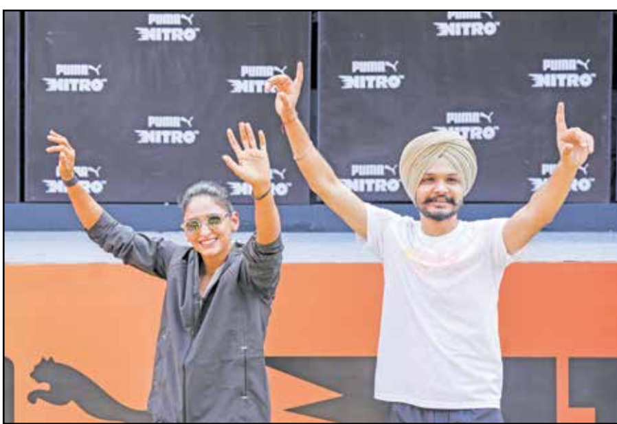
Indian women's cricket team captain Harmanpreet Kaur and Olympic medallist shooter Sarabjot Singh dance during the launch of the new 'race day t-shirt' for Vedanta Delhi Half Marathon 2024, in New Delhi on Tuesday.