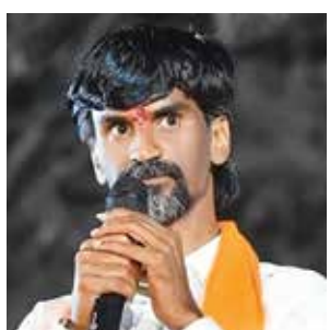
Manoj Jarange-Patil, Maratha reservation activist

"The government must act by September 30, or face the wrath of farmers. Farmers should express their dissatisfaction through their votes. Several people approached me to dissuade me from opposing the government and step into Sagar bungalow."