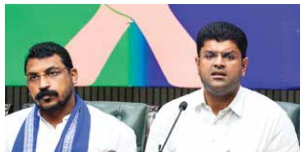
Jannayak Janata Party (JJP) chief Dushyant Chautala and Azad Samaj Party (Kanshi Ram) leader Chandra Shekhar Azad at a press conference after forming an alliance for the Haryana Assembly elections, in New Delhi on Tuesday.