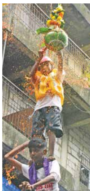
Youngsters involved in forming multi-storeyed human pyramids as part of the 'Dahi Handi' celebrations, enjoyed the festival in Mumbai on Tuesday. At least 63 'Govindas' were injured, officials said.