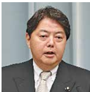
Yoshimasa Hayashi, Chief Cabinet Secretary, Japan

"The Chinese military aircraft's incursion into Japan's airspace not only is a serious violation of our territorial rights but also a safety threat. We found it absolutely unacceptable."