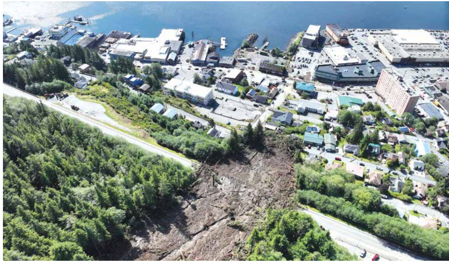
This drone photo shows the landslide in Ketchikan, Alaska.

Analysing the interaction between PM2.5 exceeding NAAQS (of 40 micrograms per cubic metre) and household air pollution, the team found that it substantially increased deaths among newborns by 19 per cent, children by 17 per cent and adults by 13 per cent. "The results demonstrate that PM2.5 exhibits a stronger association with mortality across various life stages. Notably, when (household air pollution) is considered in conjunction with ambient pollution, this association is further heightened," the authors wrote.