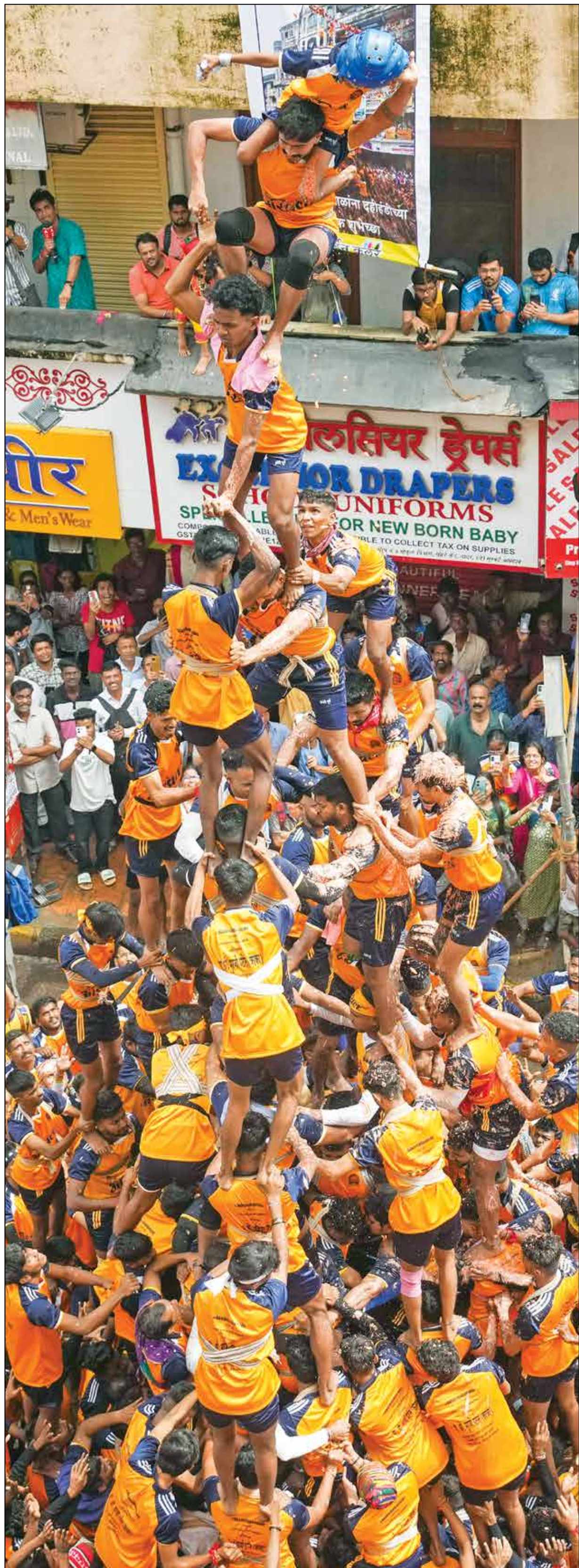
Govindas celebrated Dahi Handi festival with zeal in Mumbai on Tuesday.