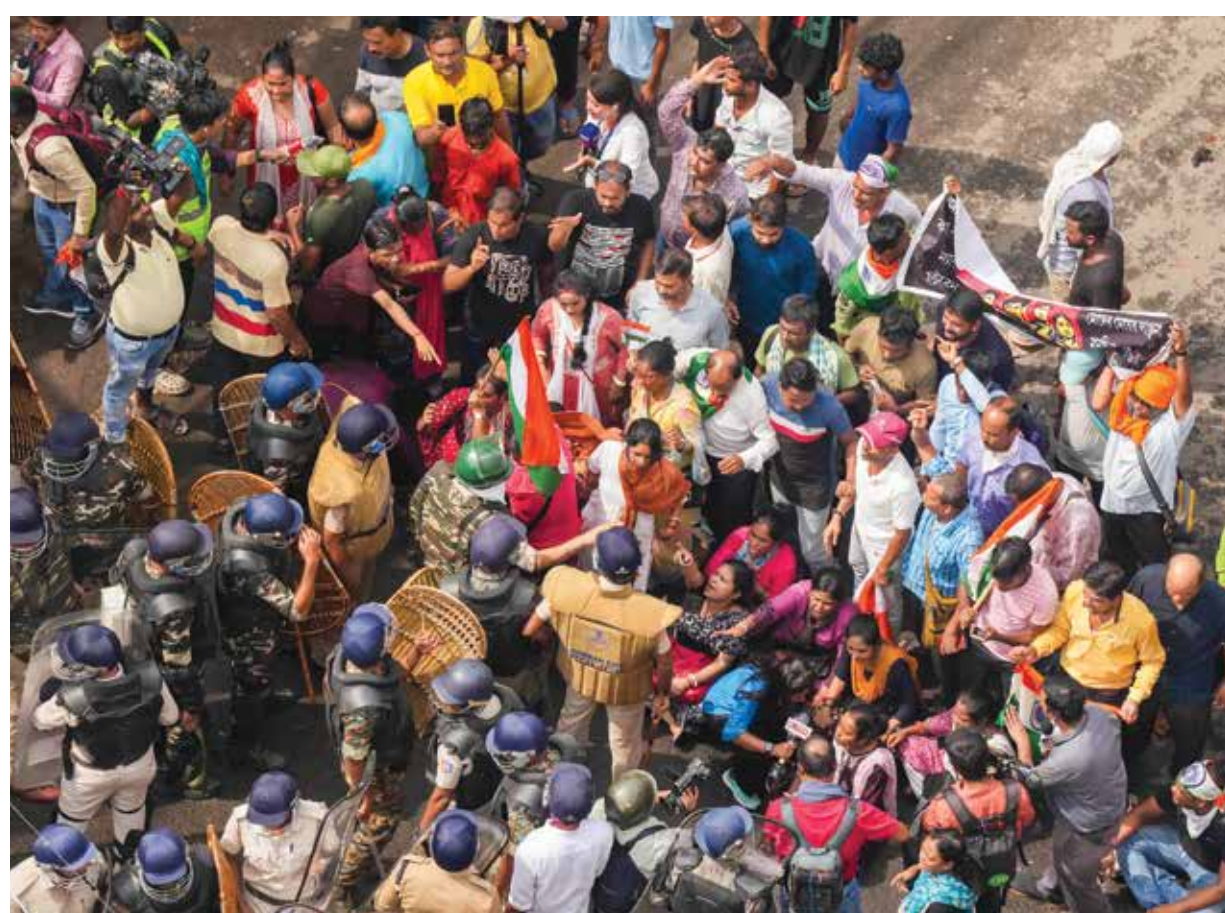
Police personnel try to stop students who were marching from Howrah Maidan towards the state secretariat in protest against the RG Kar Medical College and Hospital incident, in Howrah on Tuesday.