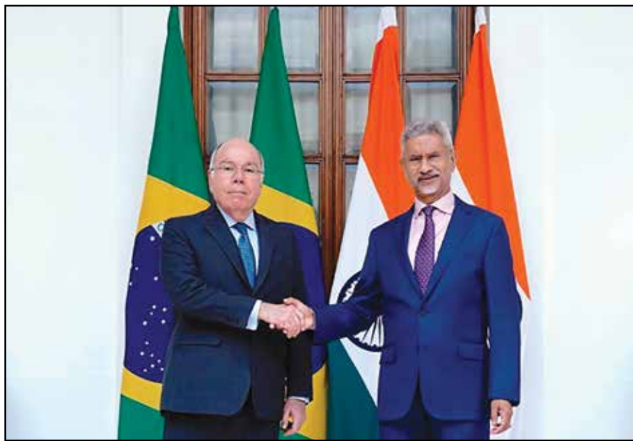
External Affairs Minister S. Jaishankar with Minister of Foreign Affairs of Brazil Mauro Vieira during a meeting, in New Delhi on Tuesday.