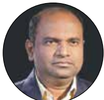
By Kiran D. Tare

first Assembly seat, championing issues like Kannada language rights and regional pride. His efforts to promote a state flag reflected a deep-rooted commitment to Karnataka's identity.