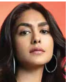
Mrunal Thakur, Actor

"If you remove my part from some movie, would it be the same name? If it makes a difference, then I would want to be part of that film even if it's one scene in the film. Having said that, there are great roles (for women)."