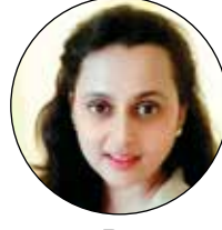
By Priya Samant

The Israeli Prime Minister Benjamin Netanyahu, in his address to the UN General Assembly on Friday, displayed two maps; one was titled "The Blessing," and the other "The Curse!" "The Blessing" did not identify the West Bank and the Gaza Strip, but showed all the territory as one nation, Israel! He announced the continuation of military actions in Lebanon and said "I've come here today to say enough is enough. We won't rest until our citizens can return safely to their homes."