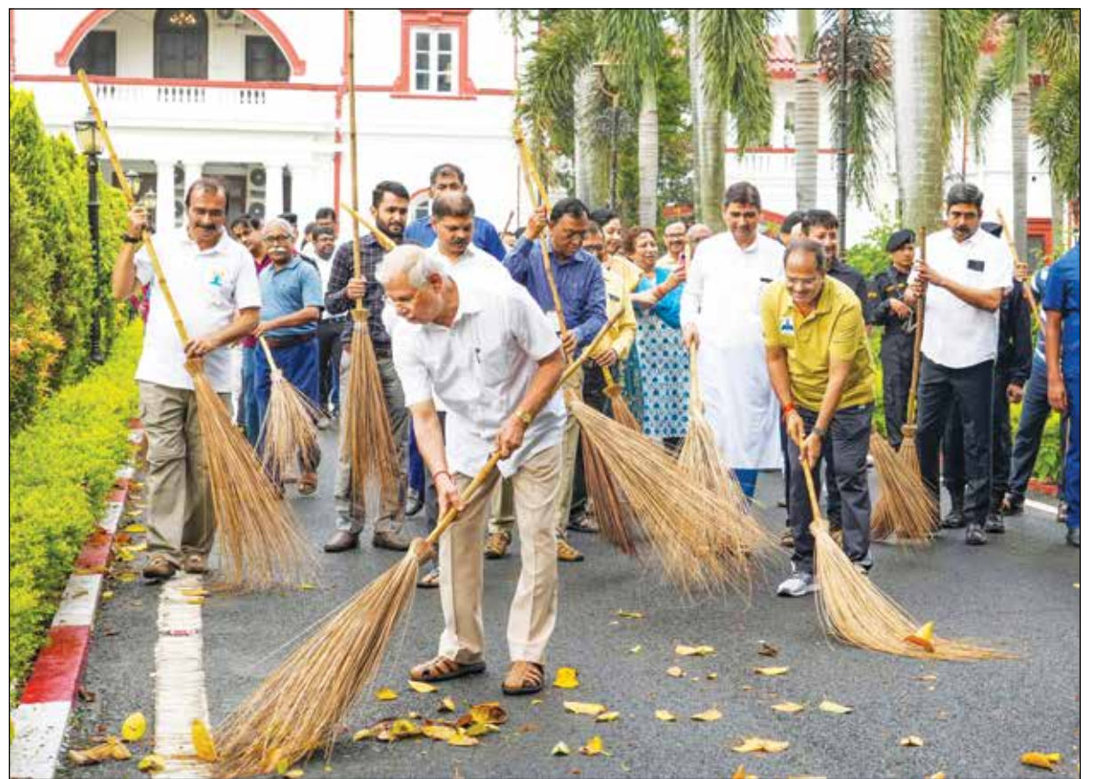
Bihar Governor Rajendra Arlekar takes part in a cleanliness drive in Patna on Friday.

The PIL had also challenged the decision taken by CIDCO, allotting part of the land to a private developer for residential and commercial development. -PTI