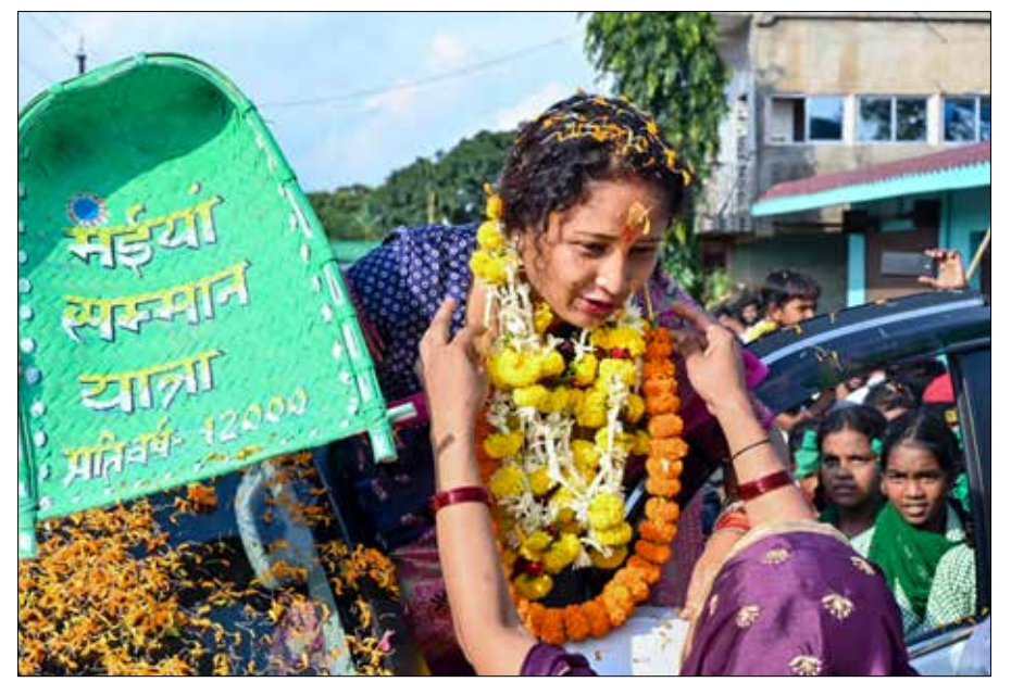
JMM leader Kalpana Soren during a programme as part of her 'Maiya Samman Yatra', at Chaibasa in West Singhbhum district, Jharkhand on Saturday.