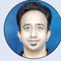
By Kaustubh Kale