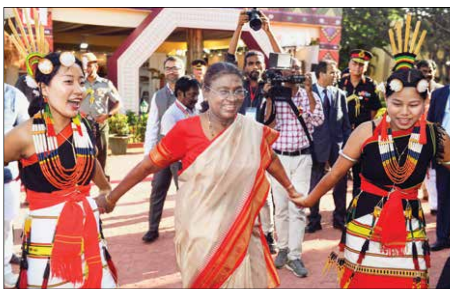
President Droupadi Murmu during the inauguration of Bhartiya Kala Mahotsav at Rashtrapati Nilayam, Secunderabad on Saturday.

that the demonstrations do not turn violent, officials said. Long traffic jams were reported from several parts of the city, including the Khanyar-Hazratbal axis, where most of the protests took place. Lok Sabha member from Srinagar Aga Ruhullah, who was canvassing for National Conference candidates, suspended his campaign. PDP president Mehbooba Mufti also suspended her next day's election campaign. "Cancelling my campaign tomorrow in solidarity with the martyrs of Lebanon & Gaza especially Hassan Nasarullah. We stand with the people of Palestine & Lebanon in this hour of immense grief & exemplary resistance," Mufti posted on X. The protest has taken place when the union territory is gearing up for the last leg of polling for Assembly elections.