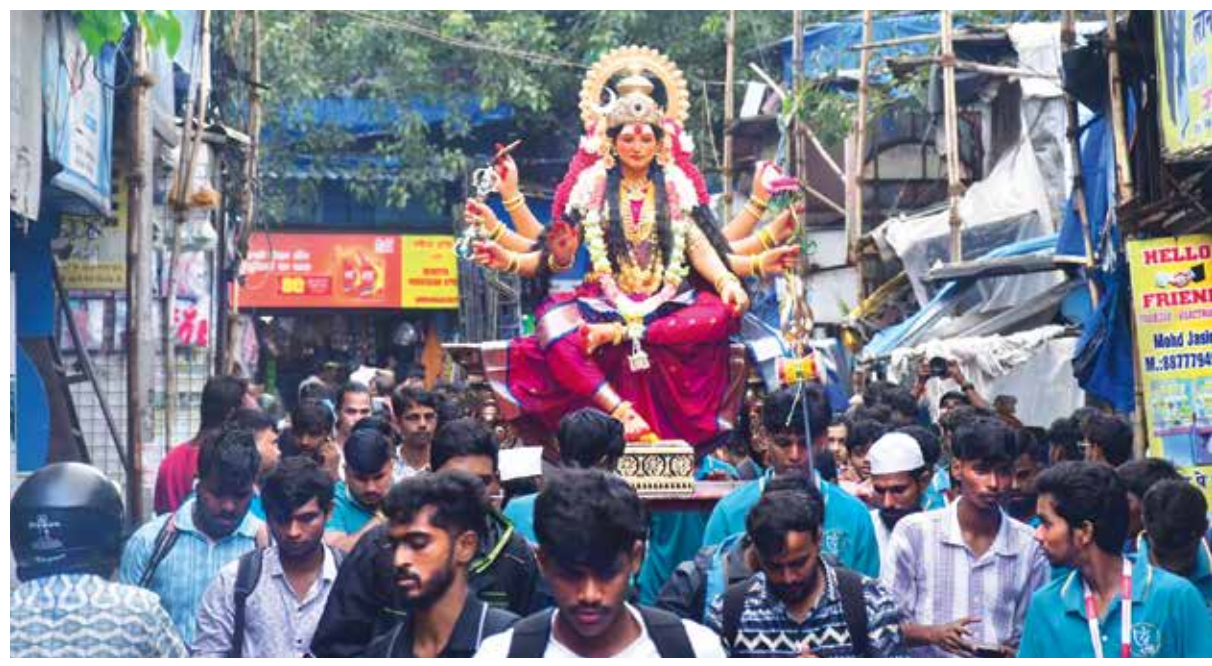
Devotees carry Goddess Durga idol to the pandal ahead of Navratri festival at Dharavi in Mumbai on Saturday.

It asked landlords have rented out their properties, including hotels, guest houses and 'musafir khana's to immediately furnish the particulars of their tenants through the citizen portal of Mumbai police. If the tenant is not an Indian citizen, then the owner and the foreigner will have to furnish information about the renter, including passport details, failing which action would be taken, the officer added.