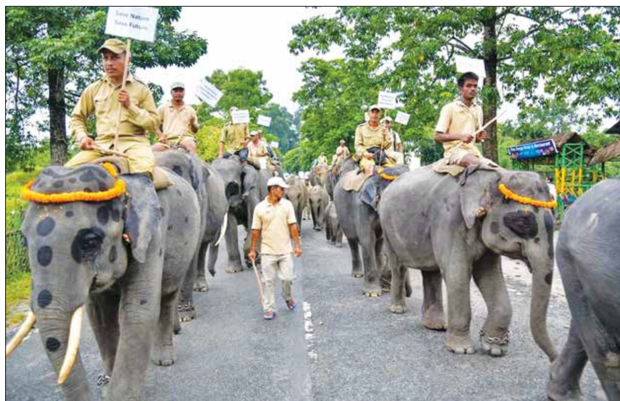
Elephants during a state level function on the World Tourism Day at the Manas National Park in Assam.

The mini moon will circle the globe for almost 57 days but won't complete a full orbit. On November 25, it will part ways with the Earth and continue its solo trajectory through the cosmos. -AP