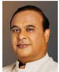
Himanta Biswa Sarma, Chief Minister, Assam

"The BJP will contest the Jharkhand elections in alliance with AJSU Party and JD(U). The seat-sharing agreement with the allies has been done on 99 per cent of the seats. Discussions are underway for the remaining one or two seats."