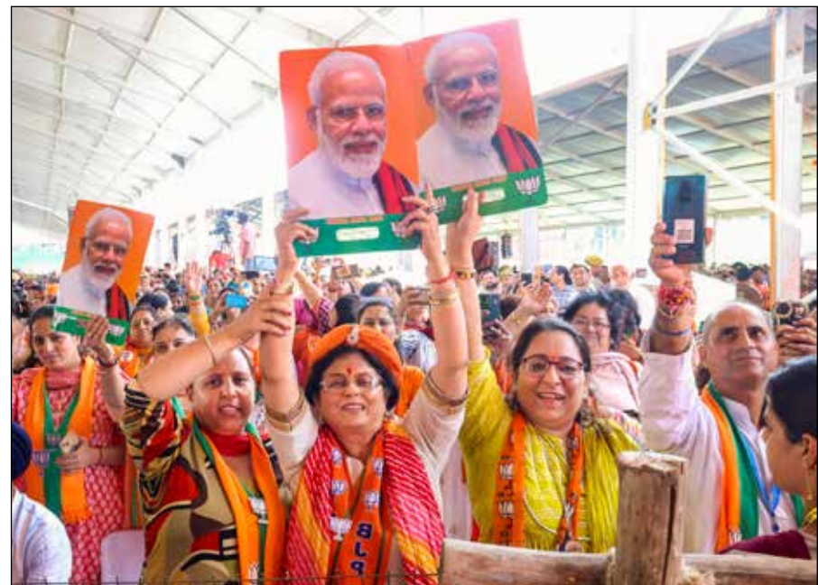
Supporters during a public meeting of Prime Minister Narendra Modi for the ongoing J&K Assembly elections in Jammu on Saturday.

The police official said the mortal remains of the