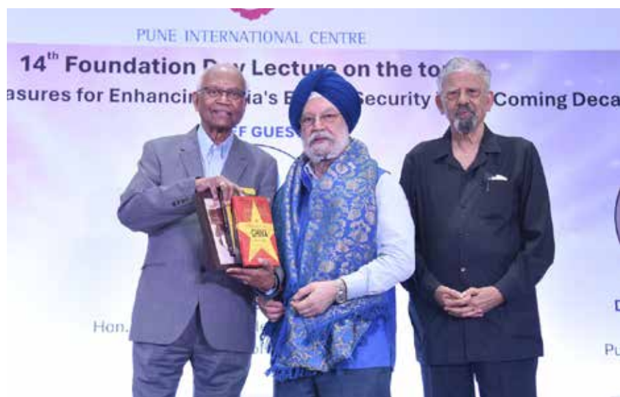
Minister of Petroleum and Natural Gas Hardeep Singh Puri at the Pune International Centre's (PIC) 14th Foundation Day lecture.

As a result, there is a wide difference in quality and performance of malls in India. While Grade A malls have very low vacancies, Grade B and Grade C malls have had to contend with high vacancy levels. Grade A malls with leadership positions in their respective micro markets with more than 0.5 million square feet of gross leasable area are able to attract better quality tenants.