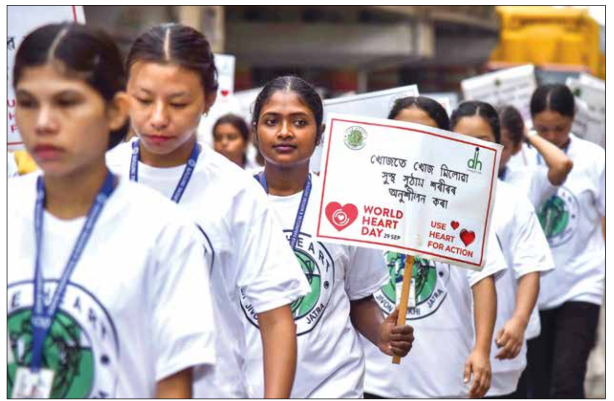
Students participate in a rally organised by Cardiological Society of India (CSI), Assam on World Heart Day in Guwahati on Sunday.