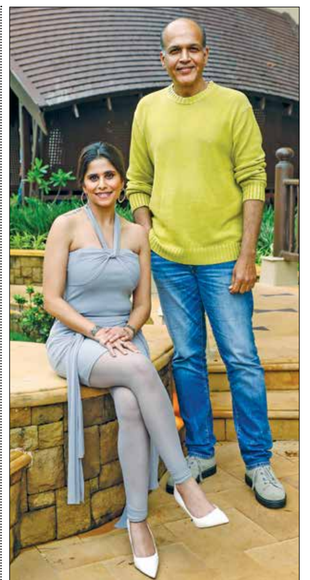
Director and actor Ashutosh Gowariker and actor Sai Tamhankar pose for photos during the promotion of their upcoming series 'Manvat Murders' in Mumbai on Sunday.

As per the condition, the Adani Foundation cannot change the minimum student strength limit and it will have to take full responsibility of the teaching and non-teaching staff. There would not be any change in the conditions of approval for the school. The order also states that Adani Foundation will have to follow the rules-orders regarding the school, teachers, non-teaching staff and their salaries, students, etc.