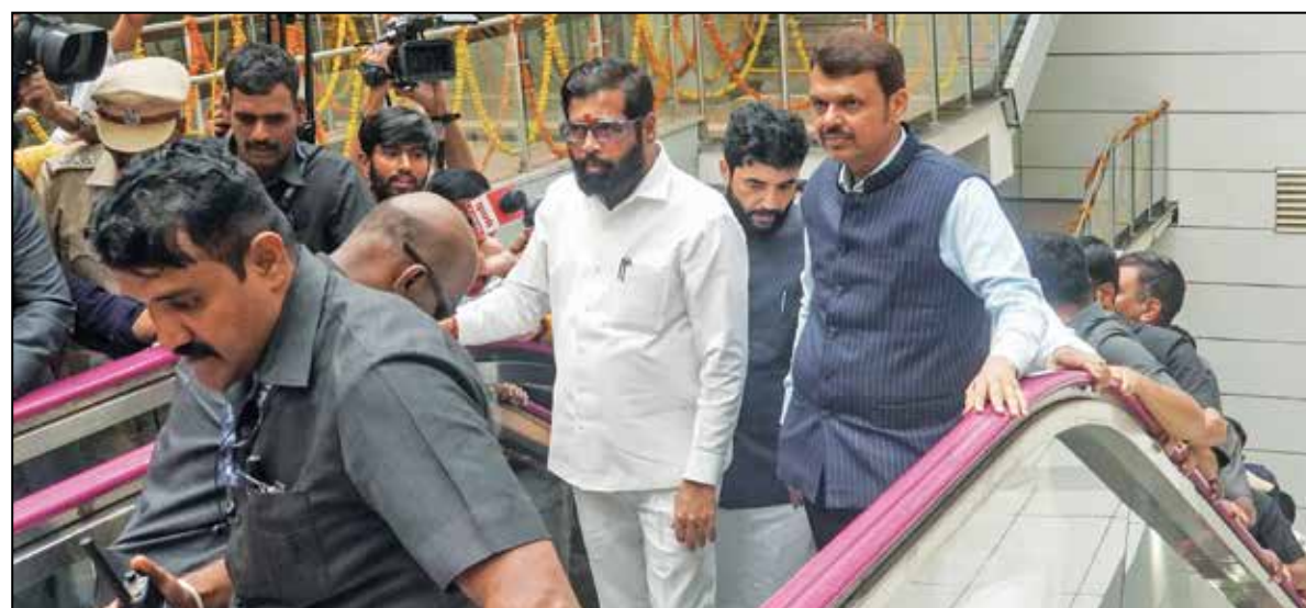
Maharashtra Chief Minister Eknath Shinde with Deputy CM Devendra Fadnavis during the inauguration of the southern extension of Pune Metro Phase 1 by Prime Minister Narendra Modi on Sunday.