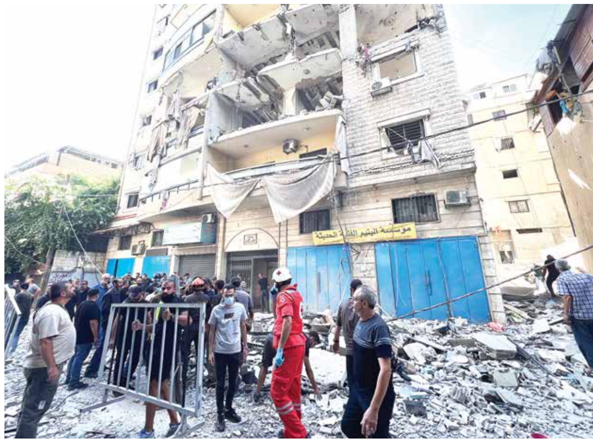
Rescuers arrive at the scene of an Israeli airstrike in Beirut's suburb of Ghobeiri on Sunday.

Hundreds of thousands of people have been driven from their homes in Lebanon by the latest strikes. The government estimates that around 250,000 are in shelters, with three to four times as many staying with friends or relatives, or camping out on the streets.