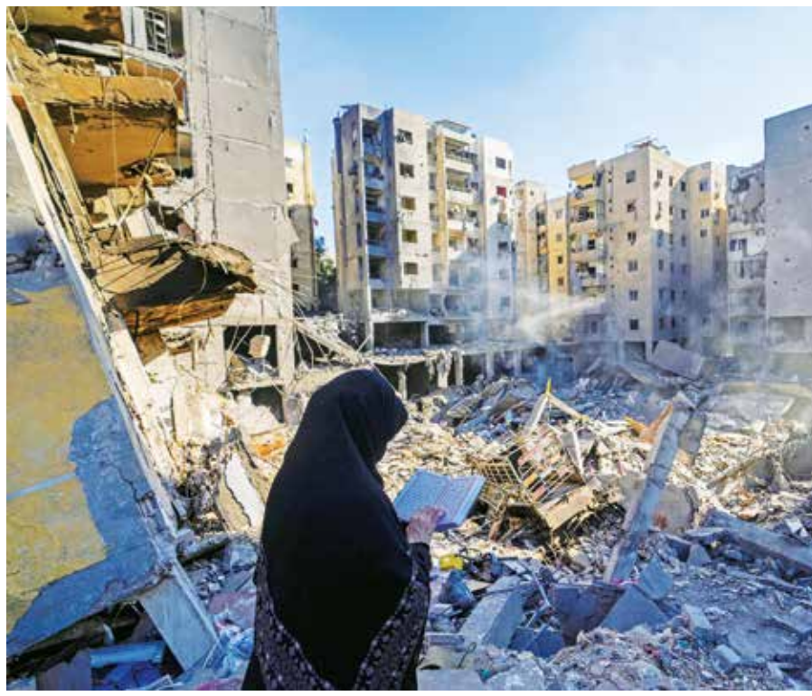
A woman reads the Quran at the site of the assassination of Hezbollah leader Hassan Nasrallah in Beirut's southern suburbs on Sunday.

"Hezbollah will not back down following the killing of its leader, as it will need