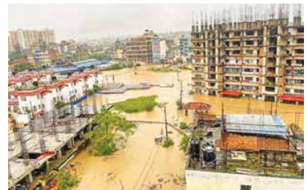
A flood-affected area following heavy rainfall in Kathmandu, Nepal on Sunday.

Eyewitnesses said they had never seen such a devastating flood and inunda-