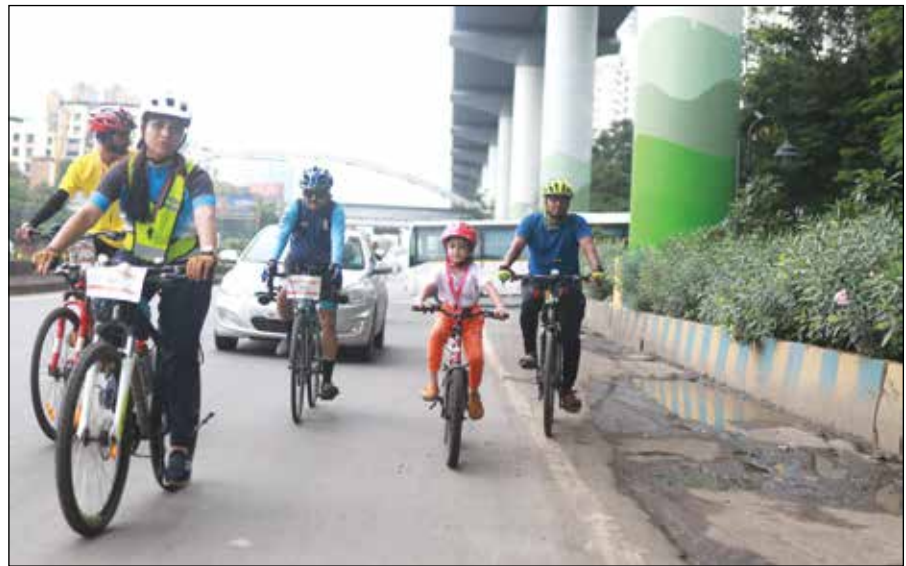
The members of Ghodbunder Ride Masters, a cycling club, took part in the third edition of the ride on Sunday.

Information about such individuals, particularly repeat offenders and those found guilty of sexually assaulting girls, has been collected from various police databases, he said.