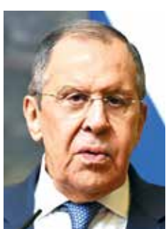
Sergey Lavrov, Foreign Minister, Russia

"I'm not going to talk here about the senselessness and the danger of the very idea of trying to fight to victory with a nuclear power, which is what Russia is."