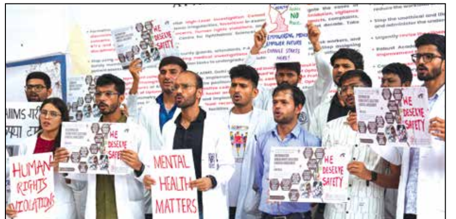
AIIMS students stage a protest to highlight their struggle for justice and resolution of strike-related concerns in New Delhi on Sunday.