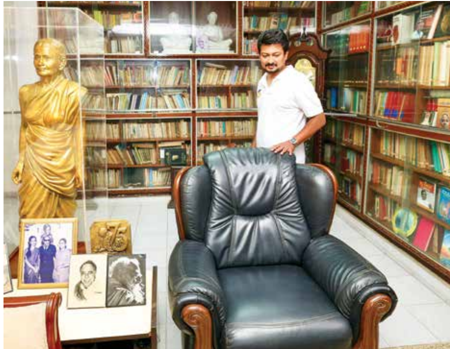
DMK leader Udhayanidhi Stalin visits his grandfather M. Karunanidhi's residence before taking oath as Tamil Nadu deputy Chief Minister in Chennai on Sunday.

Born on November 27, 1977, Udhayanidhi's real innings in his party began with his appointment as DMK youth wing secretary in July 2019 and under his leadership, the party reaffirmed its goal to inculcate the Dravidian spirit into the party cadres by organising ideology-based workshops and interactions and the focus remained on using technology to reach out to more and more youths and increase party membership. Also, several other