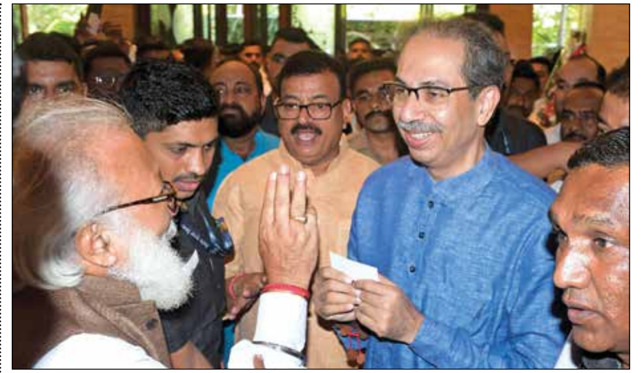
Shiv Sena (UBT) Chief Uddhav Thackeray acknowledges party workers upon his arrival at the Airport in Nagpur on Sunday.

Modi inaugurated the Solapur Airport which would significantly improve connectivity, making Solapur more accessible to tourists, business travellers and investors. The existing terminal building of Solapur has been revamped to serve around 4.1 lakh passengers annually.