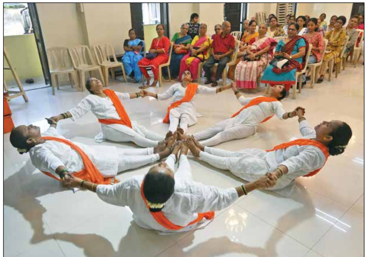
Ahead of the 300th birth anniversary of freedom fighter Ahilyabai Holkar, women workers of RSS Sangh performed yoga in the form of dance to create awareness about the sacrifice of Ahilyabai Holkar at Girgaum on Sunday.

said, "I am not aware of this particular issue. The party bigwigs will take the decision on this. But if you ask my personal opinion, this is not practical. Changing a person sitting on the Chief Minister's post every now and then will affect the entire administration and governance". Speaking about the Ajit Pawar's demand, Bachchu Kadu of Prahar Janshakti Party said, forget about rotating CM's post, Ajitdada will quit the Mahayuti before the election. There are strong undercurrents in the corridor of power that the Mahayuti will vertically split before announcement of the elections".