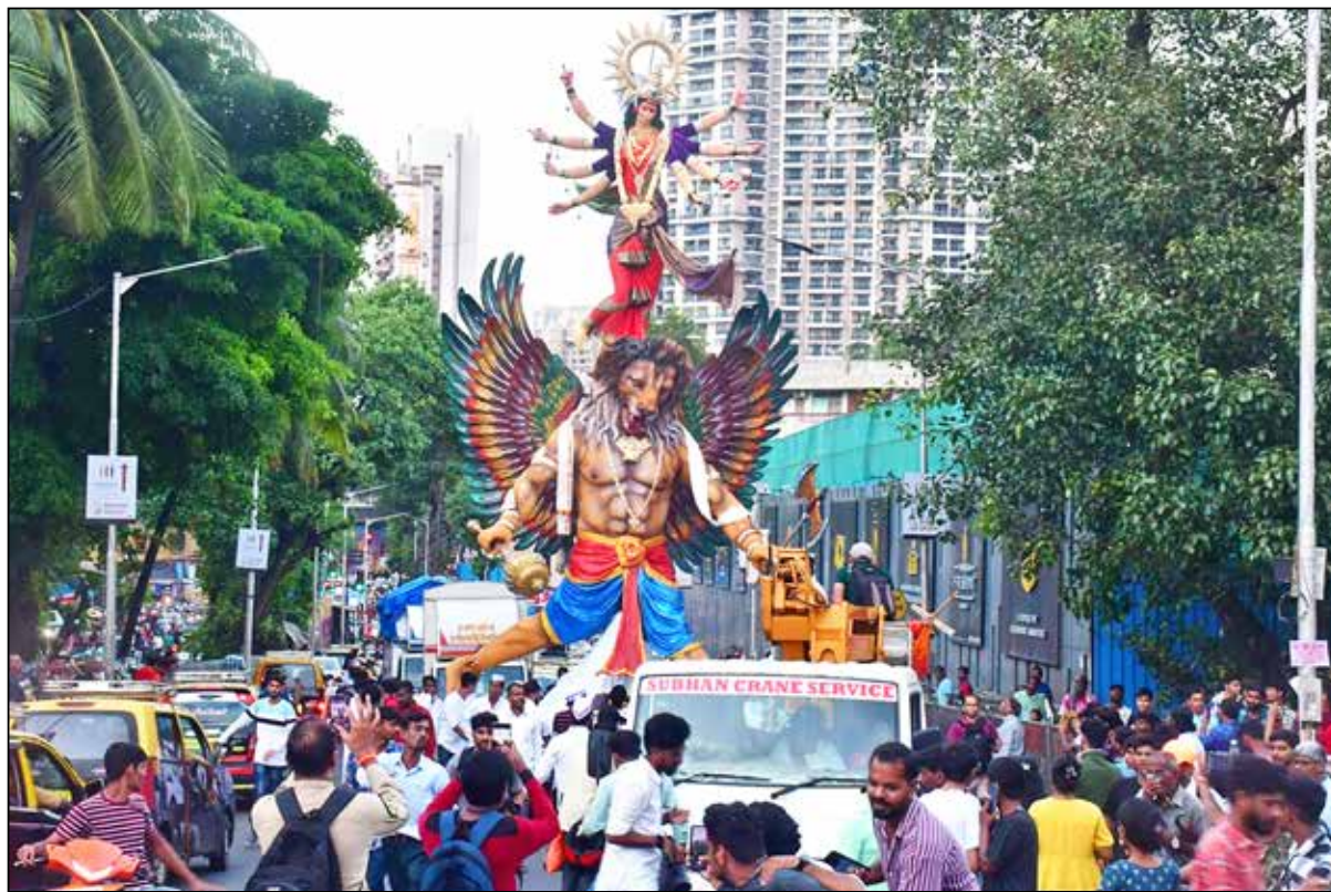
Devotees carry Goddess Durga idol to the pandal ahead of Navratri festival, in Mumbai.

Police registered an FIR and arrested the three brothers under relevant sections of the Indian Penal Code (IPC) for rape and molestation and under provisions of the Protection of Children from Sexual Offences Act (POCSO). Further investigation is underway, the officer added.