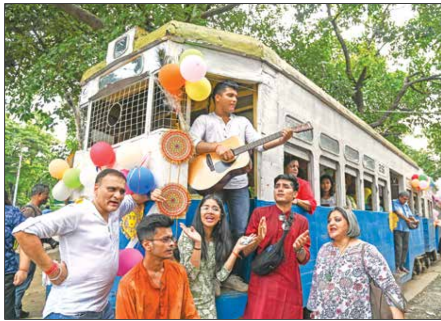
Tram lovers perform a song as part of a campaign to save tram services in the city, at Esplanade tram depot in Kolkata on Sunday.

BJP Karnataka chief BY Vijayendra and party leader Nalin Kumar Kateel have also been named in the FIR. -PTI