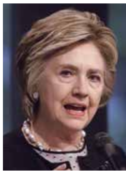
Hillary Clinton, Former Secretary of States, US

"I know her heart and her integrity. We both got our start as young lawyers helping children who were abused or neglected. Those kids stay with you. Kamala carries with her the hopes of every child she protected, every family she helped, every community she served."