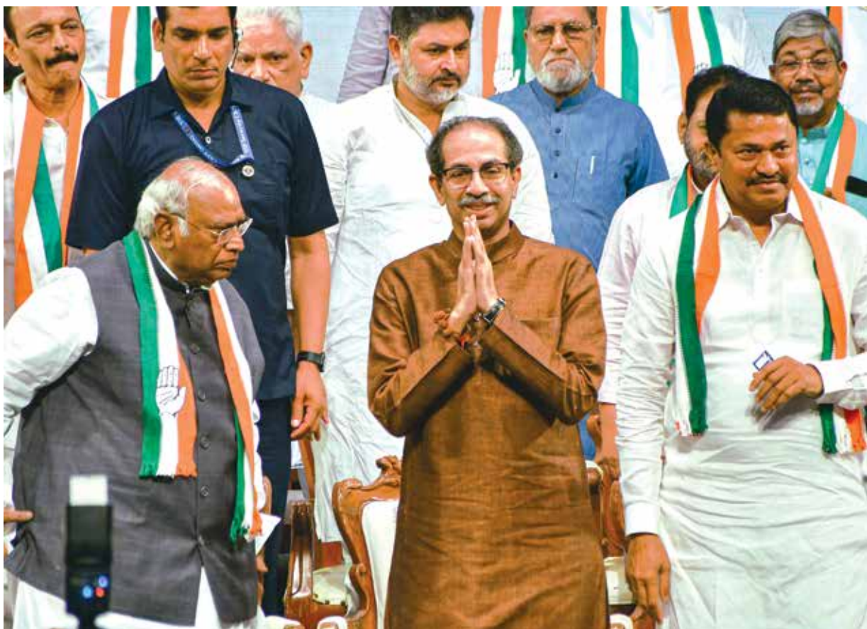
Congress President Mallikarjun Kharge with Shiv Sena (UBT) chief Uddhav Thackeray and Maharashtra Congress President Nana Patole during a 'Sadbhavana Diwas' event to mark the birth anniversary of former prime minister Rajiv Gandhi on Tuesday.