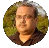
By Abhijit Mulye

The state has witnessed a spate of political violence, often pitting TMC cadres against opposition workers, particularly from the BJP notably during the 2021 assembly elections and its aftermath, which saw widespread voter intimidation and booth capturing. Under Banerjee's leadership, West Bengal's economy has stagnated, with the State's industrial sector struggling to attract investment. The much-publicized Tata Nano debacle in Singur, where Banerjee led a successful campaign to oust the automaker, remains a symbol of missed opportunities for industrial growth. While Banerjee's focus on social welfare schemes has garnered her substantial support among the rural poor, it has come at the cost of long-term economic planning. The state's education and healthcare sectors, once the pride of Bengal, are now in decline with appointments often based on loyalty rather than merit. As West Bengal navigates these turbulent waters, the cracks in Banerjee's once formidable edifice are widening, and the stakes have never been higher.