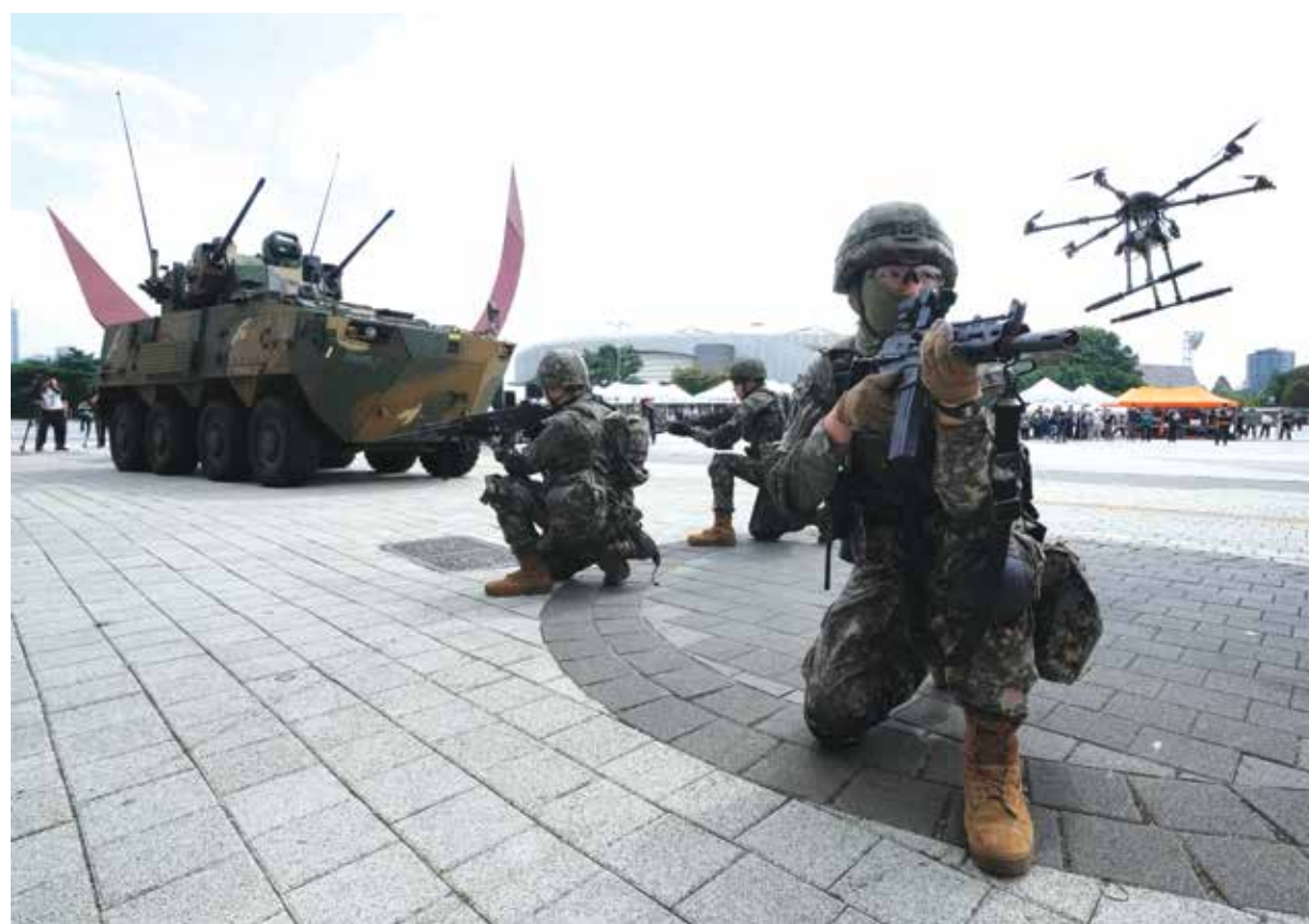
South Korean army soldiers conduct an anti-terror drill as a part of the Uchi Freedom Shield military exercise between the U.S. and South Korea in Seoul, South Korea on Tuesday.

The migrants, from Syria, Egypt, Sudan, and Bangladesh, included six children and arrived before dawn on the tiny island of Gavdos, near Crete's southern coast, local officials said. Usually, they are detained for identification and processing.