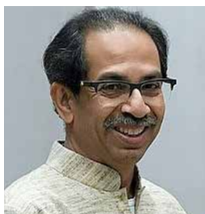
Uddhav Thackeray, Chief, Shiv Sena (UBT)

"Sena chief Bal Thackeray harshly criticised Rajiv Gandhi (when Gandhi was PM) but at no point I recall CBI, ED or Income Tax knocking on the doors of Shiv Sena leaders," he further said, taking a veiled swipe at the BJP-led Union government."