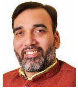
Gopal Rai, Environment Minister, Delhi

"I believe that with the central government's support, we can build on the foundation laid by the Delhi government and work towards a long-term solution to this crisis of air pollution. I trust that you will take the necessary steps to ensure a cleaner and healthier future for all."