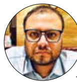
By Mahesh Nayak

Markets do not like uncertainty. However, despite the global market being volatile due to concerns over the US recession, global geopolitical challenges or the Japanese economy increasing its interest rates after two decades, the Indian equity market continues to demonstrate remarkable resilience, scaling to its all-time highs.