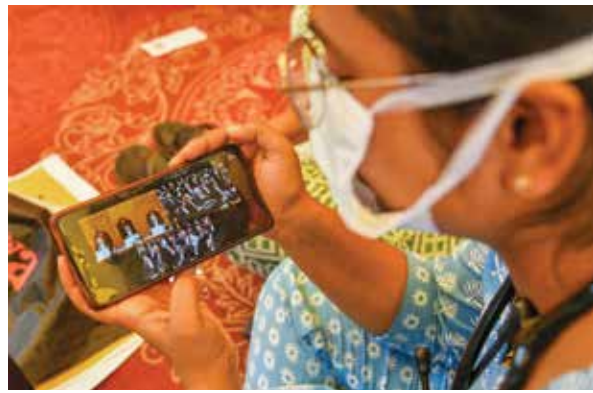
A doctor watches the Supreme Court hearing on her mobile Chandigarh on Tuesday.