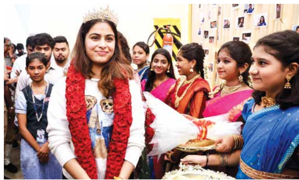
Paris Olympic bronze medalist Manu Bhaker during a felicitation event, in Chennai, Tuesday.

Reflecting on her journey, the champion shooter said she has learnt a lot in the last few years and urged the youngsters to never shy away from learning new things.