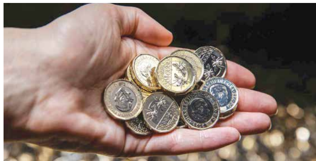
New one-pound coins featuring King Charles III and British bees issued by the Royal Mint.

(The views expressed by the author is personal and does not reflect the views of any organisation or persons.)