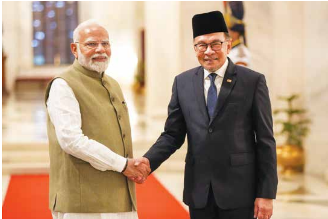
Prime Minister Narendra Modi with his Malaysian counterpart Anwar Ibrahim during the latter's ceremonial reception, at the Rashtrapati Bhavan, in New Delhi, on Tuesday.

While 18 people were accused in the case, a separate trial was conducted for these six accused. The other accused have either completed their term or been acquitted by the courts. The girls were aged between 11 and 20 years.