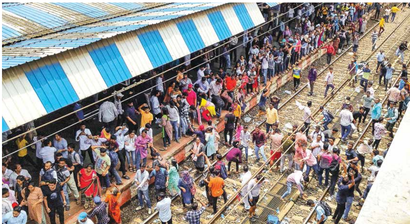
Protesters block train movements for more than 10 hours at Badlapur demanding stern action against the accused on Tuesday.

At the railway station, as the protest hampered the movement of trains and caused inconvenience to scores of commuters, police personnel and other authorities tried to convince the protesters to end the agitation, but in vain. Some of the agitators hurled stones during the protest, but the situation was soon brought under