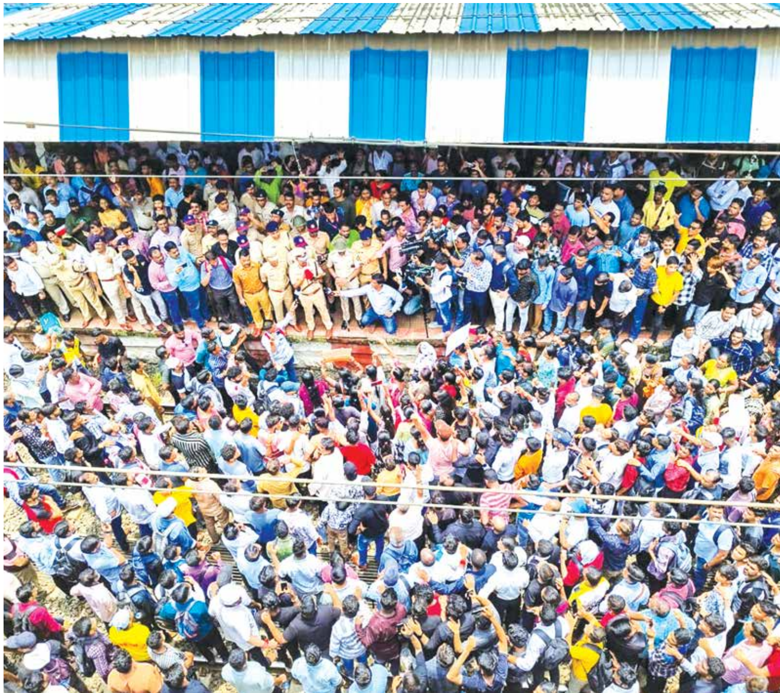
Hundreds of angry residents halted train services at Badlapur railway station demanding action against the culprit on Monday.

Praggnanandhaa draws with Abusattorov ... pg 10