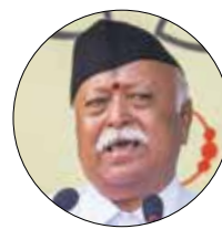
By Mohan Bhagwat

The inspiration required to ensure that all these things are followed uninterrupted is the inspiration of 'self-esteem'. Who are we? What is our tradition and our purpose? Is the idea clear and exact in our minds about the nature of a larger, all-inclusive, humane identity that has been passed down since ancient times to us Bharatiyas? It is necessary for everyone to know this.