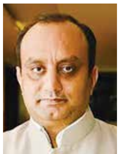
Sudhanshu Trivedi, Spokesperson, BJP

"The Congress which stood for orthodox Islamic practices like triple talaq, halala and hijab is now making all kinds of baseless remarks about the Hindu society. This is the design of the urban Naxal mindset that PM Narendra Modi talks about."