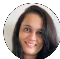
By Ruddhi Phadke