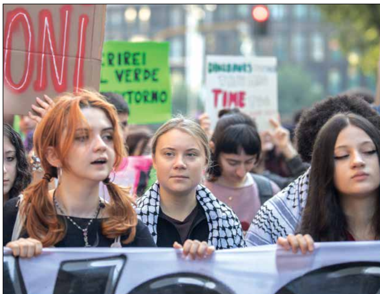
Activist Greta Thunberg (center) attends a Fridays for Future's Climate Strike march in Milan, Italy on Friday.