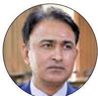
By Kaswar Klasra