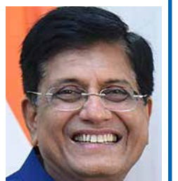
Piyush Goyal, Union Minister for Commerce and Industry

"Extraneous items which have no relevance to trade or business are what are hurting the interest of trade and business. When we are trying to bring in too many extraneous elements into a free trade agreement, we are getting cornered into slow progress."