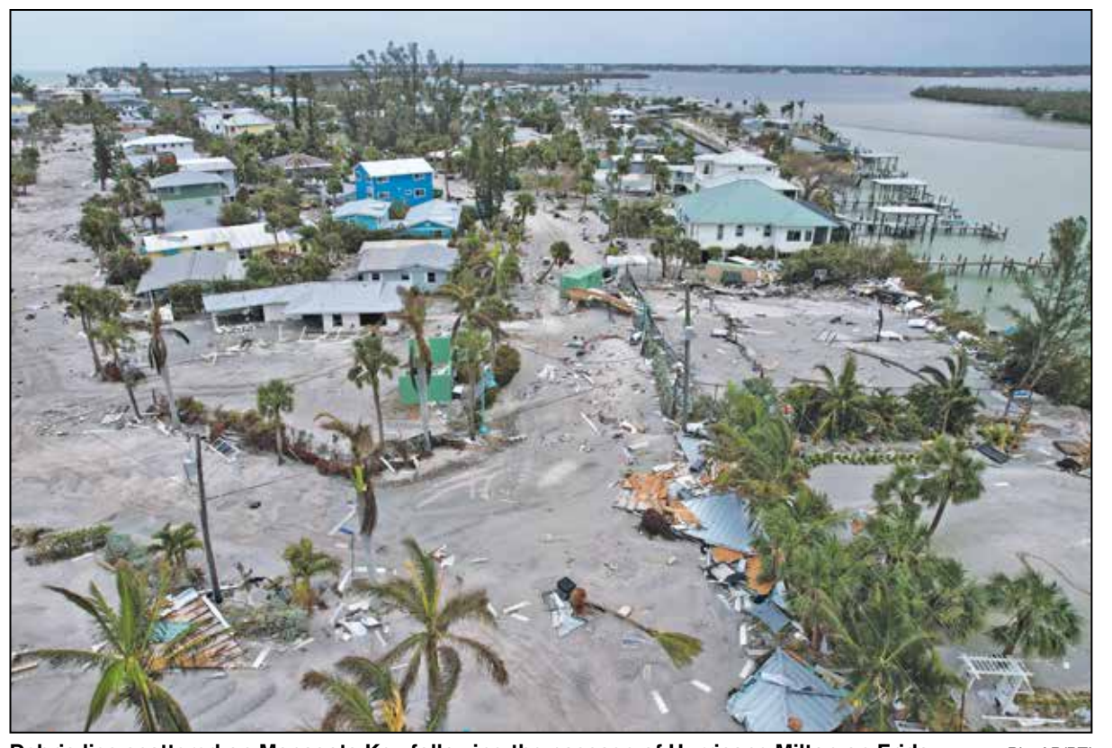
Debris lies scattered on Manasota Key following the passage of Hurricane Milton on Friday.

Mining water ice could produce oxygen, drinking water and rocket fuel -- all vital for sustaining lunar exploration and beyond.