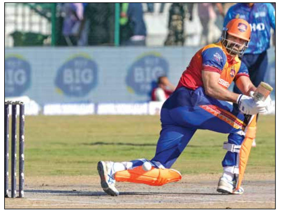
Cricketer Yusuf Pathan plays a shot during a Legends League cricket match between Konark Suryas and Southern Super Stars, in Srinagar on Saturday.