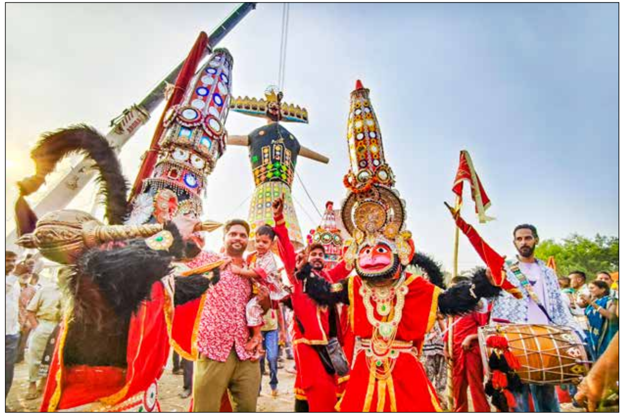
Devotees dressed as 'langoor' take part in a religious procession, marking the Navratri festival and 'Langoor Mela' celebrations at Durgiana temple in Amritsar on Saturday.

Chief Minister N Chandrababu Naidu, on behalf of the state government, presented silk robes to Srivari temple on October 4.