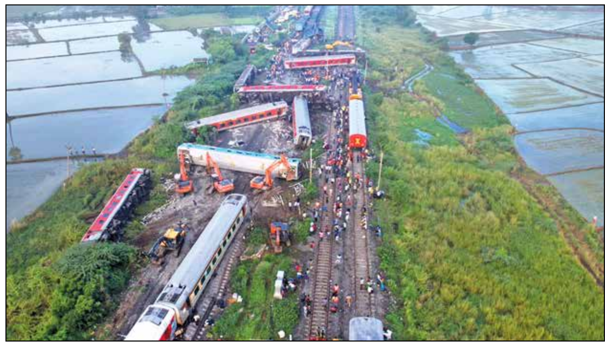
Restoration work underway after an express train rammed into a stationary train on Friday at Kavaraipettai in Tiruvallur district on Saturday.