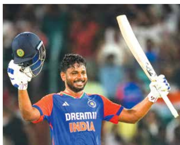
Sanju Samson celebrates his century during the third and final T20 International cricket match between India and Bangladesh in Hyderabad on Saturday.

Chief minister-designate Omar Abdullah met Lieutenant Governor Manoj Sinha on Friday and requested him to fix the date for the swearing-in.