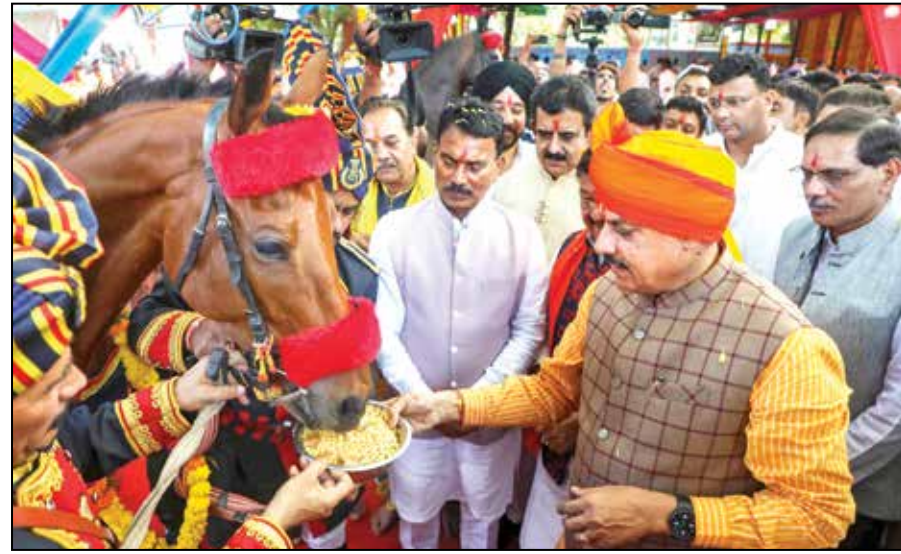
Maha Pradash Chief Minister Mohan Yadav during 'Ashwa Puja' on the occasion of Vijaya Dashami festival in Indore on Saturday.

The top seeds were off to a flier with breaks in the first and third games.