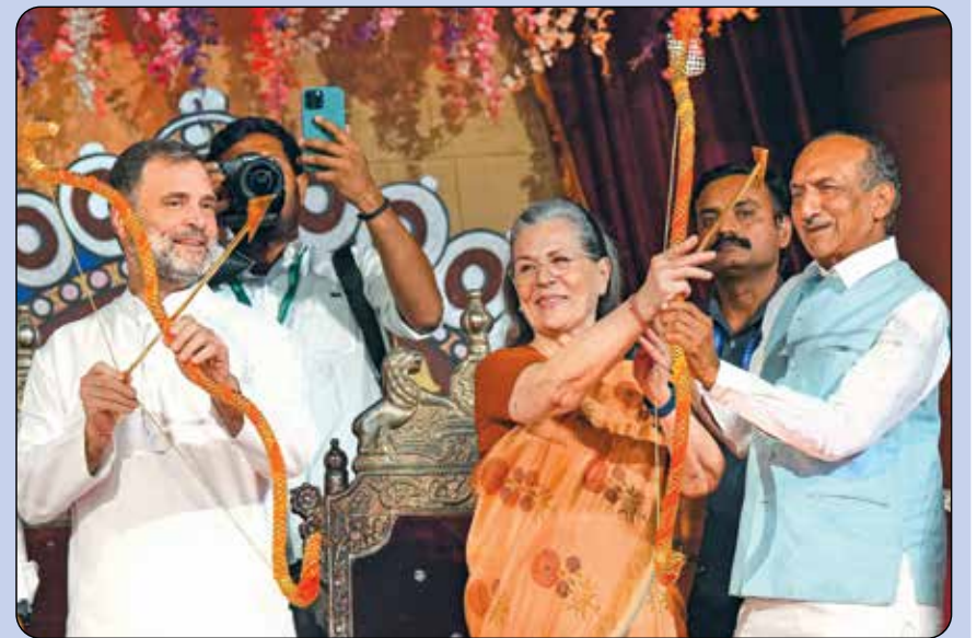
President Droupadi Murmu, Prime Minister Narendra Modi, Congress leaders Sonia Gandhi and Rahul Gandhi hold bow and arrow during celebration of the 'Dussehra' (Vijayadashami) festival organised by Shri Dharmik Leela Committee, Red Fort ground in New Delhi on Saturday.