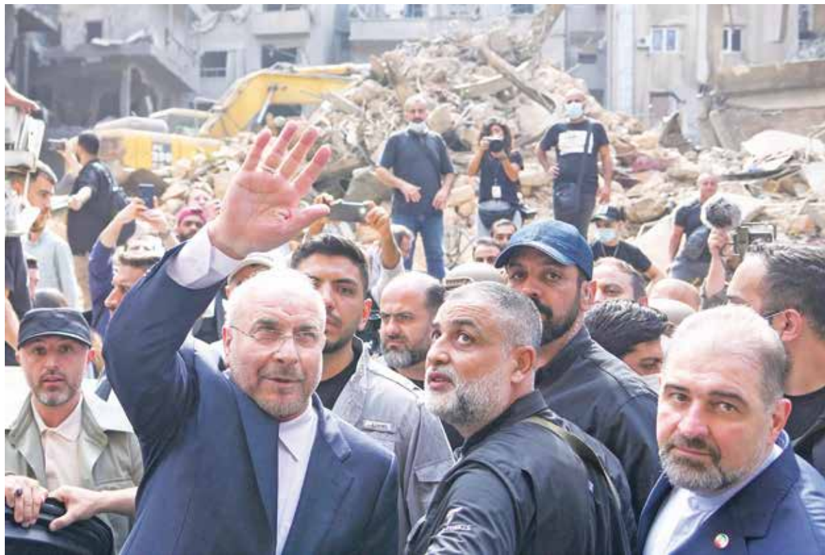
Iran's parliament speaker Mohammad Bagher Qalibaf (left) waves to residents as he visits the site of Thursday's Israeli airstrike in Beirut, Lebanon on Saturday.

Israeli forces and Hezbollah fighters have been clashing since Oct. 8, 2023, when the Lebanese militant group began firing rockets over the border in support of its ally Hamas in Gaza. As Israeli troops made their first forays across the border and Hezbollah responded with rocket fire, Lebanese soldiers withdrew from obser-