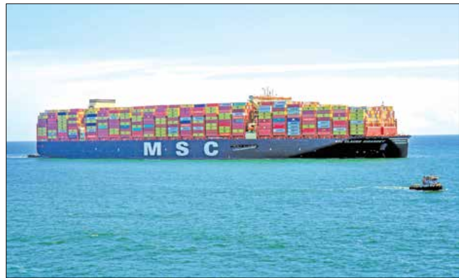
Container vessel MSC Claude Girardet reaches at Vizhinjam International Seaport Limited (VISL) in Thiruvananthapuram on Friday.

"It's pouring heavily in #Delhi, affecting flight schedules. If you're planning to jet off, please keep a tab on your flight status... and plan ahead, as roads leading to the airport may be waterlogged," IndiGo said in a post on X at 5.03 pm. In a post on X at 5.12 pm, SpiceJet said that due to bad weather in Delhi, all departures/arrivals and their consequential flights may get affected.