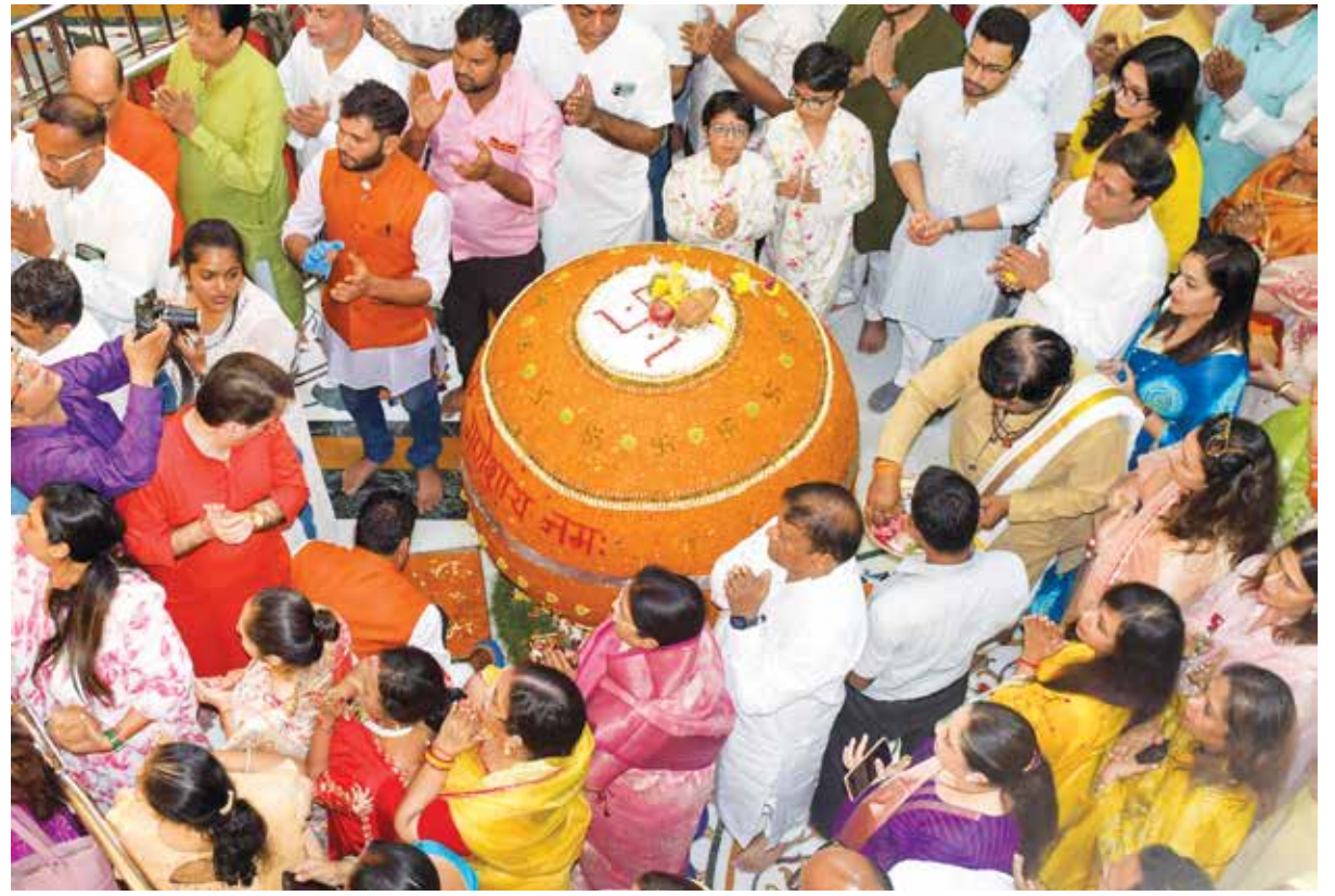
Devotees offer 1101 kg 'Ladu' to Lord Ganesh at a temple during Ganesh Chaturthi festival, in Nagpur on Friday.

The police have warned against making hoax phone calls saying it is liable for punishment.