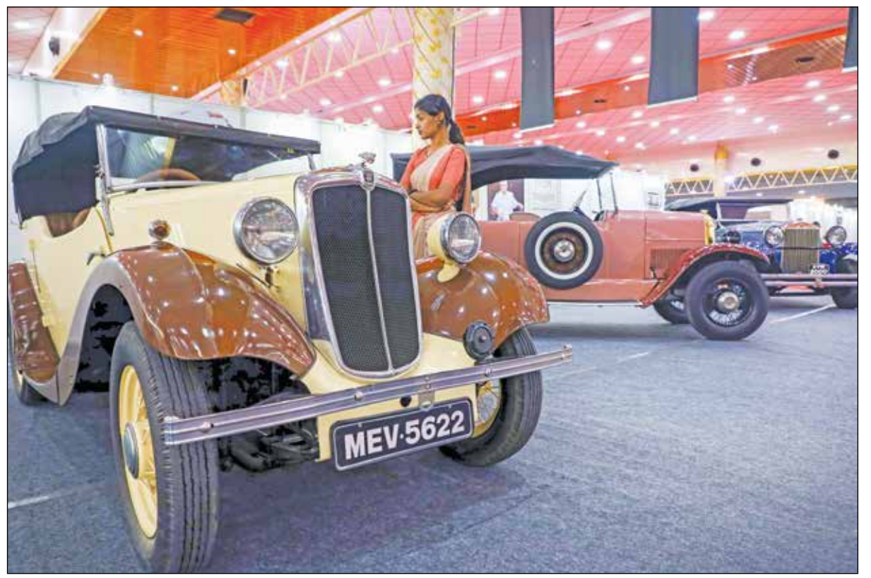
Vintage cars on display at Auto Show, at Palace Grounds in Bengaluru on Friday.