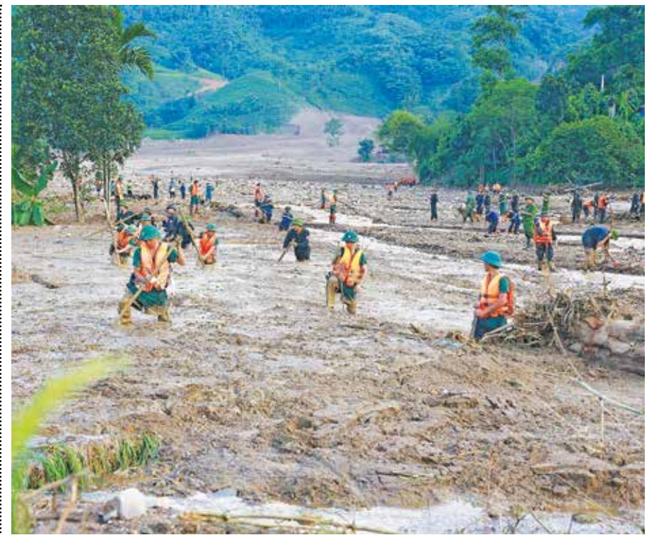
Rescue workers search for the missing after a flash flood buries a hamlet in mud and debris in the aftermath of Typhoon Yagi in Lao Cai province, Vietnam on Thursday.

"We are observing their behaviour and health meticulously to ensure a successful breeding programme," the official said.