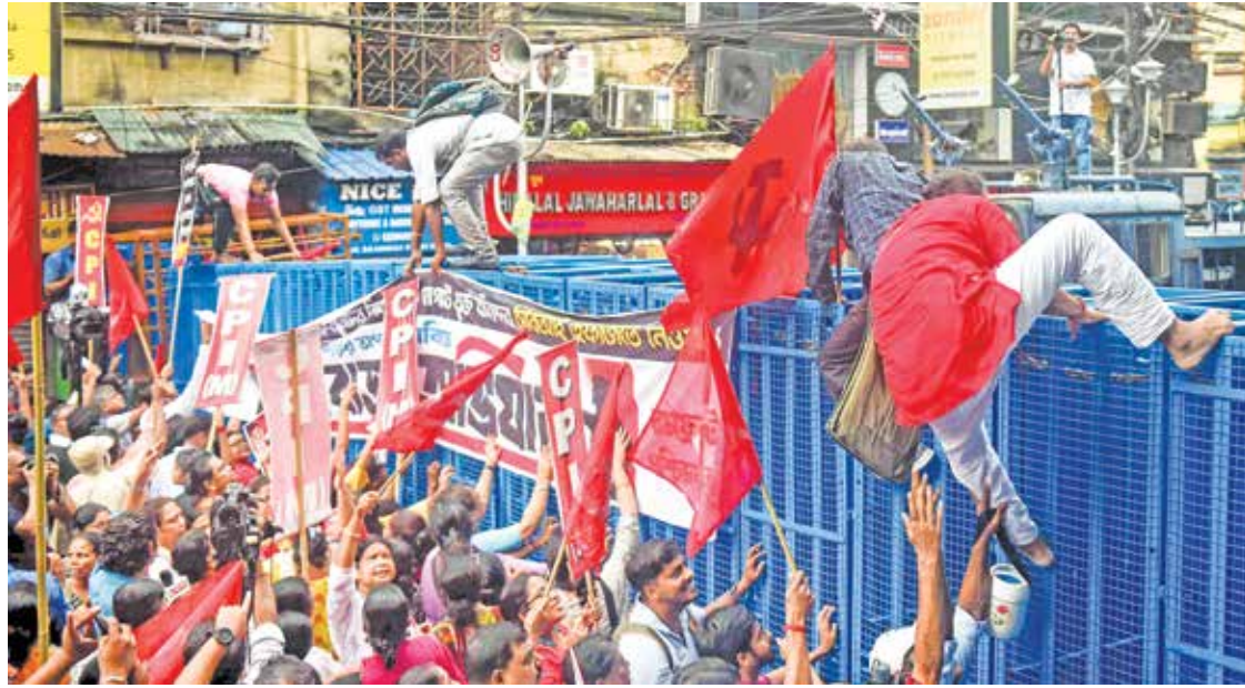
Protesters climb makeshift barricades put up by the police during a protest in Kolkata on Friday.

The CPI(M)-led Left Front on Friday conducted a protest march to Kolkata police headquarters to press for the resignation of police commissioner Vineet Goyal over alleged mishandling of the rape