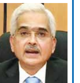
- Shaktikanta Das, Governor, RBI

"Fiscal consolidation is underway and public debt levels are on a declining trajectory over the medium-term. Corporate performance has improved strongly, enabling deleveraging and strong growth in profitability."