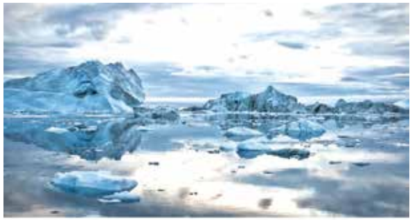
The team, comprising 68 scientists from 41 research institutions, combined seismic recordings from around the world, field measurements, satellite imagery and computer simulations for their analysis.

"Our findings highlight how climate change is causing cascading, hazard-