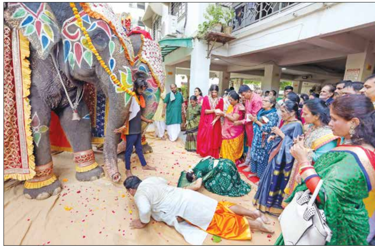
Devotees perform ritual before of elephants during the immersion of a Lord Ganesha idol at the end of the Ganesh Chaturthi festival in Ahmedabad on Friday.