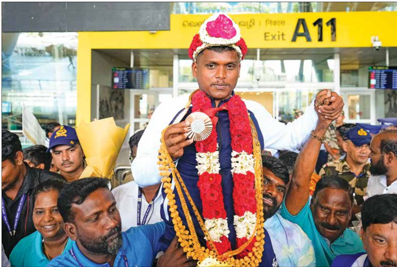
Paris Paralympics bronze medallist Mariyappan Thangavelu being welcomed upon his arrival at Chennai Airport on Friday.