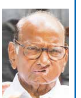
-Sharad Pawar, President, NCP (SP)

"The long fight has ended with the victory of truth. Kejriwal's bail reaffirmed the feeling that the conspiracy to vanquish someone through illegitimate means will never succeed in a democratic country."