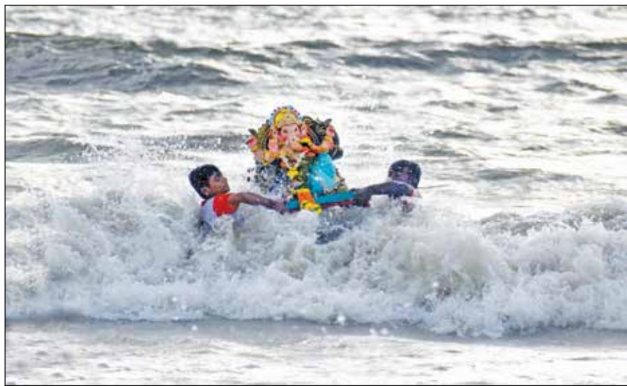
Devotees immerse an idol of Lord Ganesha in the Arabian Sea at Juhu Chowpati in Mumbai on Friday.