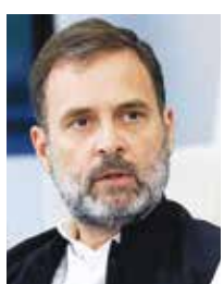
- Rahul Gandhi, Leader of Opposition

"If this arrogant government would listen to the people they would understand that a simplified GST with a single tax rate would solve the problems of lakhs of businesses."