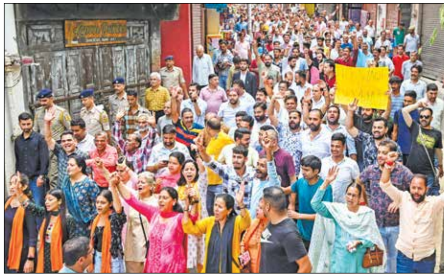
Protestors demanding the demolition of a mosque allegedly built on encroached land in Mandi, Himachal Pradesh on Friday.