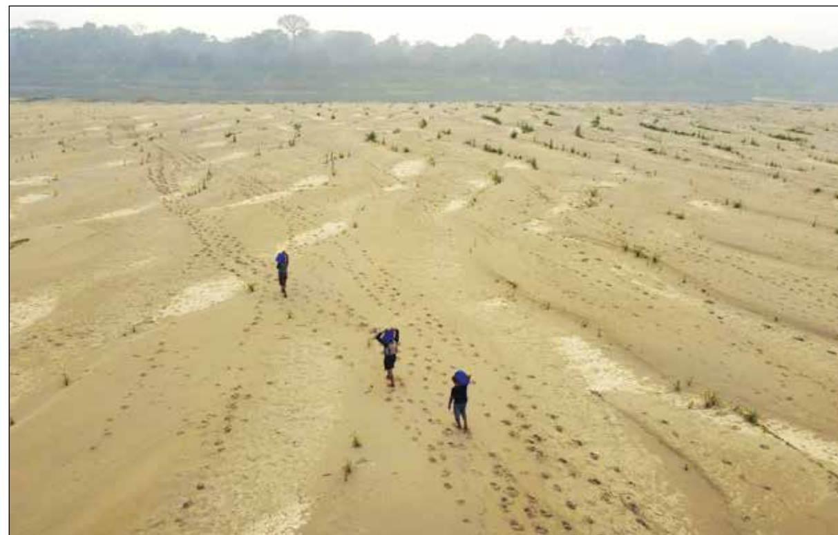
Residents transport drinking water from Humaita to the Paraizinho community, along the dry Madeira River, a tributary of the Amazon River during the dry season in Amazonas state in Brazil.