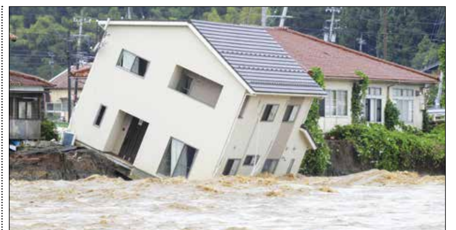
A house leans as a swollen river undermines the ground in Suzu in Japan.