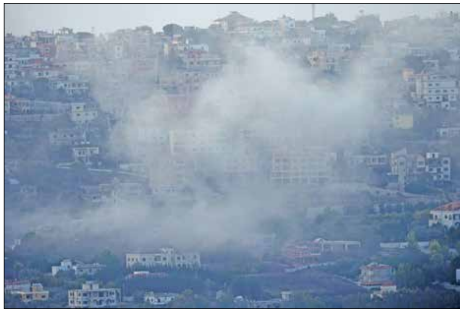
Smoke rises from an Israeli airstrike on Khiam village, as seen from Marjayoun town in southern Lebanon.