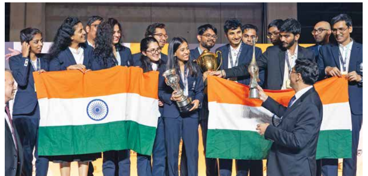
Indian teams at the presentation ceremony of the 45th Chess Olympiad in Budapest on Sunday.

"I don't have to give them a lot of advice as these guys are professionals, they know what to do. Basically it was