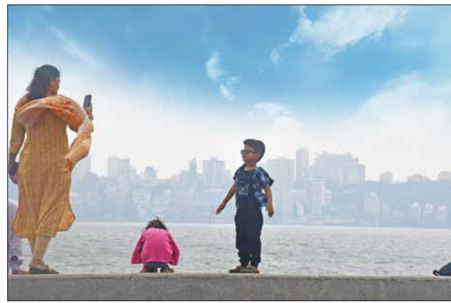
Evening walkers at Marine Drive on Monday.

The school's chairman and secretary have not been apprehended yet.