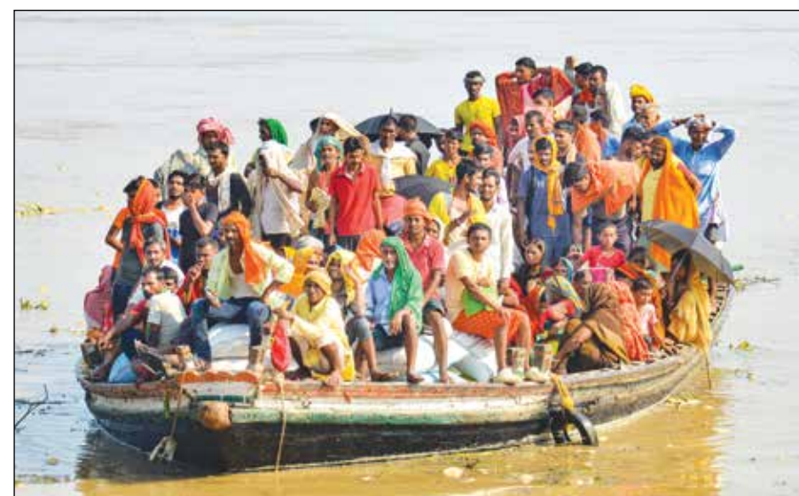
People from Nakta Diyara area arrive on boats to reach safe places after rise in the water level of Ganga river in Patna on Monday.

The programme has significantly impacted malaria and mosquito-borne disease control in India, reaching 2.7 million households across 39 districts, including 3,000 slums and 10,000 villages, she said.