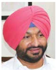
Ravneet Singh Bittu, Union Minister

“Rahul Gandhi himself goes to Gurudwara Darbar Sahib so many times. Who stops him? Therefore, this is not a matter of the party, it is above the party.”