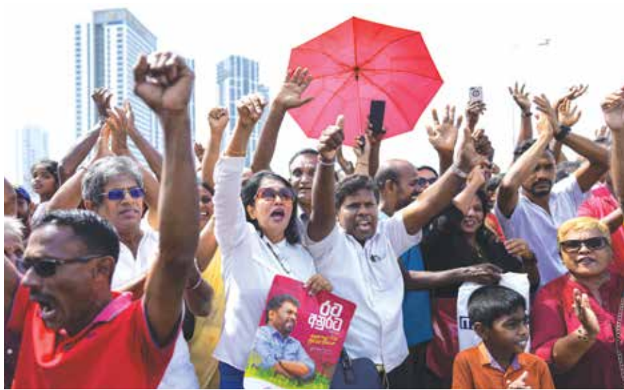
Supporters of Marxist lawmaker Anura Kumara Dissanayake cheer outside the president's office as he arrives to be sworn in as Sri Lanka's 10th president in Colombo, Sri Lanka on Monday.

Dissanayake, the leader of the Marxist Janatha Vimukthi Peramuna par-