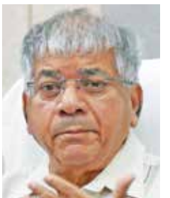
Prakash Ambedkar, Chief, Vanchit Bahujan Aghadi

"If reservations are being treated as development, then there is a developed class and an undeveloped class. And if there is an undeveloped class in the country, what is the government doing to bring it on par with others?"