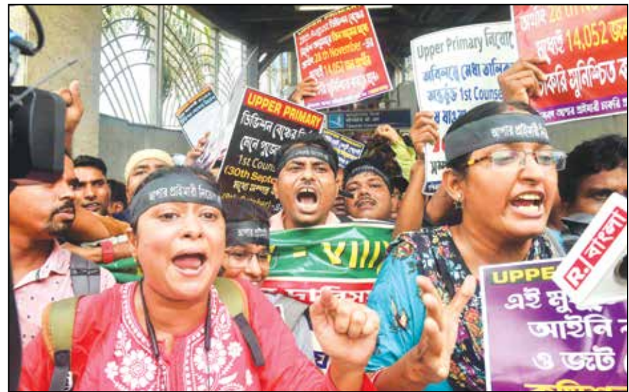
Upper Primary teachers' job candidates raise slogans during their demonstration, in Kolkata on Monday.