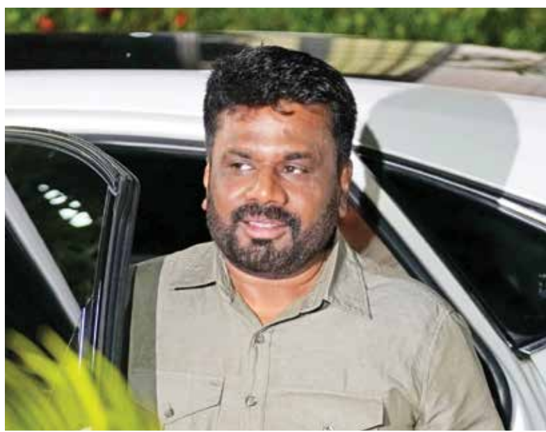
Anura Kumara Disanayak

The leftist A.K. Disanayake's victory in Sri Lanka adds a new dimension to the shift in South Asian geopolitics and is likely to expand China's foothold in the region.