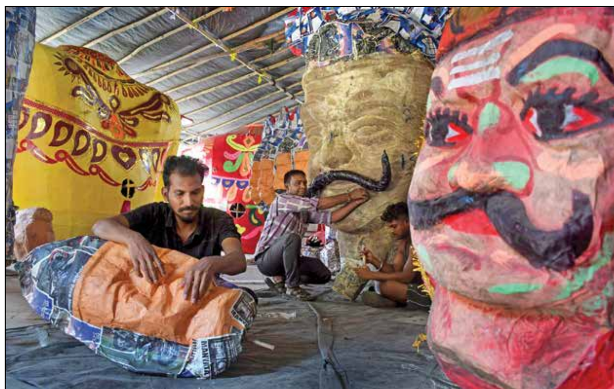
Artists prepare effigies of the demon king Ravana for the upcoming Dussehra festival in Nagpur on Monday.