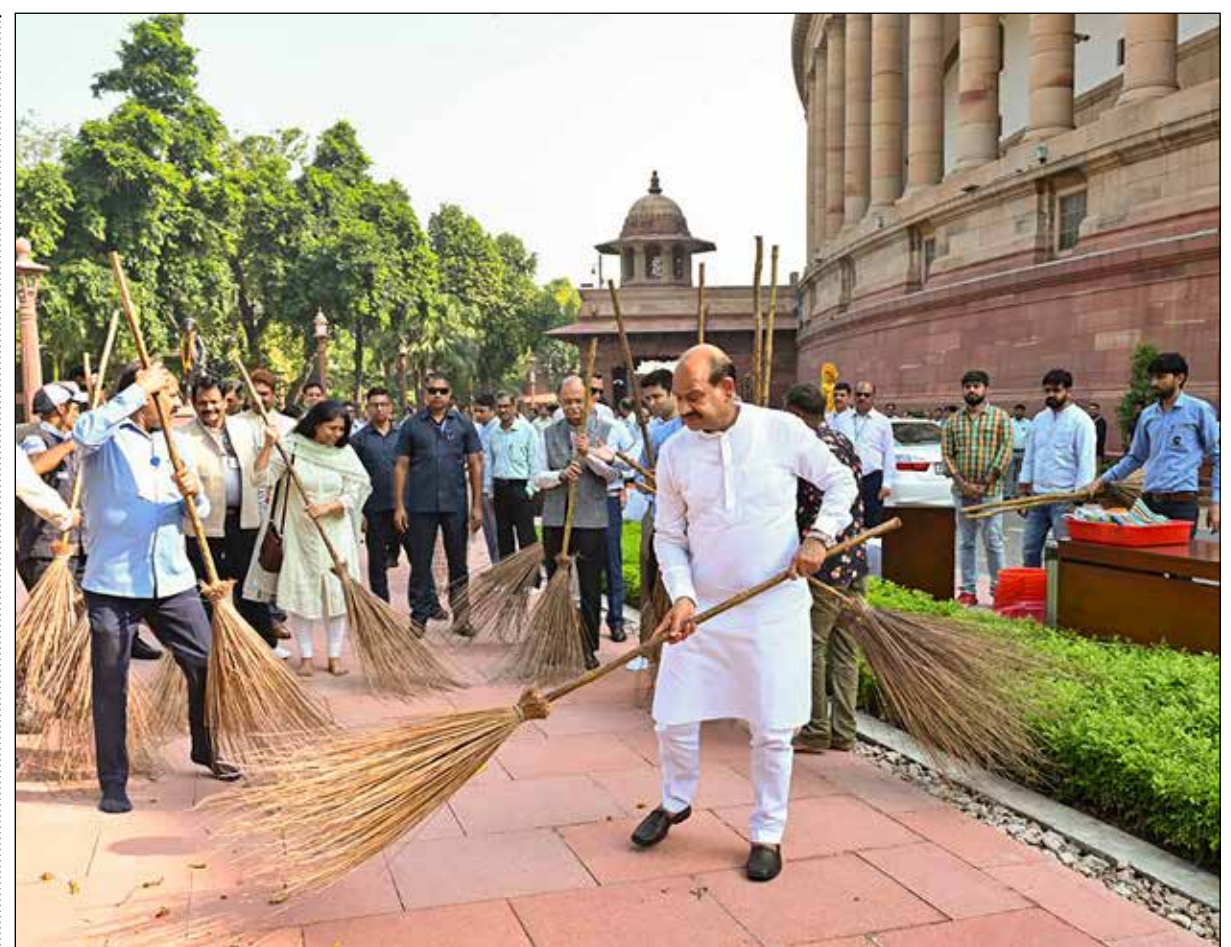
Lok Sabha Speaker Om Birla participates in a cleanliness drive on the occasion of Gandhi Jayanti at Parliament House complex in New Delhi on Wednesday.

Traditionally, the town, with about 45,000 residents, had to rely on deep borewells for its water needs. The project, done in collaboration with Boson Whitewater, a water utility company that converts STP-treated water into potable water, and Bengaluru-based Biome Environmental Trust, an initiative that facilitates and fosters environmentally and socially responsible practice, including rainwater harvesting, is managed through aquifer recharge.