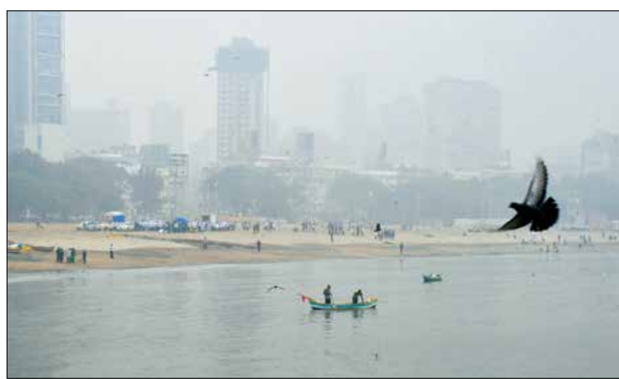
Haze engulfs the city skyline in Mumbai on Wednesday.