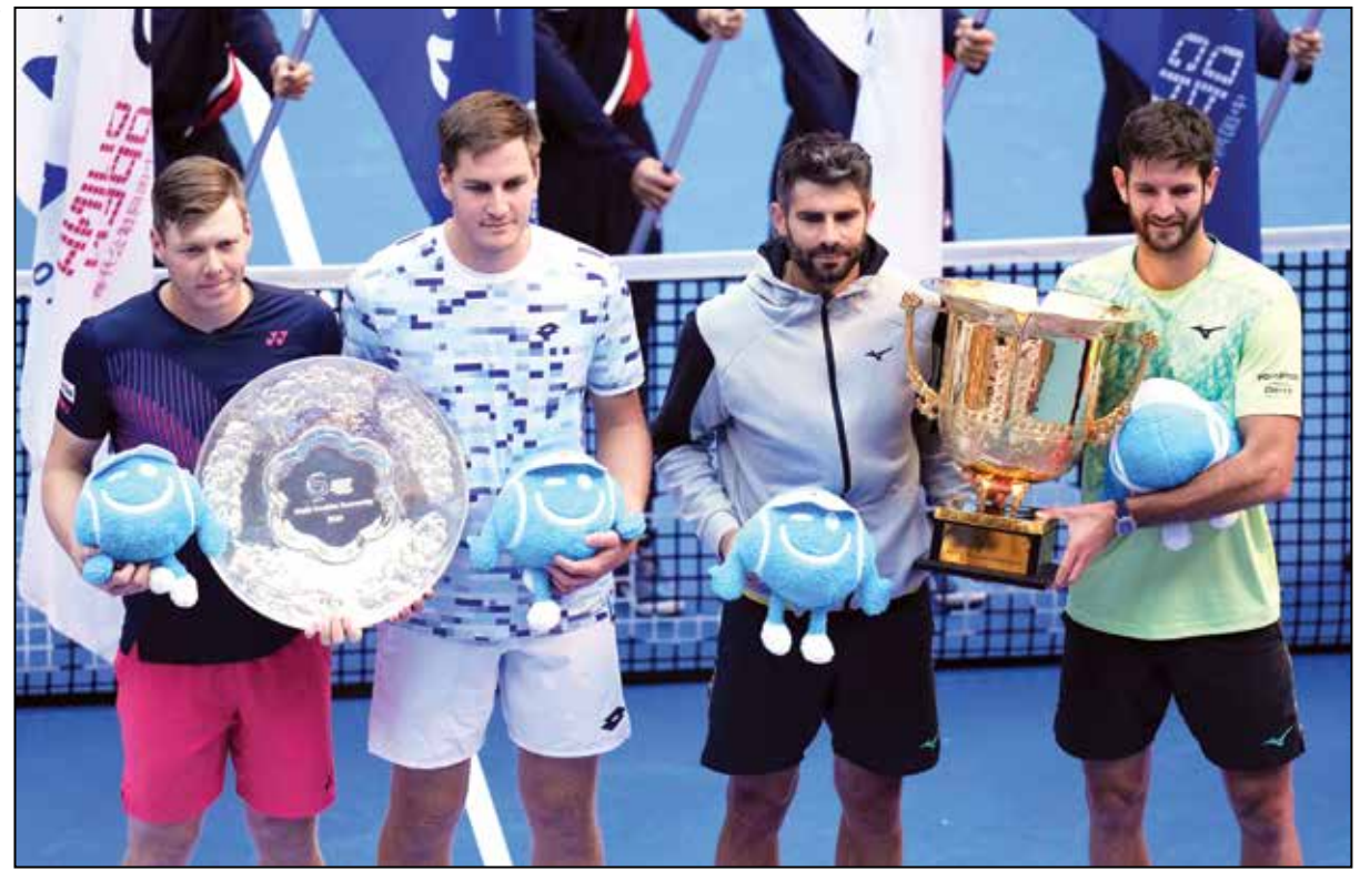
Simone Bolelli (second from right) and Fabio Fognini (right) of Italy holds their trophy after winning their men's doubles finals match against Harri Heliövaara of Finland (left) and Henry Patten (second from left) of Britain at the China Open tennis tournament, National Tennis Center in Beijing on Wednesday.