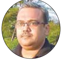
By Abhijit Mulye

Maharashtra has significant potential for renewable energy owing to its plentiful sunshine, large land mass, and proximity to coastal breezes. To reduce its dependence on fossil fuels, the state is actively pursuing various green energy sources, like solar, wind, biomass, and hydropower.