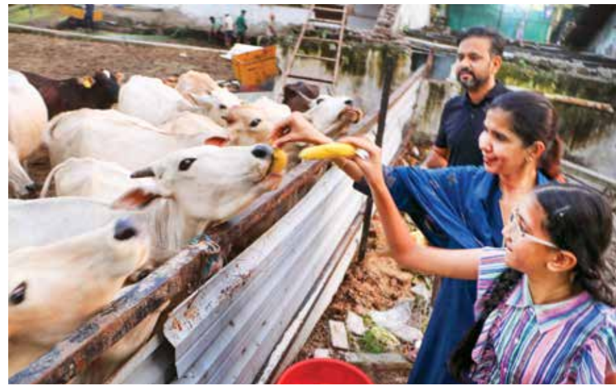
People feed cows after the Maharashtra government on Monday designated the indigenous cow as 'Rajmata-Gaumata', in Nagpur