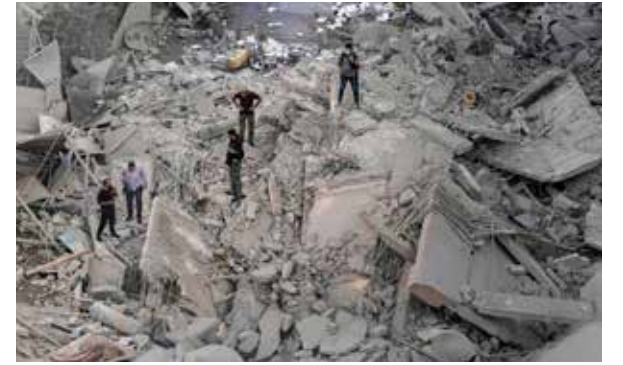
Smoke rises from the site of an Israeli airstrike in Dahiyeh, Beirut, Lebanon on Wednesday.