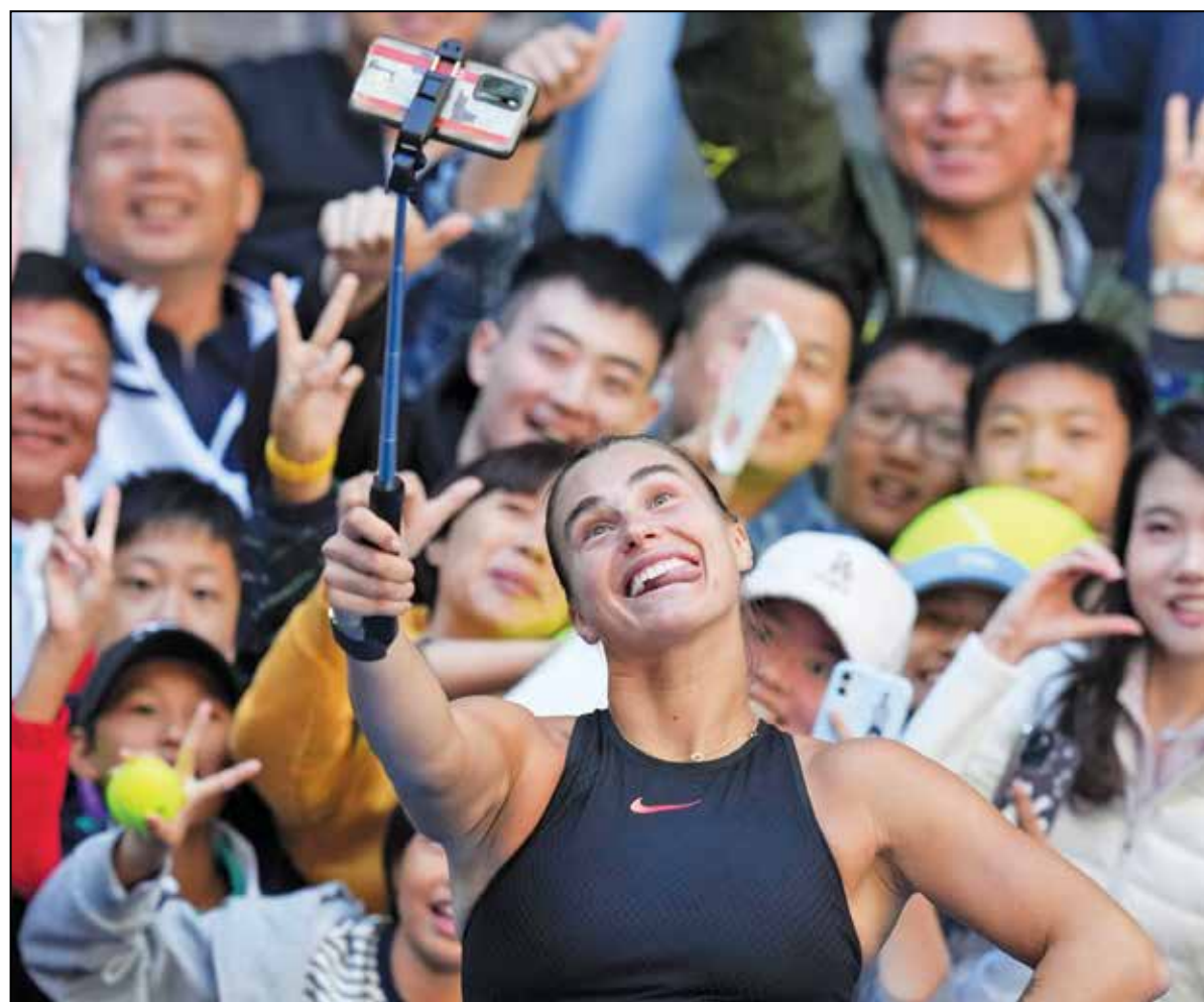
Aryna Sabalenka of Belarus takes a selfie with fans after winning against Madison Keys of the United States during their women's singles match of the China Open tennis tournament.