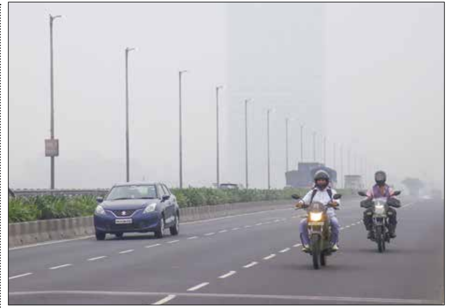
People commute on Airoli-Mulund bridge amid smog in Navi Mumbai on Wednesday morning.

According to a recent report from the Union Ministry of Drinking Water and Sanitation, Madhya Pradesh ranks third in establishing biogas plants in villages. The state has 104 biogas plants in various villages, with the highest 24 in Betul, 13 in Balaghat, and 12 in Singrauli.