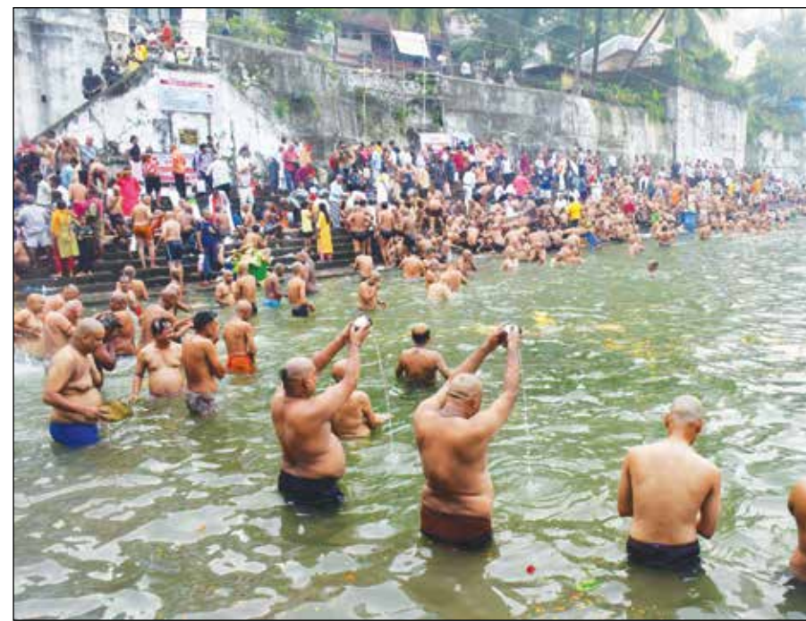
Devotees take a dip in the Banganga Tank on 'Sarvapitri Amavasya', marking the end of the Pitr Paksha, in Mumbai, on Wednesday.

The actor has a licensed revolver of Webley company and the bullet hit him near his left knee, the officer said. The revolver, which is an old one, was not locked and got misfired, he said. The actor's revolver has been seized by police officials for further probe. After the incident, Govinda issued a statement informing his fans he is doing better.