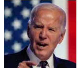
al security adviser Jake Sullivan said.

There was little criticism that Israel may have provoked Iran's assault. "Obviously, this is a significant escalation by Iran," nation-