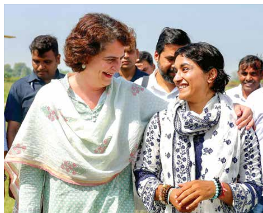
Congress leader Priyanka Gandhi Vadra with party candidate Vinesh Phogat during the party's Haryana Vijay Sankalp Jansabha ahead of Assembly polls in Julana, Haryana on Wednesday.

The party was floated exactly two years after Kishor had embarked on a more than 3,000-km-long 'padayatra' of the state, from Champaran where Mahatma Gandhi had launched the first Satyagraha in the country, in a bid to mobilise the people for a "new political alternative" that could cure Bihar of its chronic backwardness. -PTI