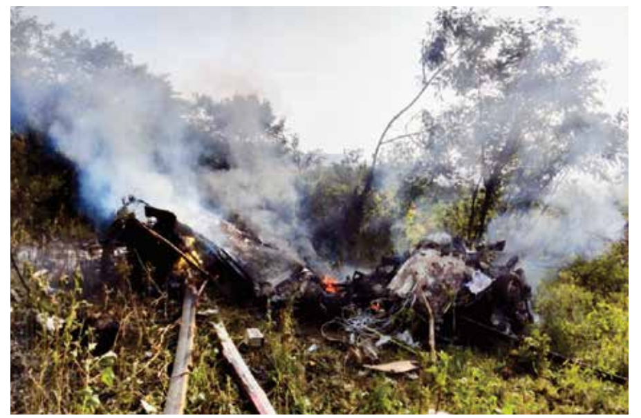
Wreckage of a helicopter after it crashed at Bavdhan area in Pune district