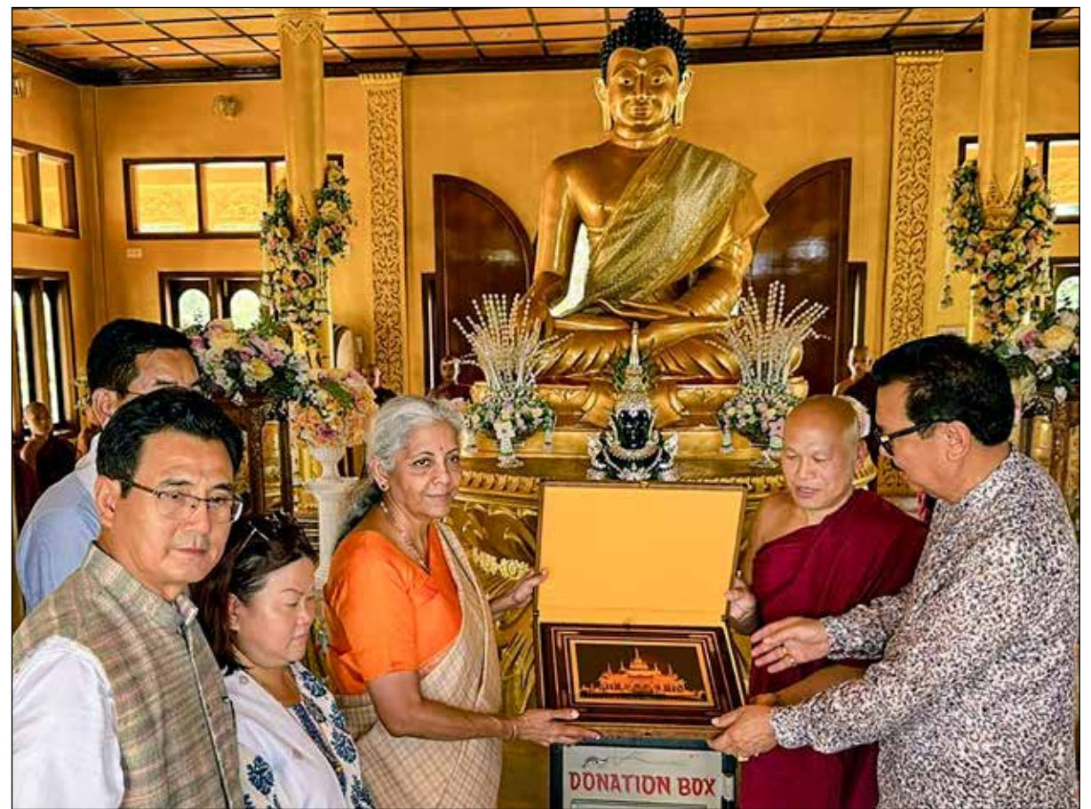
Union Finance Minister Nirmala Sitharaman during a visit to the Golden Pagoda temple in Namsai, Arunachal Pradesh.

seamless for both customers and staff. "Though the legal entities and Air Operator Certificates will become one on 12 November, the Vistara experience will remain. "Vistara aircraft, crew