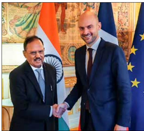
NSA Ajit Doval with Minister of Foreign Affairs of France Jean-Noel Barrot during a meeting

"Blinken noted Prime Minister Modi's August visit to Kyiv and reiterated the importance of a just and lasting peace for Ukraine," he said and added that plans to expand collaboration on clean energy initiatives to address the global climate crisis were also discussed.