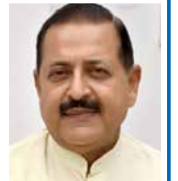
Jitendra Singh, Union Minister

"Prime Minister Narendra Modi's 'Swachhata' call from Red Fort turned into a mass campaign, which motivated a spontaneous voluntary effort to maintain cleanliness and brought about a behavioural revolution among people across the country."