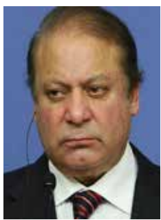
Nawaz Sharif, former PM, Pakistan

"His (Imran Khan) performance was zero and despite his party's government in Khyber Pakhtunkwa, they fail to meet the expectations of the people. Their only focus is on protests and street riots."