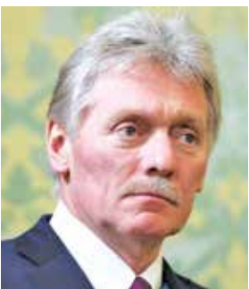
Dmitry Peskov, Spokesman, Kremlin

Iran is our important partner. We are developing our trade and economic relations. We are developing our cooperation and dialogue in all possible areas, including the most sensitive ones, and will continue to do so in the interests of the peoples of our two countries.