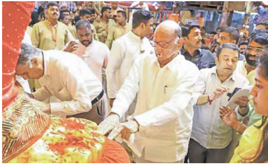
Sharad Pawar visited the famous Lalbaug Cha Raja Ganesh pandal after 30 years on Monday.

Mumbai: On Monday morning while most of the media channels were busy reporting Deputy Chief Minister Ajit Pawar's absence during Union Home Minister Amit Shah's Mumbai tour, his uncle Sharad Pawar made headlines by visiting the famous Lalbaug Cha Raja Ganesh pandal in central Mumbai ahead of Shah's scheduled visit there. The visit led to speculations whether Pawar Sr wants to shade his atheist image before elections.