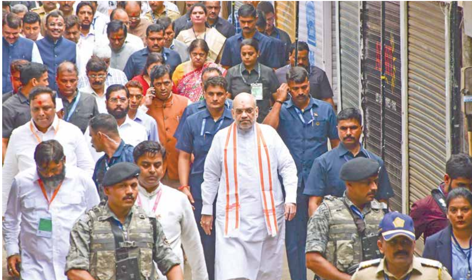
Union Home Minister Amit Shah along with Maharashtra CM Eknath Shinde and Maharashtra DCM Devendra Fadnis returns after offering prayer at Lalbaugcha Raja during the Ganesh Festival in Mumbai on Monday.

The first and foremost thing Shah told the leaders was to avoid public spat and pose a united face in public. Recently several of the leaders from the Shiv Sena and the NCP were seen openly making derogatory statements against each other and even against