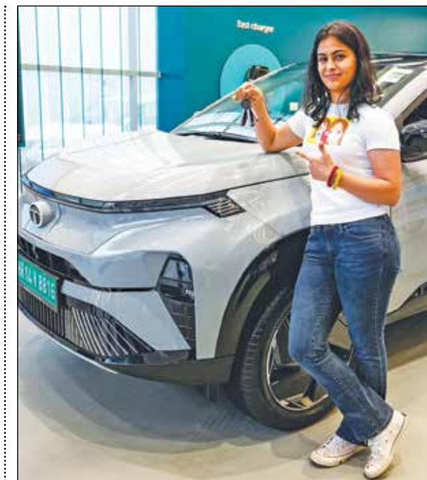
Paris Olympics bronze medallist shooter Manu Bhaker poses with the Tata Motors car gifted to her during a felicitation ceremony at Tata Motors showroom in Gurugram on Sunday.

The lead managers for the IPO include Kotak Mahindra Capital Company Ltd, BofA Securities India Ltd, Axis Capital Ltd, Goldman Sachs (India) Securities Private Ltd, SBI Capital Markets Ltd, JM Financial Ltd, and IIFL Securities Ltd. LKP Research has issued a report on Bajaj Housing Finance Ltd, recommending a "Buy" rating for the IPO in its research report dated September 04, 2024.