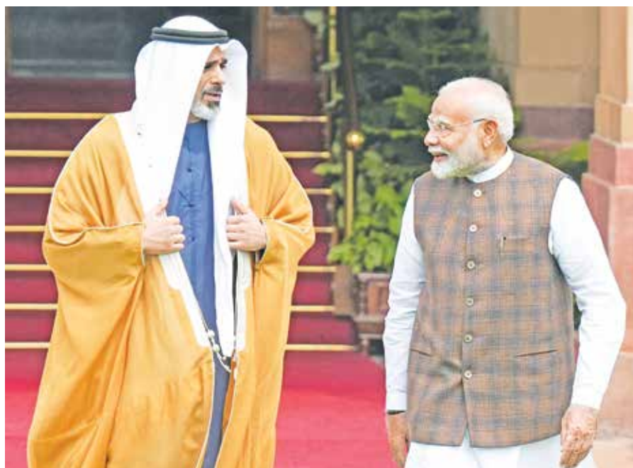
Prime Minister Narendra Modi with Abu Dhabi's Crown Prince Sheikh Khalid bin Mohamed bin Zayed Al Nahyan before meeting, at the Hyderabad House in New Delhi on Monday.

The fourth pact is a production concession agreement for Abu Dhabi onshore block-one between Urja Bharat and ADNOC. A sep-