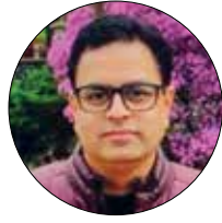
By Sumant Vidwans

The 2024 Forum on China-Africa Cooperation (FOCAC) summit in Beijing from September 4 to 6 highlighted China's deepening role in Africa's economic development. Themed "Joining Hands to Advance Modernization and Build a High-Level China-Africa Community with a Shared Future,"