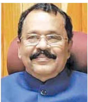
P.S. Sreedharan Pillai, Governor, Goa

I spoke to a senior priest. I told him that the percentage of Catholic community members in Goa has come down to 25 per cent while the Islamic community members have gone up to 12 per cent from the earlier three per cent.