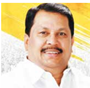
Vijay Wadetiwar, Leader of Opposition

Since the Union government has been formed with the support of the TDP, (Union Agriculture Minister) Shivraj Singh Chouhan went to Andhra Pradesh. When will he come to Maharashtra? Why has no Central delegation come to Maharashtra to assess rain damage?