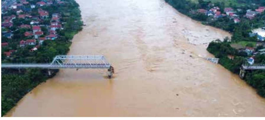
A bridge collapse due to floods triggered by typhoon Yagi in Phu Tho province, Vietnam on Monday.

Hanoi: A bridge collapsed and a bus was swept away by flooding Monday as more rain fell on northern Vietnam from a former typhoon that has caused at least 59 deaths in the Southeast Asian country, state media reported.