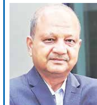
Vinod Aggarwal, President, SIAM

"The Indian automotive industry has crossed a landmark figure of Rs 20 lakh crore in FY24. We are contributing almost 14-15 per cent of the total GST collected in the country. The auto industry will contribute more and more to the GDP of the country from the current level of around 6.8 per cent."