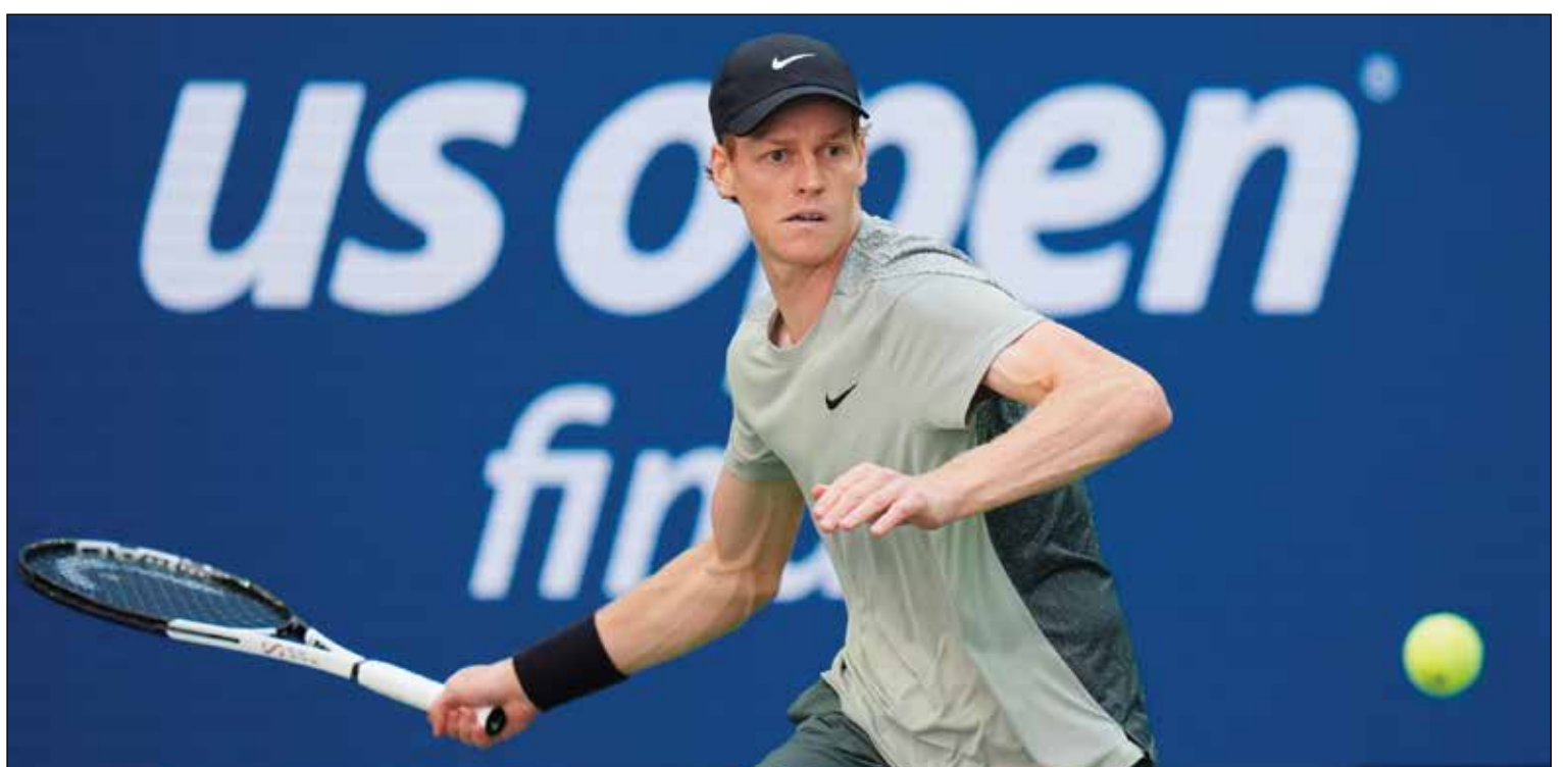
Jannik Sinner of Italy returns a shot to Taylor Fritz of the United States during the men's singles final of the U.S. Open tennis championships in New York on Sunday. Sinner won the tournament.

The Indians also went on to break multiple deaf world records and championship records in the event.