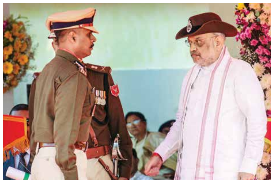
Union Home Minister Amit Shah during the 61st Raising Day of SSB near Siliguri on Friday.