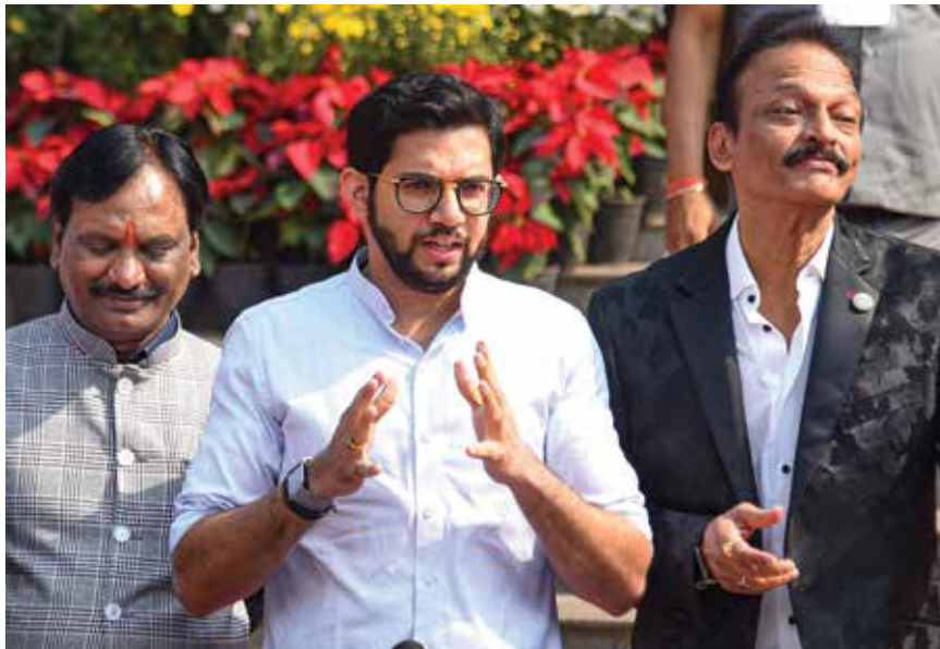
Chief Minister Devendra Fadnavis on Friday announced to transfer Beed Superintendent of Police. The CM said the police were found to be lax.