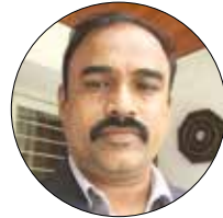
By Madhukar Mazire

Sweden holds combined municipal, county, and parliamentary elections every four years. Voters can choose to vote for a party, candidate, or both. Early voting is available nationwide for those unable to vote at their designated polling station. Non-Swedish residents living in Sweden for over three years can vote in municipal and county elections. Elections are held on the second Sunday of September, with the next one on September 13, 2026, from 08:00 to 20:00. Early voting starts 18 days prior, on August 24. To gain representation, parties must secure at least 4% of the national vote or 12% in a single constituency.