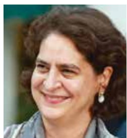
Priyanka Gandhi, MP, Congress

"This government is scared of a debate on the Adani issue, they are scared of any debate. They know their real feelings for Ambedkar ji are out in the open and therefore they are afraid of the Opposition because we are raising this issue."