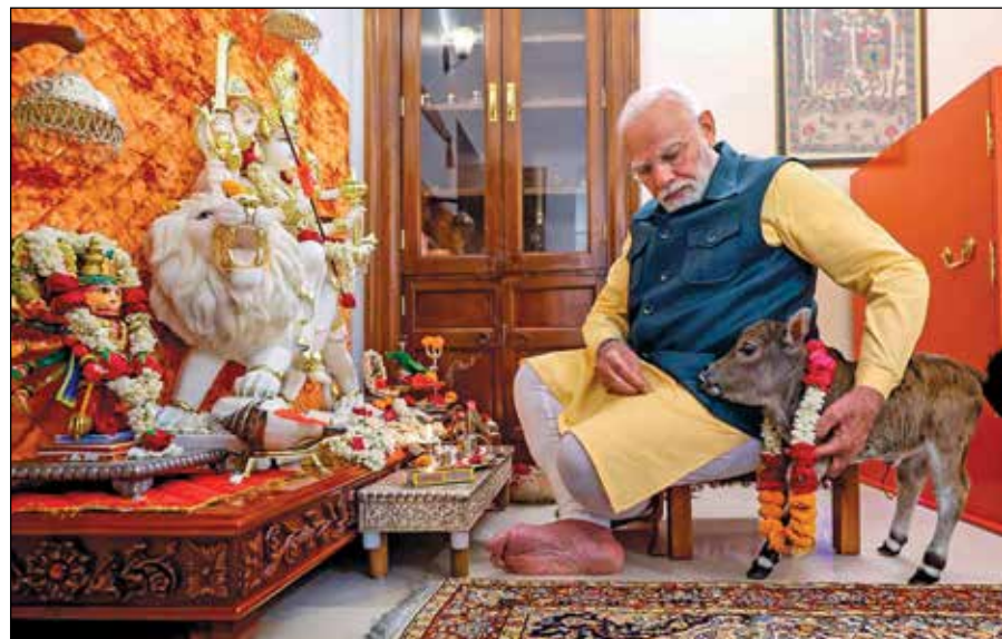
Prime Minister Narendra Modi with 'Deepjyoti', a calf who was born at the Prime Minister's official residence in New Delhi.

She urged them to come inside for the meeting and not get drenched in the rain, reiterating her request to end the deadlock.