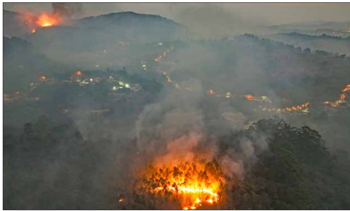
A wildfire consumes a rural area during the dry season in Varzea Paulista, Sao Paulo state, Brazil on Friday.