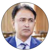
By Kaswar Klasra