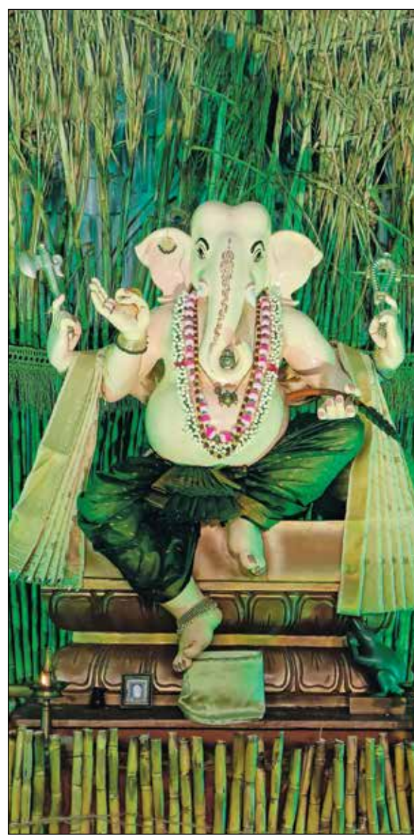
Om Shanti Mitra Mandal in Shanti Nagar, Mira road decorated the Ganesh Idol with 2000 kg of sugarcane.