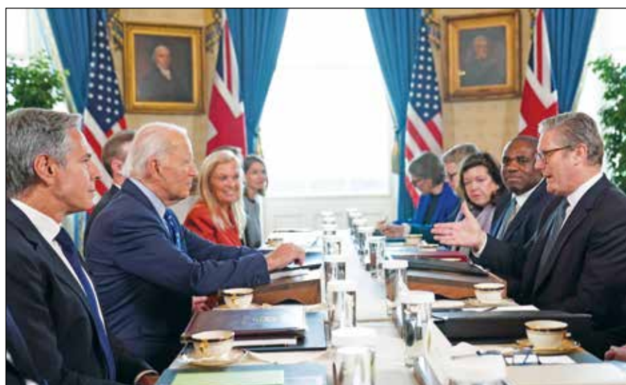
Britain's Prime Minister Keir Starmer (right) during a meeting with US President Joe Biden (centre left) in the Blue Room at the White House in Washington on Friday.

The Russian authorities kept a close watch on the discussion between Biden and Starmer.