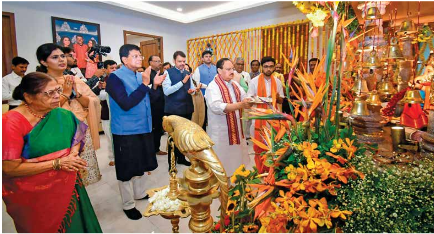
BJP National President JP Nadda, Union Minister Piyush Goyal, Deputy Chief Minister Devendra Fadnavis and others during Ganesh Chaturthi festival at Fadnavis' residence in Mumbai on Saturday.