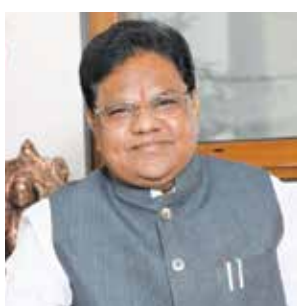
Tanaji Sawant, Minister for Health

I am a hardcore Shiv Sainik. I would never get along with Nationalist Congress Party (NCP) leaders. Even if we sit next to each other in the Cabinet, I feel like vomiting after coming out."