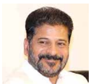
A Revanth Reddy, Chief Minister, Telangana

"I am a firm believer of the judicial process. I unconditionally express my regret for the statements reflected in the press reports. The remarks attributed to me in such reports have been taken out of context. I have unconditional respect and highest regard for the Judiciary and its independence."