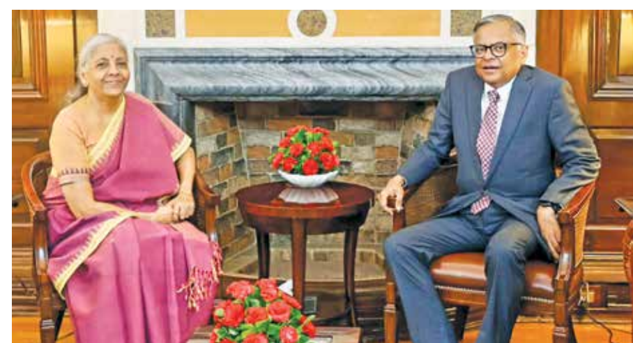
Union Finance Minister Nirmala Sitharaman with Tata Sons Chairman N. Chandrasekaran during a meeting in New Delhi on Friday.

"India's GDP growth expectedly slowed down in Q1 FY2025 relative to Q4 FY2024 (to a five-quarter low of 6.7 per cent from 7.8 per cent), even as the GVA growth surprisingly accelerated between these quarters (to 6.8 per cent from 6.3 per cent).