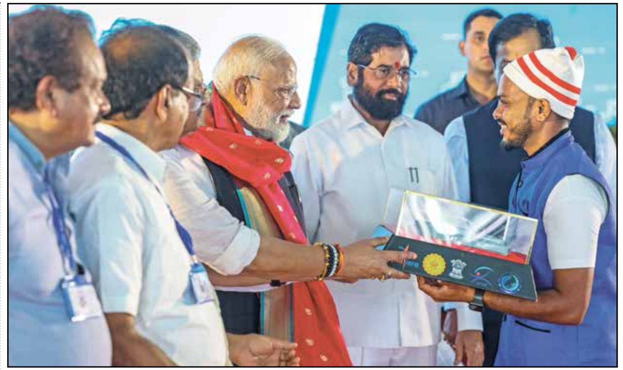
Prime Minister Narendra Modi during the inauguration and foundation stone laying ceremony of various developmental projects, in Palghar district on Friday.

The city unit of the BJP and members of some Hindu organisations held a press conference on Thursday evening and demanded strict punishment against the accused. -PTI