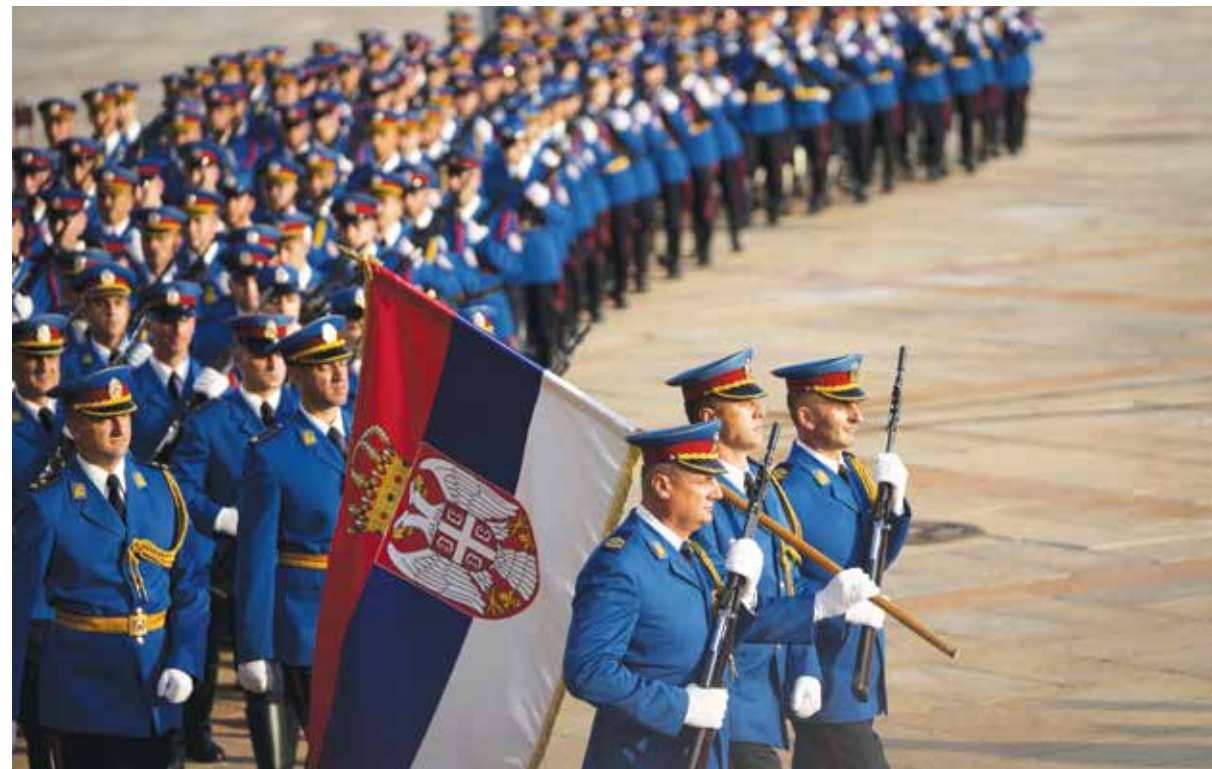
Serbian honor guard soldiers arrive before the welcoming ceremony for French President Emmanuel Macron in Belgrade, Serbia on Thursday. Macron aims sale of 12 Rafale fighter jets.

Interior Minister Nancy Faeser announced a plan to tighten existing knife laws, according to German news agency dpa. -AP