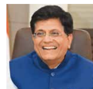
Piyush Goyal, Union Minister for Commerce and Industry

"An Indian company buying products from another Indian company will actually help create that ecosystem, help insulate and secure itself in the long run from any disruptions. Two wars, the Red Sea crisis, Mpox (Monkeypox), a new pandemic hovering around, we have enough to be worried about the world".