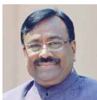
Sudhir Mungantiwar, Minister for Cultural Affairs

"The operators of touring talkies and tent cinema operators should show movies based on historical events to take the legacies of prominent figures to remote areas. They can also show some advertisements related to state government schemes. Such advertisements could provide them with another source of income."