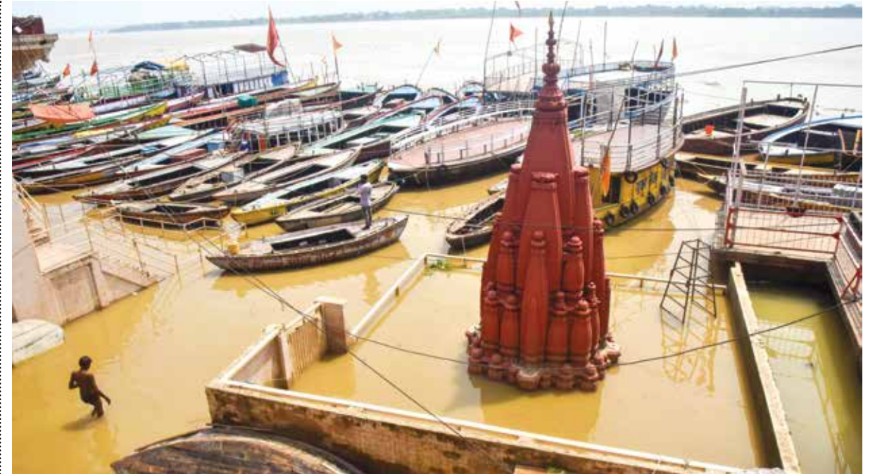
A submerged temple following the rise of River Ganga's water level after rains, at Dashashwamedh Ghat in Varanasi on Friday. -Pic-PTI

To rid Kshipra of pollution before the Simhastha, the Indore administration has prepared a blueprint for a Rs 600-crore rejuvenation plan. -PTI