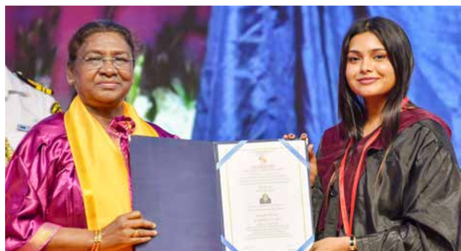
President Droupadi Murmu during the 21st convocation of Symbiosis International (Deemed University) in Pune on Tuesday.

After the sexual abuse of a toddler in Badlapur and collapse of Chhatrapati Shivaji Maharaj statue has