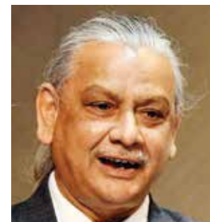
Michael Debabrata Patra , Deputy Governor, Reserve Bank of India

"Going forward, boosted by rising incomes, households will likely build back their financial assets. This process has already begun. Households' financial assets have increased from 10.6 per cent of GDP during 2011-17 to 11.5 per cent during 2017-23 (excluding the pandemic year). Accordingly, households will remain the top net lenders to the rest of the economy in the coming decades."