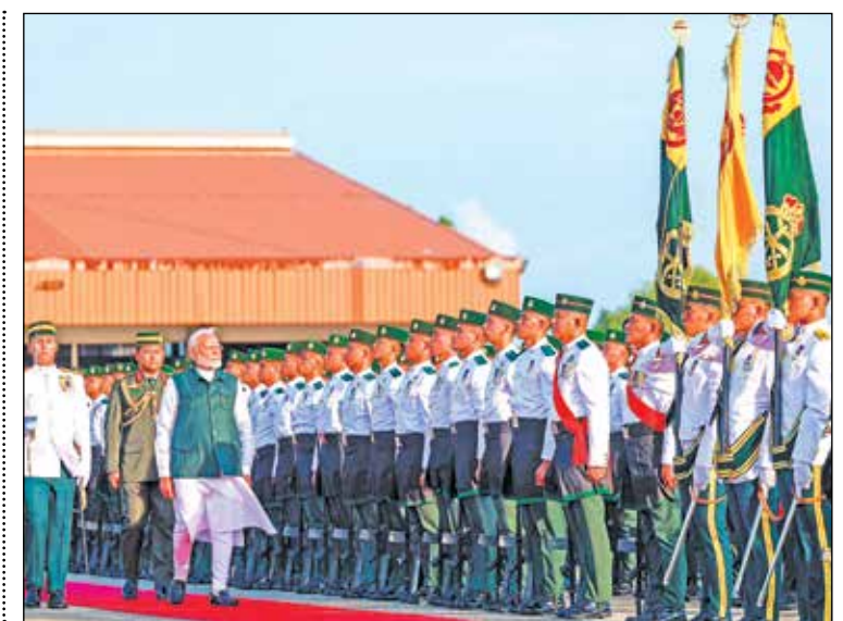
Prime Minister Narendra Modi receives customary Guard of Honour upon his arrival, in Brunei Darussalam.