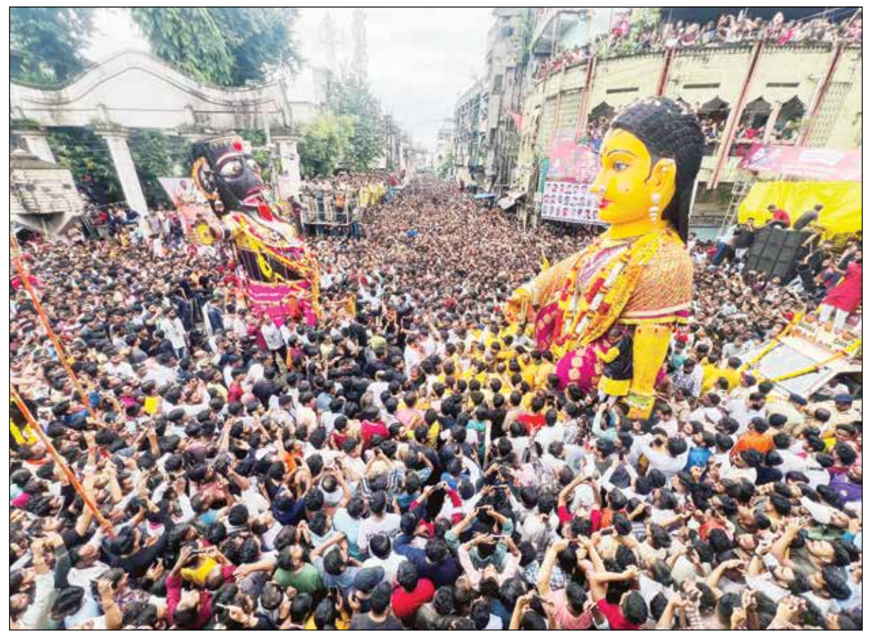
Devotees take part in the 'Kali' and 'Pili' Marbat festival procession, taken out on the second day of 'Pola', in Nagpur on Tuesday.