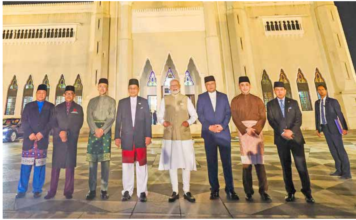
Prime Minister Narendra Modi during a visit to Omar Ali Saifuddin Mosque, in Bandar Seri Begawan, Brunei on Tuesday.