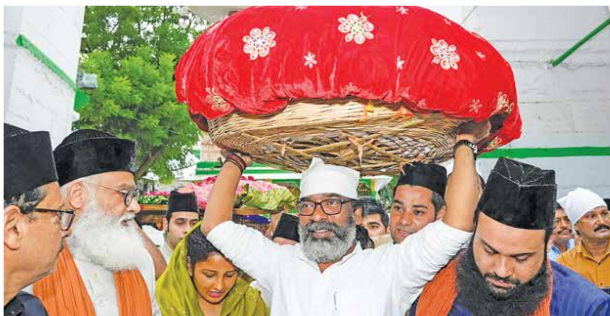
Jharkhand Chief Minister Hemant Soren with his wife and JMM leader Kalpana Soren carries a 'chadar' to pay their obeisance at Ajmer Sharif Dargah.