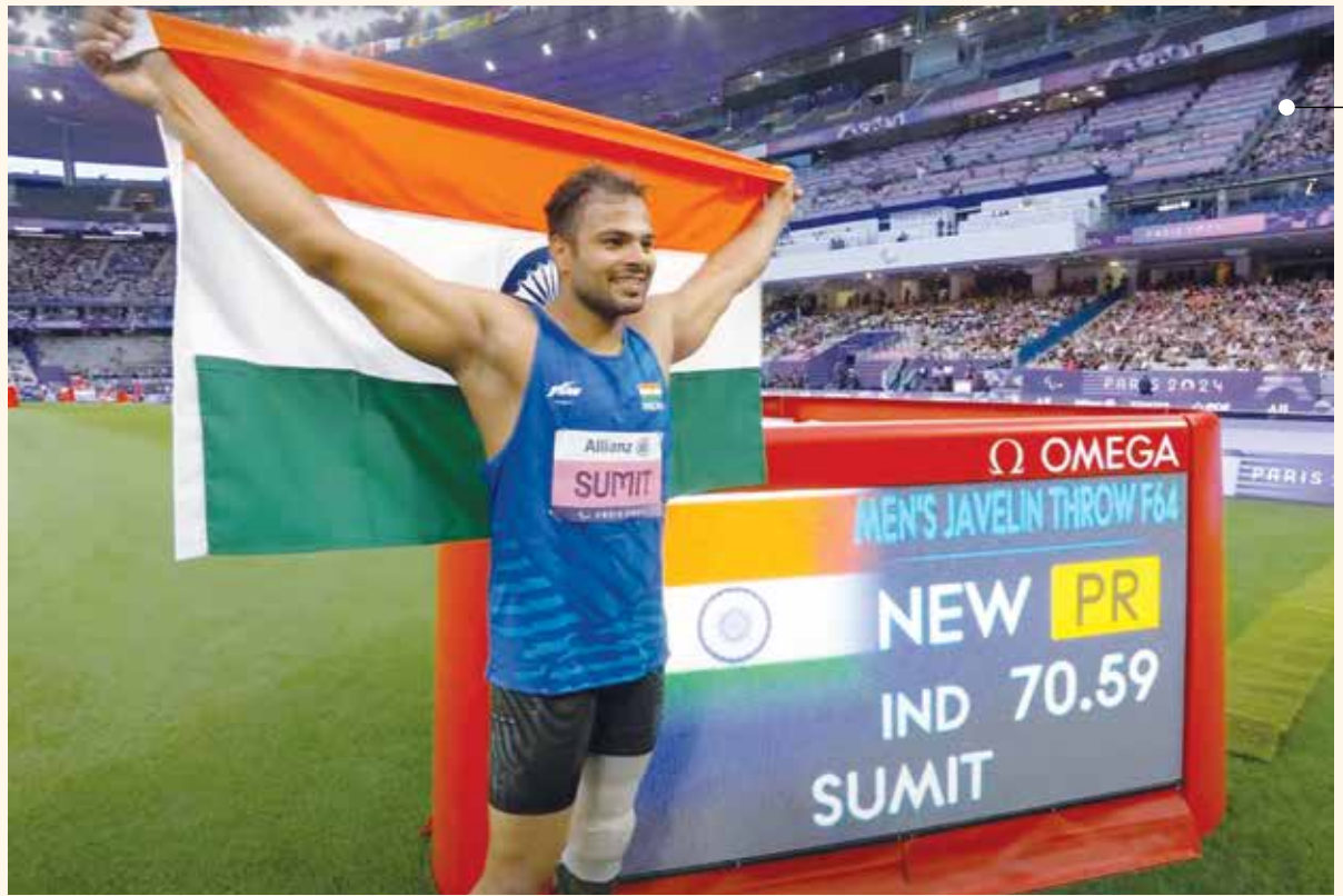
Sumit Antil poses for photographs after winning the gold medal in javelin throw F64 event in Paris Paralympics on Monday. Sumit secured gold with a 70.59 m throw.

I was not at 100 per cent. I had to take a painkiller before my throw, and even during training, I haven't been at my best. The first priority is to fix my back after we return to India because rest is crucial with the type of injury I have. With competitions so close, I haven't been able to rest properly and have constantly taken precautions to protect my back. I've been careful with every movement to avoid aggravating it further.