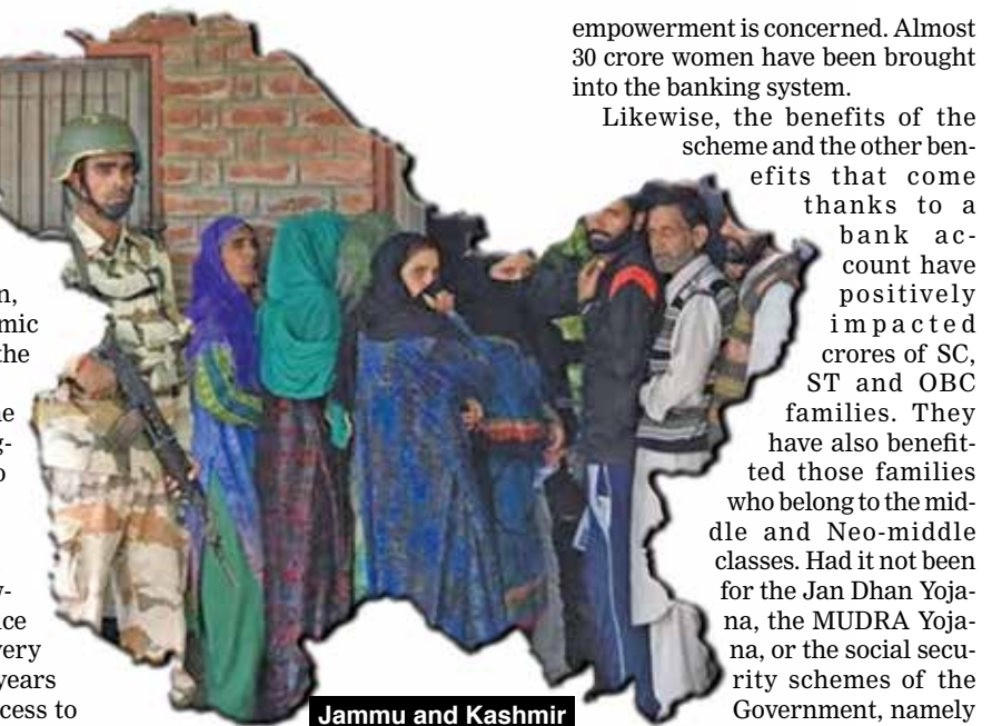
Jammu and Kashmir

The history of political alliances in Jammu and Kashmir has been a tale of convenience and contradiction, with old alliances being revived ahead of the 2024 election and new courses being adopted