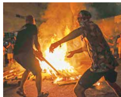
Demonstrators light a bonfire during a protest demanding a cease-fire deal and the immediate release of hostages held by Hamas in the Gaza Strip after the deaths of six hostages in the Palestinian territory, in Tel Aviv, Israel.

Israel has seen weekly protests in solidarity with the hostages since the start of the war. But over time, as Israelis have tried to return to a semblance of normalcy or have been preoccupied by fears of a regional war