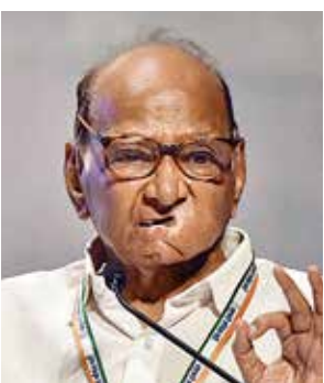
Sharad Pawar, President, NCP (SP)

"Upon receiving a book at any event, I generally open the wrapping to see it because I was once presented some books at an event. I did not open the wrapping but later saw that one of the books was on Golwalkar Guruji. After that incident, I decided that if a wrapped book is presented by someone, I will unwrap it before accepting it."