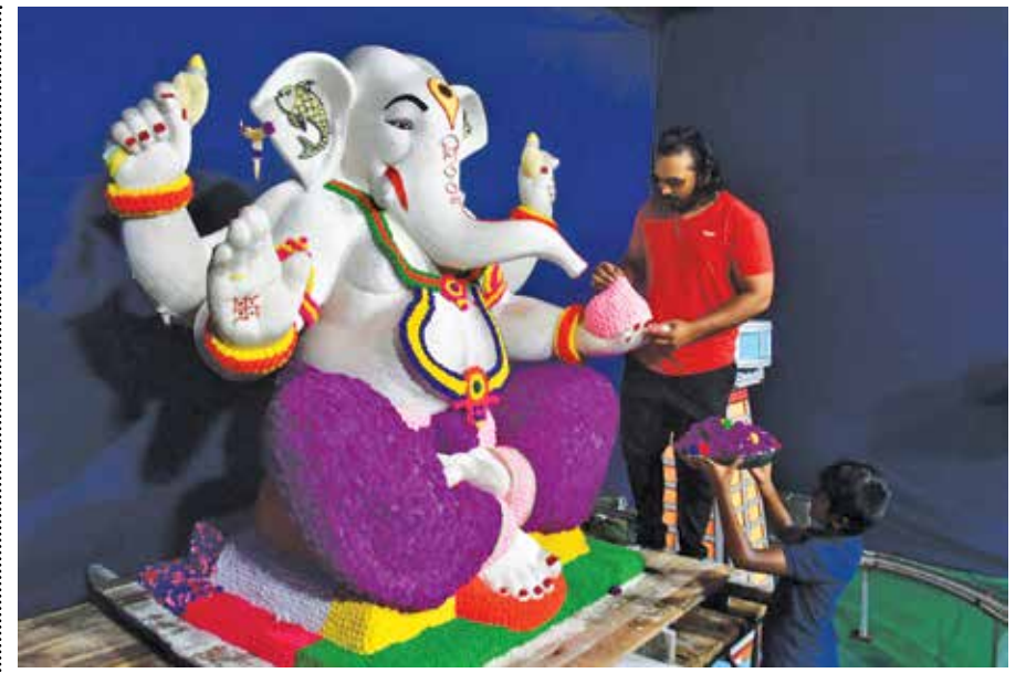
Artist busy to give final touch to Lord Ganesh Idol which make from Woolen Gonda Material called (Gonda) at Byculla Makba Chawl near "S" bridge, in Mumbai on Tuesday.

The project is expected to reduce the travel distance between Indore and Mumbai significantly, thereby enhancing trade and economic activities across the connected districts.