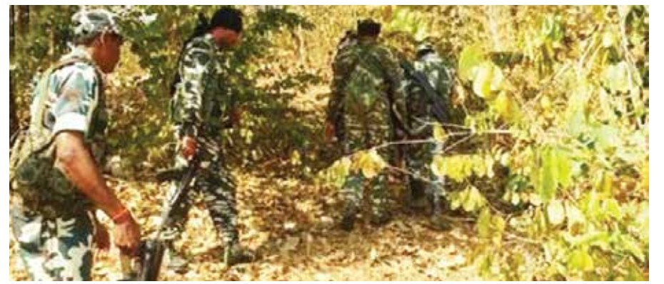
After the latest offensive, 153 Naxalites have been gunned down in separate encounters in the Bastar division, comprising seven districts -- Kanker, Kondagaon, Narayanpur, Bastar, Bijapur, Dantewada and Sukma

The exchange of fire between Naxalites and security personnel took place multiple times in forests near Lohagaon, Purangel and Andri villages under the Kirandul Police Station area (Dantewada district). After the guns fell silent, bodies of nine Naxalites, including six women -- all clad in 'uniform' -- were recovered from the spot, informed the senior IPS officer.