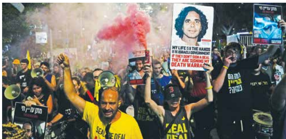
People attend a rally demanding a cease-fire deal and the immediate release of hostages held by Hamas in the Gaza Strip after the deaths of six hostages in the Palestinian territory in Tel Aviv, Israel on Monday.

Headed by Finance Minister Bezalel Smotrich and National Security Minister Itamar Ben-Gvir, they oppose any deal that ends the