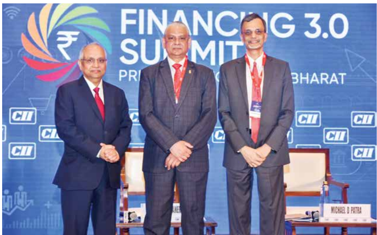
Chief Economic Advisor V. Anantha Nageswaran, right, RBI Deputy Governor Michael Patra, centre, and Confederation of Indian Industry (CII) Director General Chandrajit Banerjee during the CII Financing 3.0 Summit in Mumbai on Tuesday.

been holding an office of profit at the ICICI Bank, continuing to receive income from the bank to this very day. ICICI said it has not paid any salary or granted ESOPs to Buch after her retirement on October 31, 2013.