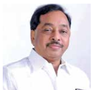
Narayan Rane, MP, BJP

"I am not a historian. But from whatever I have read, heard, and known from historian Babasaheb Purandare, "Shivaji Maharaj had looted Surat".