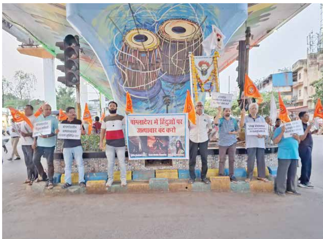
Hindu organisations protested against the violence in Bangladesh in Thane on Saturday.

The estimated cost of the project is Rs 12,200.10 crore, with equal equity from the Government of India and Government of Maharashtra as well as part-funding from bilateral agencies. Funds would also be raised through other financing methods such as by selling station naming and access rights for corporate, monetisation of assets, and value capture financing route, the official made it clear.