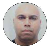
By Shoumojit Banerjee

(The writer is a student of Saint Xaviers College, Mumbai. The views are personal.)