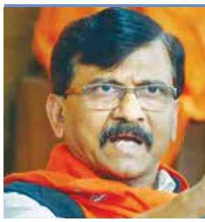
Sanjay Raut, MP, Shiv Sena (UBT)

"What is wrong with Uddhav Thackeray's demand? Thackeray is a former chief minister. His face is acceptable to everyone. He didn't speak about himself. If anyone has the courage, they should declare their CM face."