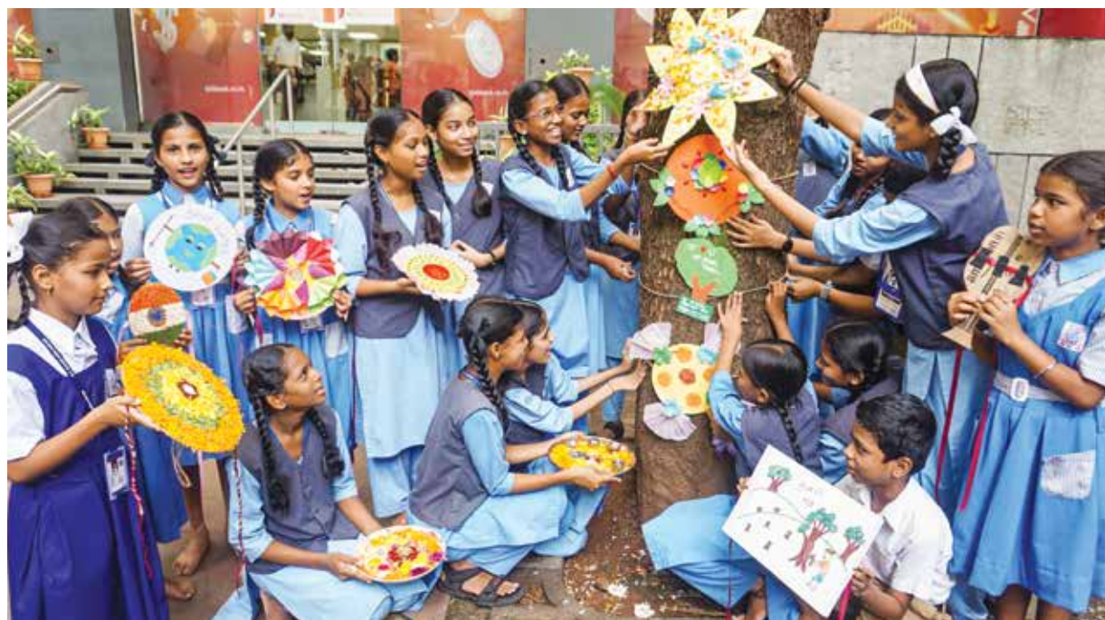
Students tie handmade 'rakhis' to a tree ahead of Raksha Bandhan festival, in Thane on Saturday.

The WHO's declaration of 2022 was revoked in May 2023. Since 2022, WHO has globally reported 99,176 cases and 208 deaths due to Monkeypox from 116 countries. - PTI