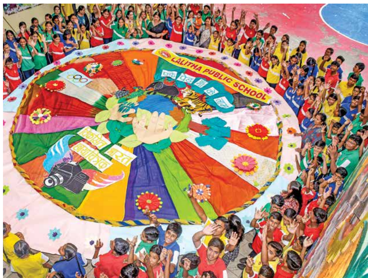
Students in Nagpur prepare a giant rakhhi on eve of Rakshabandhan.

also dealt in import-export business, fatally shot himself in his head on Friday night. He was a resident of Mazgaon area, also in south Mumbai, the official said.