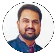
By Mangesh Kulkarni

Defence shares have generated substantial wealth for their investors over the past five years. The Indian government has been taking steps to encourage local defence production and reduce dependence on foreign imports. The Indian defence industry has achieved notable progress in developing advanced technologies and systems, including missile defence systems, fighter aircraft, submarines, and unmanned aerial vehicles. Both state-owned and private defence companies in India play a crucial role in the production of defence equipment and supplies.