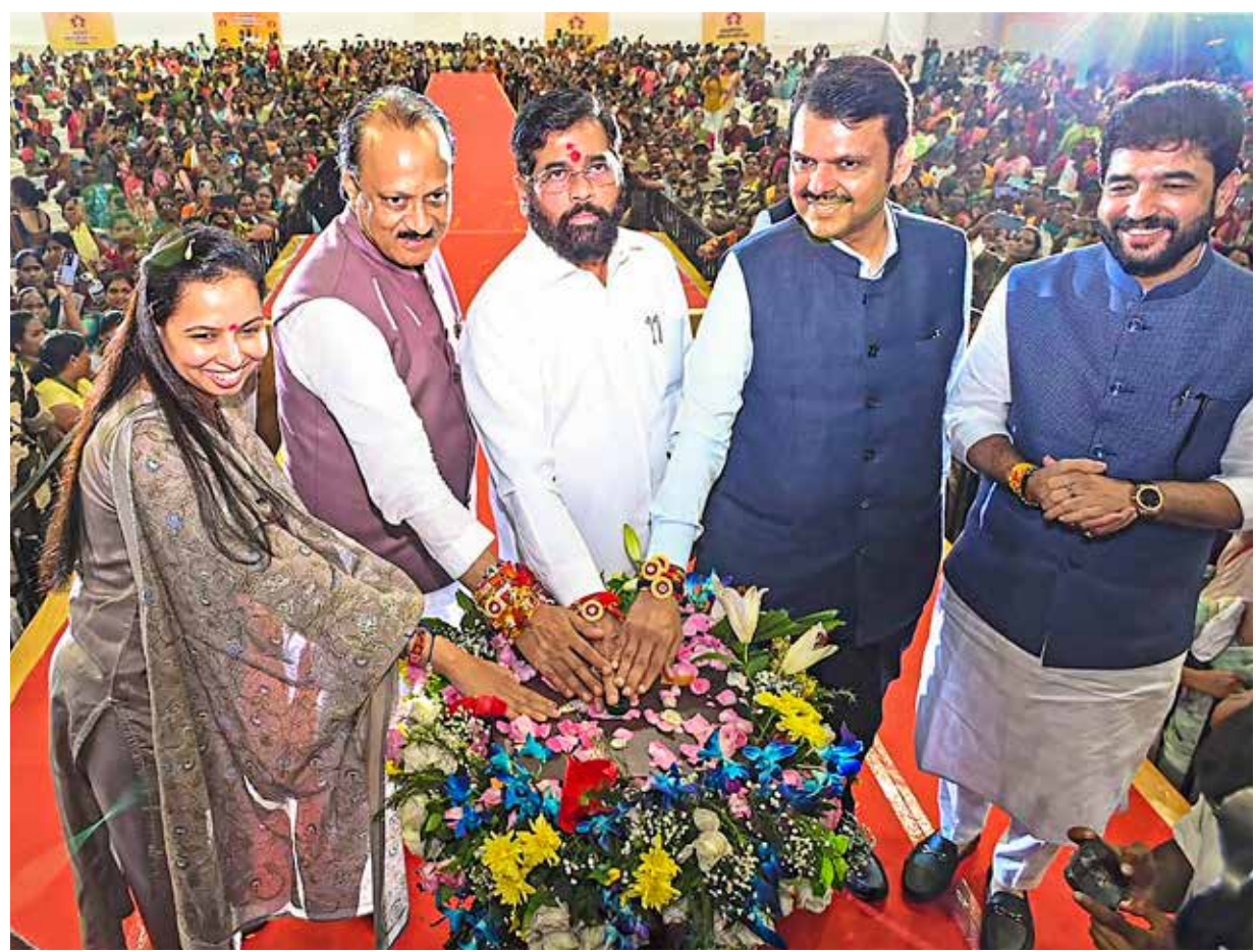
Chief Minister Eknath Shinde and Deputy Chief Ministers Devendra Fadnavis and Ajit Pawar during the launch of 'Mukhyamantri Majhi Ladki Bahin' scheme at Balewadi area, in Pune district on Saturday.

"The opposition will never realise the value of Rs 1,500. We are not born with a golden spoon in the mouth. Maha Vikas Aghadi was in power for 2.5 years. Did they give a single rupee to women? Don't worry, this scheme will continue," the chief minister added.