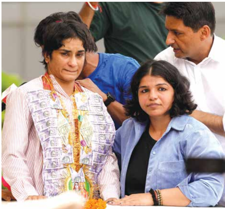
Vinesh arrived from Paris to New Delhi on Saturday.

contingent across 12 disciplines for the Paralympics slated in Paris from August 28-September 8. Tokyo Paralympics gold medal-winning shuttler Pramod Bhagat was handed an 18-month suspension for breaching BWF's anti-doping whereabouts clause. "Look, there is no doubt that Pramod Bhagat is our star athlete but the target of 25 medals that we have set is from our current contingent of 84 players. Pramod Bhagat is not included in this," the two-time Paralympics gold medal-winning javelin thrower Jhajharia told 'PTI Bhasha'. "Pramod being a gold medal winner of the last Games not being in the Indian team is extremely sad and unfortunate, but we cannot do anything." Asked about his confidence about target of 25 medals, he said,