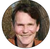
By Christoph Ernst

The rise of right-wing populism in Europe, often characterized by figures like Viktor Orbán in Hungary and Jörg Haider in Austria, is not merely a reaction to domestic discontent but a broader challenge to what many view as an increasingly authoritarian European Union. The real conflict, it seems, lies between national sovereignty and a supranational body that increasingly dictates policy to its member states often without democratic accountability. For critics, the EU has become a 'hyperstate' of unelected officials who meddle in everyday life, from immigration quotas to economic policy, and even the limits of free speech.