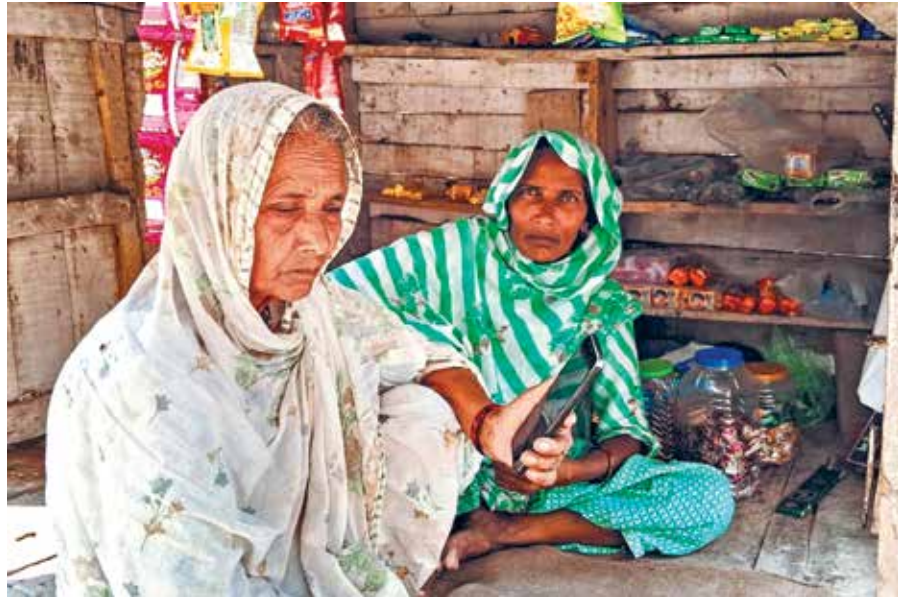
Family members mourn the death of NCP leader and former Maharashtra Minister Baba Siddique at his ancestral village Manjha in Gopalganj district of Bihar on Monday.