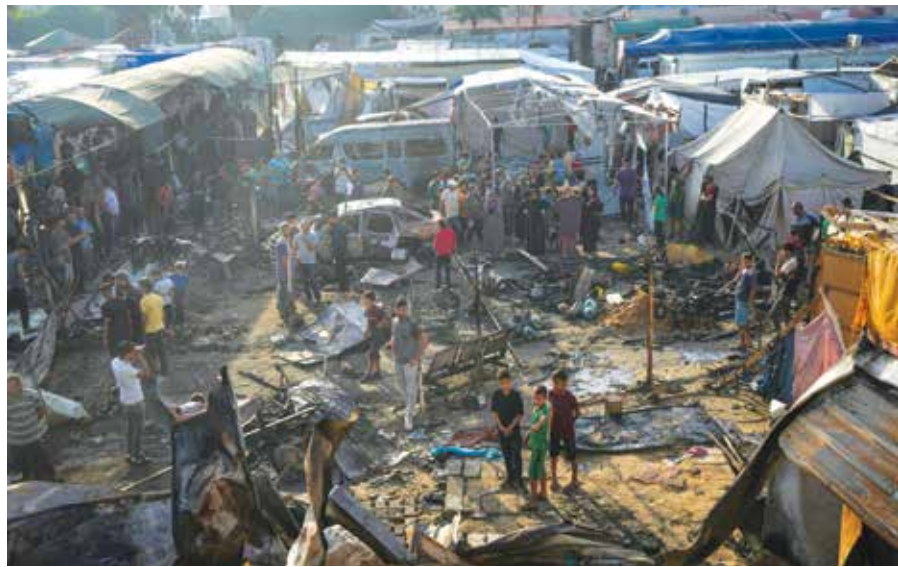
Palestinians look at the damage after an Israeli strike hit a tent area in the courtyard of Al Aqsa Martyrs hospital in Deir al Balah near Gaza Strip on Monday.

Hospital records showed that four people were killed and 40 wounded. Twenty-five people were transferred to the Nasser Hospital in southern Gaza after suffering severe burns, according to the Al-Aqsa Martyrs Hospital.