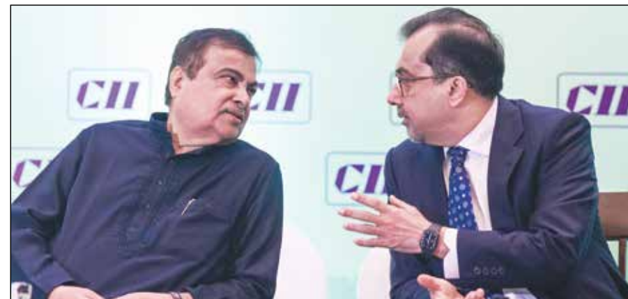
Union Minister of Road Transport and Highways Nitin Gadkari with CII President Sanjiv Puri during a session at the CII Bioenergy Summit 2024 in New Delhi on Monday.