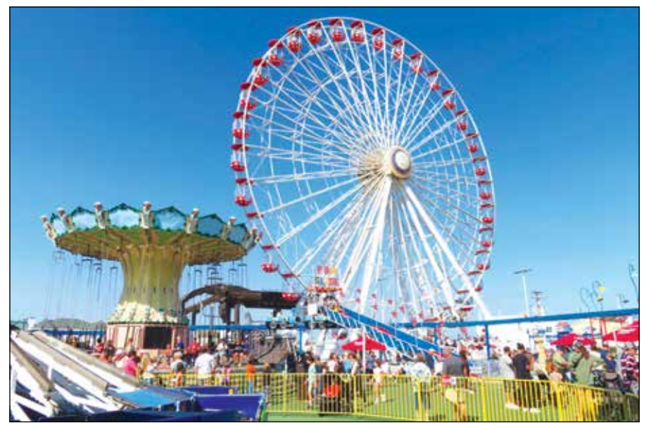
People ride the Giant Wheel and flying chair ride at Gillian's Wonderland, the popular amusement park on the boardwalk in Ocean City of New Jersey, US.