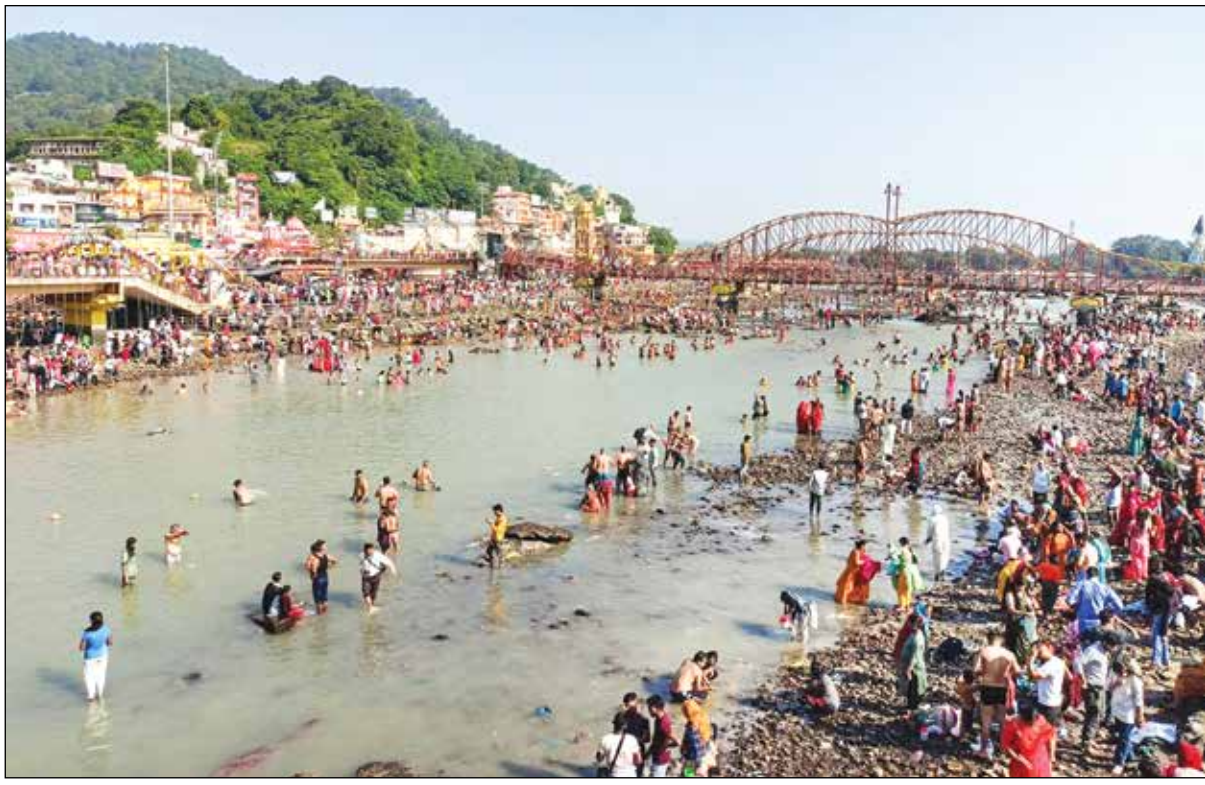
Devotees take bath at Har Ki Pauri in Haridwar on Monday. The main stream of Ganga has been closed at Har Ki Pauri from October 12 to November 3 for the annual repair and cleaning work.