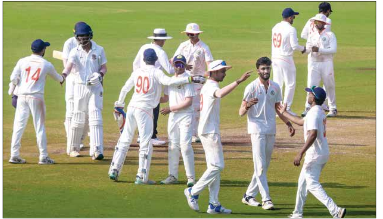
Players of Vidarbha and Andhra greet each other at the end of their Ranji Trophy cricket match in Nagpur on Monday. Vidarbha won the match.