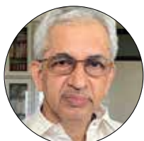
By Pravin Dixit

The increasing number of cybercrimes occurring daily is both alarming and traumatic. No one is exempt; it affects nearly everyone—rich or poor, educated or uneducated, men and women, young and old. The criminals are often invisible or use fake identities, while victims tend to be gullible and unsuspecting. Most do not report these crimes due to shame, fear, or lack of awareness. By the time they realise they've been cheated, significant time has passed, allowing the criminals to complete their transactions and withdraw the funds.