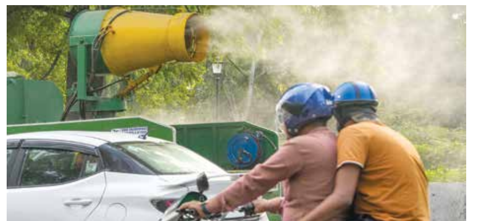
An anti-smog gun being used to curb air pollution in New Delhi on Sunday.

The environment minister said that over the past two years, Delhi has recorded 200 days of "good," "satisfactory," or "moderate" air quality between