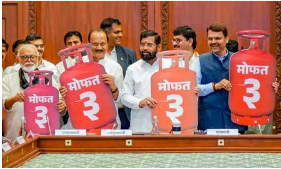
Chief Minister Eknath Shinde with Dy CMs Ajit Pawar and Devendra Fadnis at an Annapurna Yojana event.

"I am happy today that the decision we have made