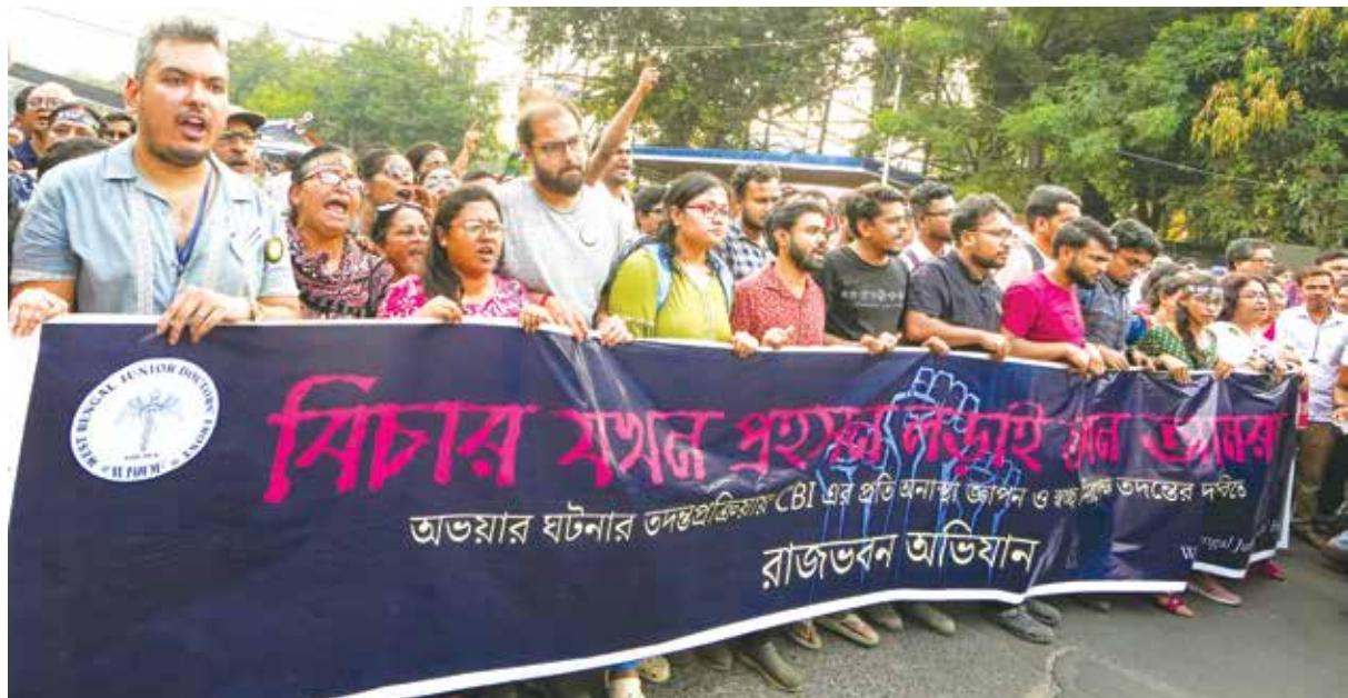
Junior doctors take part in a protest march to Raj Bhavan demanding a quick and transparent probe into the alleged sexual assault and murder of a trainee doctor in Kolkata on Monday.