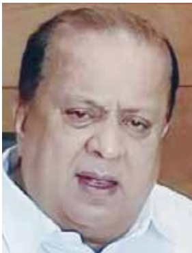
Hassan Mushrif, Leader NCP