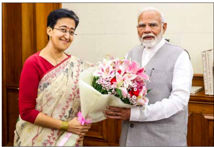
Prime Minister Narendra Modi with Delhi Chief Minister Atishi during a meeting in New Delhi. Pic: PTI

A large number of police personnel were deployed near the temple. -PTI